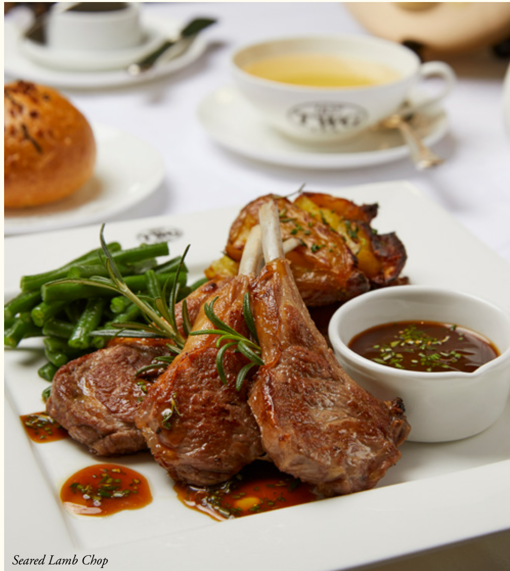
Seared Lamb Chop

Seared New Zealand lamb chop accompanied by green beans and smashed potatoes, served with a Houjicha infused black garlic and rosemary lamb jus.