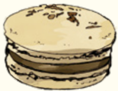
Vanilla Bourbon Tea & Blackcurrant