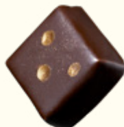
Matcha Nara, White Chocolate Ganache