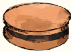
Earl Grey Fortune & Chocolate