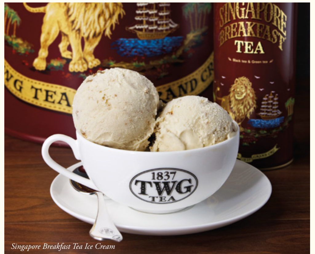
Singapore Breakfast Tea Ice Cream