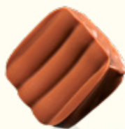
African Ball Tea, Peanut & Salted Caramel