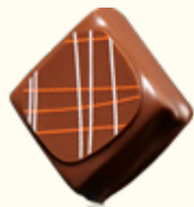
Polo Club Tea, Chestnut & Apricot