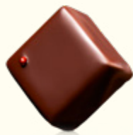
Singapore Breakfast Tea & Hazelnut