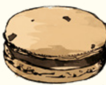
Number 12 Tea & Tiramisu