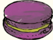
Grand Wedding Tea, Passion Fruit & Coconut