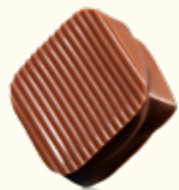
1837 Green Tea, Raspberry & Caramel