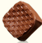
Brothers Club Tea, Maple Syrup & Pecan