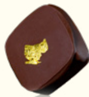
Earl Grey Fortune, Dark Chocolate Ganache