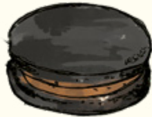
Napoleon Tea & Caramel