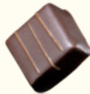
Napoleon Tea & Caramel

Only available at TWG Tea Salons & Boutiques at MBS on the Bay and Takashimaya B2