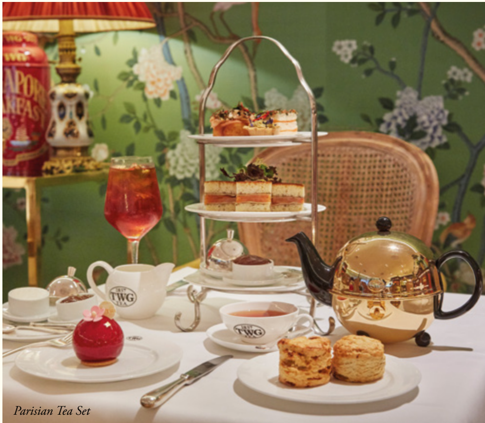
Parisian Tea Set