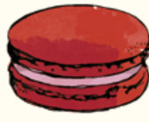
Silver Moon Tea & Strawberry