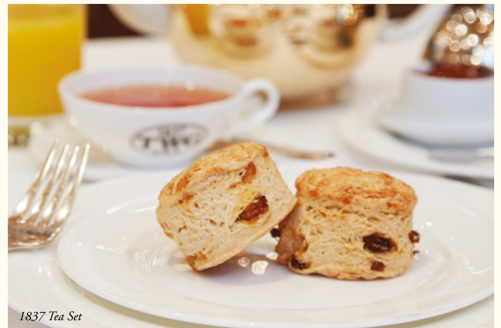
1837 Tea Set