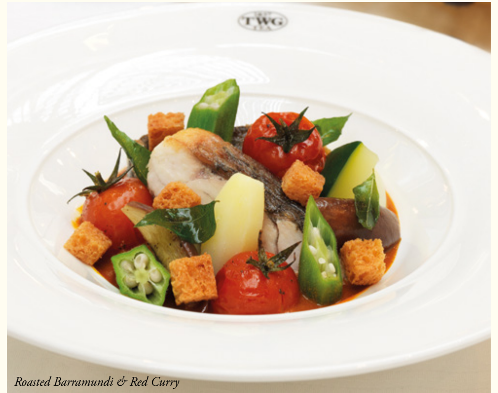
Roasted Barramundi & Red Curry