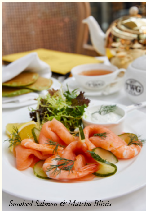
Smoked Salmon & Matcha Blinis