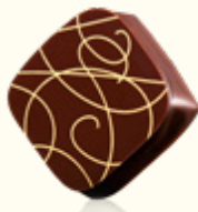
Lemon Bush Tea, White Chocolate Ganache