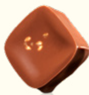
Miraculous Mandarin Tea, Sesame & Honey