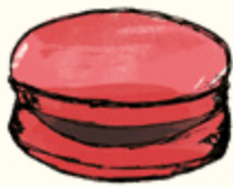
1837 Black Tea & Blackcurrant