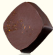
Vanilla Bourbon Tea & Dark Chocolate