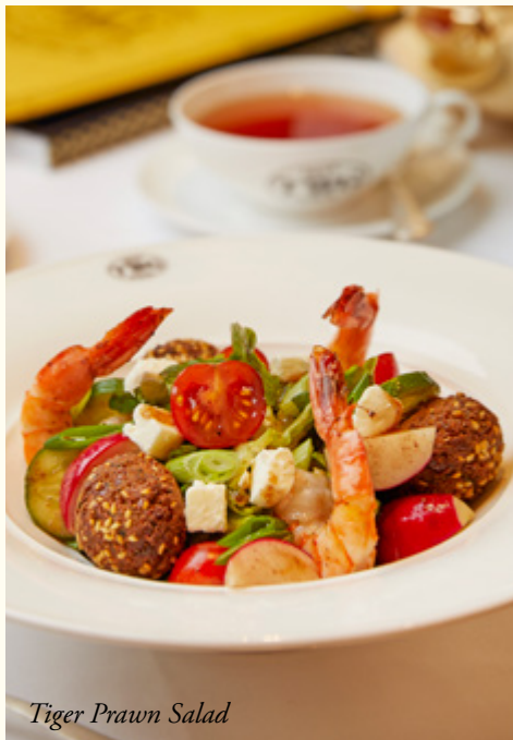
Tiger Prawn Salad