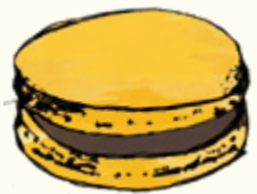
Lemon Bush Tea