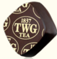
1837 Black Tea, Dark Chocolate Ganache