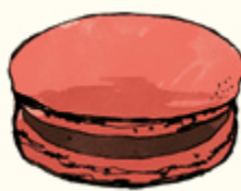
Bain de Roses Tea