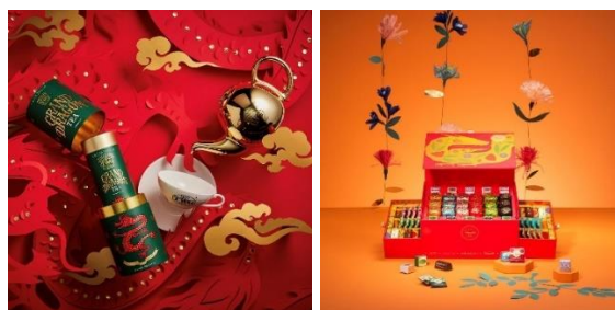
From L to R: TWG Tea's Grand Dragon Tea and Venchi's limited-edition gift collection make the perfect gifts for loved ones this joyous Lunar New Year.

Savour rich and authentic flavours of Punjab Grill's Special Lunar New Year Menu (S$110++), featuring the restaurant's Charcoal Grill Lamb Chop and aromatic Patiala Murgh , available on 10 and 11 February. Rejoice with loved ones while enjoying the signature Chaot Yu Sheng , which will be served from 1 to 11 February. Over at CÉ LA VI , experience abundance with Yusheng , highlighting a blend of house-smoked salmon, white daikon and mango, adorned with a special sour plum and lemongrass dressing and drizzled in liquid nitro pomelo. Meanwhile, Sen of Japan's Prosperity Salmon Yu Sheng (from S$68++) offers a vibrant assortment of auspicious ingredients, with an option of caviar, harmoniously tossed together for a year of abundance and good fortune.