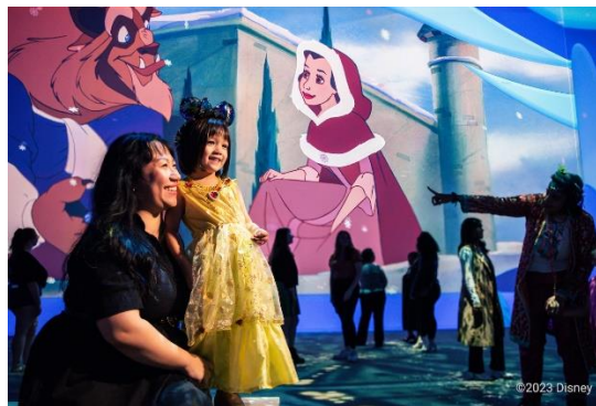
Base Entertainment Asia presents a 360-degree multi-sensory experience at Immersive Disney Animation , from now till 25 February at Sands Theatre.

Visitors are invited to embark on a magical journey through a century of Disney's animated wonders at Immersive Disney Animation at Sands Theatre until 25 February. Here, they can dive into the enchanting world of Disney, explore the artistry of animators and the evolution of iconic scenes, characters and songs. They are also encouraged to partake in a thrilling 360-degree experience in the Show Gallery, featuring scenes from The Little Mermaid and Frozen II . Secure your tickets starting at S$33 (excluding booking fee) for a magical Lunar New Year celebration at www.marinabaysands.com/entertainment/shows/immersive-disney-animation .