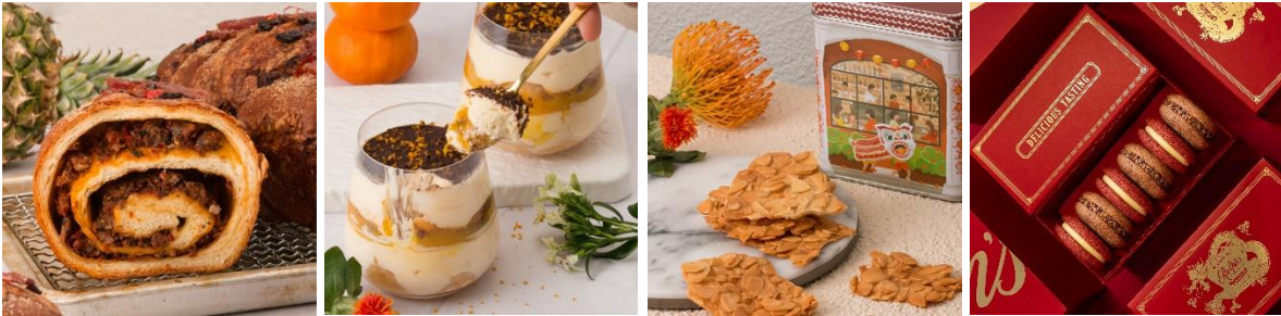
From L to R: Da Paolo Gastronomia's Bakkwa Pineapple Dragon Bread , Mandarin Tiramisu and Almond Crisps as well as Ralph's Coffee's New York Cookie Box make the perfect medley of sweet and savoury.

Savour a selection of festive treats from Da Paolo Gastronomia , including the home-baked Bakkwa Pineapple Dragon Bread , Mandarin Tiramisu , and Almond Crisps , and Ralph's Coffee 's limited edition New York Cookie Box (S$42) with its exclusive Orange Hazelnut Cookie Sandwich whilst catching up with loved ones this season.