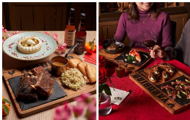
(from L to R): Yardbird ushers in Lunar New Year with slow cooked lamb Denver ribs and pineapple tart , while Yardbird's platter of land & sea sets the stage for romance this Valentine's Day

For reservations, visit marinabaysands.com/restaurants/rise.html .