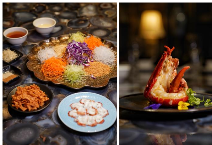
Mott 32 presents an eight-coursed opulent feast featuring auspicious dishes this Lunar New Year

Come Valentine's Day (14 February), enchant your lover with an unforgettable sky-high date at LAVO over a limited time à la carte menu. Welcome the evening with an octet of fine de Claire oysters (S$60++), a refreshing starter topped with green apple granita, before indulging in risotto langoustine and champagne (S$50++). For a more extravagant celebration, opt for the grilled lobster, crustacean butter, caviar (S$180++) headlined by 1.2 kilograms of Australian spiny lobster, perfect for sharing. While revelling amidst twinkling city lights 57 storeys high with a cocktail in hand, round off the date with red velvet 20-layer cake (S$28++). For reservations, visit marinabaysands.com/restaurants/lavo.html .