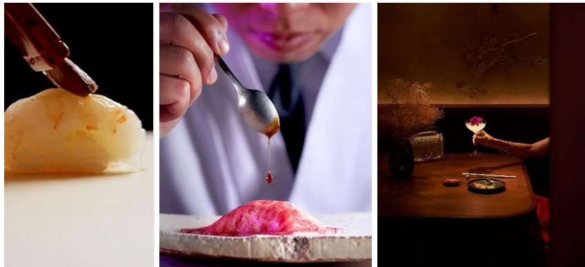
WAKUDA welcomes The Sushi Experience , a 13-course journey through the seasons and flavours of Japan

Fans of WAKUDA Restaurant & Bar by celebrated chef Tetsuya Wakuda can look forward to The Sushi Experience (S$128++ per person), a new 13-course contemporary dining offering that journeys guests through the seasons and flavours of Japan. Begin the intimate evening with WAKUDA's signature flan with Hokkaido sweet corn , before tasting nine different types of nigiri sushi starring seasonal ingredients harvested at their peak. Round off the adventure with negi toro roll sushi and WAKUDA's miso soup brimming with fresh nori (seaweed), junsai (watershield) and tofu, and sweeten up with chef's dessert of the day .