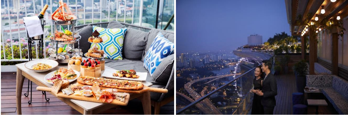
(from L to R): Tuck into LAVO's popular Sunday Champagne Brunch with special Lunar New Year treats; soak in unparalleled views of Singapore's skyline with your date on Valentine's Day

Ring in an extraordinary second day of the Lunar New Year (11 February) with a festive edition of LAVO Italian Restaurant & Rooftop Bar's Sunday Champagne Brunch from 12pm to 3pm. Come dressed in auspicious colours of gold and red amidst a resplendent line-up of mandarins and lanterns at the sky-high venue. In addition to brunch favourites such as chunky poached lobsters , charcuterie board , wood-fired pizzas and comforting Italian American delicacies from LAVO's famous 'meatball' to pasta tomato basil and salmon oreganato , diners can also look forward to a jubilant assortment of desserts, complete with free-flowing champagnes, cocktails, wines and beers. Available for takeaway from 8 to 12 February, the Lunar New Year edition of LAVO's signature 20-layer cake promises a show-stopping entrance at reunions with its glorious gold exterior and mandarin orange chocolate cream layers (S$228++ for a whole cake; minimum 48 hours to pre-order).