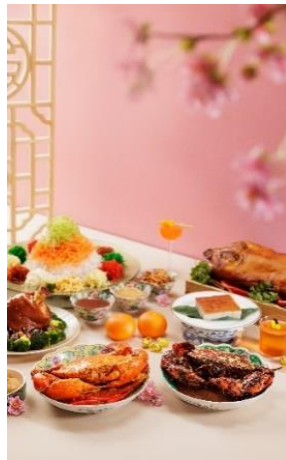
RISE presents an extravagant Lunar New Year feast

Pre-orders begin online on 25 January, while collection will be available from 29 January until 24 February at Origin + Bloom located in the lobby of Hotel Tower 3. For enquiries, marinabaysands.com/restaurants/origin-and-bloom.html .