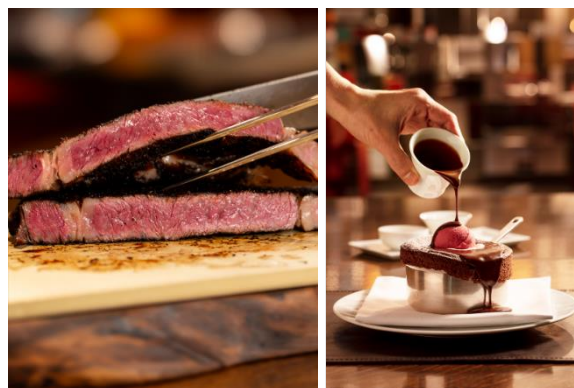
Indulge in one Michelin-starred sophistication this Valentine's Day with a specially curated menu at CUT by Wolfgang Puck

Come 14 February, celebrate love and sweet romance with Black Tap's Red Velvet Cake Shake (S$24++). The exclusive CrazyShake® features a red velvet cake batter shake served in a towering glass with a vanilla frosted rim and red and white sprinkles, crowned with a slice of red velvet cake, whipped cream, and chocolate drizzle. For reservations, visit marinabaysands.com/restaurants/blacktap.html .