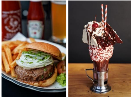
(from L to R): Black Tap's Asian Black Pepper Burger, Red Velvet Cake Shake, McCormick Burger and Mocha Tamarind Churro CrazyShake® headline joyous celebrations this February

Ring in the auspicious Lunar New Year with Black Tap's Asian Black Pepper Burger (S$24++), available from 1 to 14 February. Combining bold Asian spices with a succulent prime beef patty glazed in rich black pepper sauce, the flavourful burger is topped with shaved onions and scallion on soft toasted buns and served with fries. Pair the special treat with a pint of Black Tap's refreshing craft beer or handcrafted cocktail as you savour every bite.