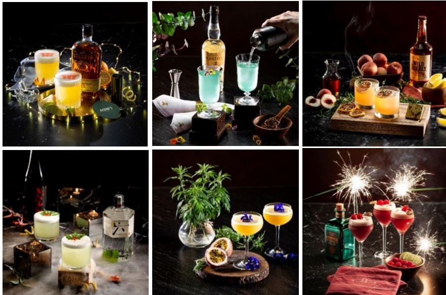
Marina Bay Sands’ mixologists have created their most imaginative cocktails to date (clockwise from top left): ADRIFT’s Re:Imagination ; Mott 32’s East Atlantis ; Yardbird’s Bourbon by the Bay ; db Bistro’s Off the Runway ; Renku’s Two-0-Two-0 ; and Koma’s Dusk to Dawn

A spectacular showcase of over 10 unique cocktails across Marina Bay Sands’ award-winning restaurants, 10 Years of Mixology invites guests to journey with the integrated resort down memory lane and through the passage of time, as it looks to reimagine the future.