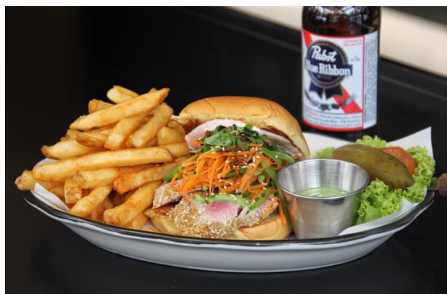
Black Tap introduces the Tuna Furikake burger as a limited-time special for the month of September only

From 30 October to 1 November, celebrate Halloween in style with The Halloween Shake (S$22++) at Black Tap Craft Burgers & Beer . Exclusively available for three days only, the whimsical chocolate-based CrazyShake ® is a visual feast, featuring a vanilla frosted rim plastered with candy corn, a chocolate 'spider-web' cupcake, orange and white twisty pops, orange rock candy, and a generous dollop of whipped cream speckled with orange sprinkles and chocolate drizzle.