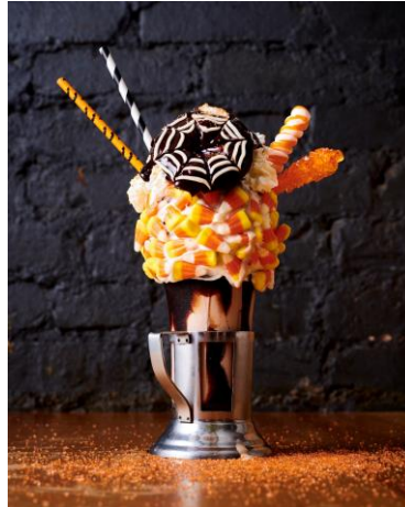
Begin the trick or treat session with a towering The Halloween Shake

From 30 October to 1 November, celebrate Halloween in style with The Halloween Shake (S$22++) at Black Tap Craft Burgers & Beer . Exclusively available for three days only, the whimsical chocolate-based CrazyShake ® is a visual feast, featuring a vanilla frosted rim plastered with candy corn, a chocolate 'spider-web' cupcake, orange and white twisty pops, orange rock candy, and a generous dollop of whipped cream speckled with orange sprinkles and chocolate drizzle.