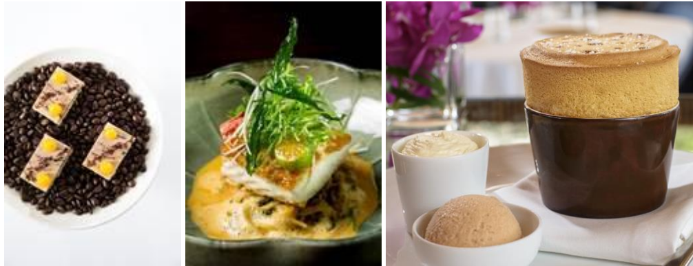
Spago's sunset menu features the restaurant's greatest hits (from L to R): kaya toast ; Japanese sea bream "laksa" ; and salted caramel soufflé

Experience sky-high dining at its best at Spago by Wolfgang Puck , as the restaurant presents a three-course sunset menu (S$78++) comprising its timeless classics and seasonal specials. Bask in the golden hour and start the evening with a seasonal handmade sweet corn agnolotti , featuring pockets of handmade pasta packed with sweet corn and mascarpone, coated in delicious sage butter sauce and topped with parmigiano reggiano, or the innovative kaya toast (top up S$10++) – a delicate treat of seared foie gras, pandan-coconut jam and foie gras-esspresso mousse atop a crisp toasted brioche.