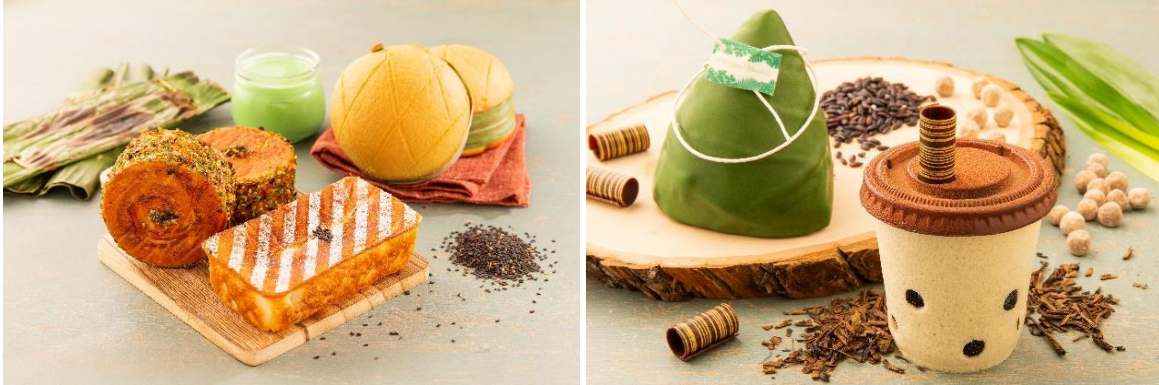
Enjoy artisan viennoiseries at Origin + Bloom (clockwise from left): otah-otah bun , pandan kaya bun and black sesame mochi bun ; indulge in Instagram-worthy desserts such as (from L to R): sweet dumpling and hojicha bubble tea