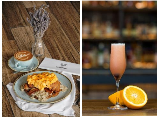
(From L-R): Delight in Yardbird's new brunch item bacon hash waffle & eggs ; guests can also enjoy free-flow glasses of the Southern Mimosa at S$30++

Classic American restaurant Yardbird Southern Table & Bar has recently refreshed its Great American brunch menu, available on weekends from 10am – 4pm. Kickstart the weekend with the new bacon hash waffle & eggs (S$24++), a dynamic combination of scrambled farm fresh eggs with chives and smoky bacon atop a fried hash waffle, complete with country gravy. For an elevated brunch, top up an additional S$10++ for a side of the restaurant's famed crispy chicken. Complete any entrée with the Sunny Morning Set (S$36++), which includes a choice of freshly squeezed juice such as green giant or orange ya glad , and coffee or tea. Those looking for a boozy brunch experience can also opt for 2-hour free-flow glasses of the citrusy Southern mimosa (S$30++).