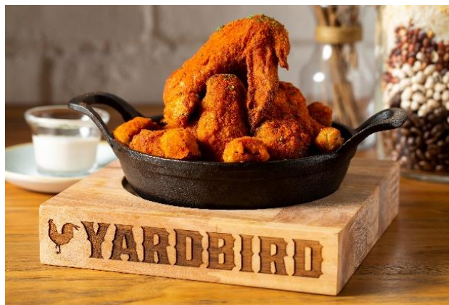
Experience the best of Yardbird's signature 100-year-old family fried chicken recipe over the Southern Fried Chicken Month menu

Classic American restaurant Yardbird Southern Table & Bar has recently refreshed its Great American brunch menu, available on weekends from 10am – 4pm. Kickstart the weekend with the new bacon hash waffle & eggs (S$24++), a dynamic combination of scrambled farm fresh eggs with chives and smoky bacon atop a fried hash waffle, complete with country gravy. For an elevated brunch, top up an additional S$10++ for a side of the restaurant's famed crispy chicken. Complete any entrée with the Sunny Morning Set (S$36++), which includes a choice of freshly squeezed juice such as green giant or orange ya glad , and coffee or tea. Those looking for a boozy brunch experience can also opt for 2-hour free-flow glasses of the citrusy Southern mimosa (S$30++).