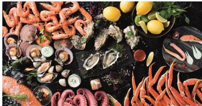
Delight in bountiful selections of seafood over RISE's Seafood Week

From 5 to 11 October, Marina Bay Sands' international buffet restaurant RISE returns with its famed Seafood Week (S$108++ per adult; S$38++ per child) during dinner. Diners can look forward to unlimited servings of seafood specials presented in a la carte style served tableside, as part of RISE's redesigned buffet experience. For starters, enjoy the freshest catch of the season over a bountiful seafood platter , featuring Canadian snow crab, tiger prawns, scallops on the half shell, and other highlights such as the succulent fresh oysters with mignonette sauce .