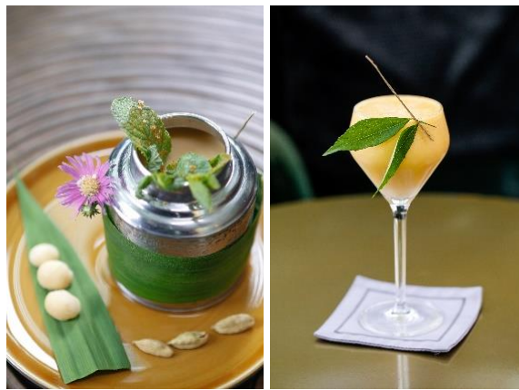
(From L-R): Relish in Renku's refreshing yogurt-based Rosella Lassi or Salted Egg , a local twist on the Dutch festive tippel Advocaat