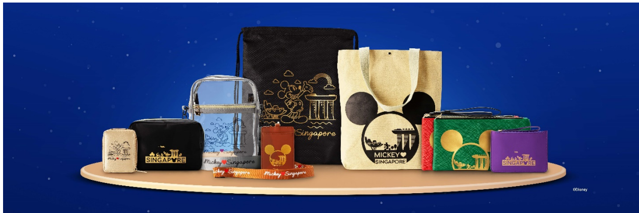
More than 50 types of Disney-branded premiums will be available exclusively through SRL at Marina Bay Sands

The campaign will allow visitors to get their hands on over 50 types of Disney-branded premiums that are exclusive to Marina Bay Sands. These range from tote bags and t-shirts to leather backpacks and pouches, and are available from 20 August 2021 through the integrated resort's loyalty programme, Sands Rewards Lifestyle (SRL) .