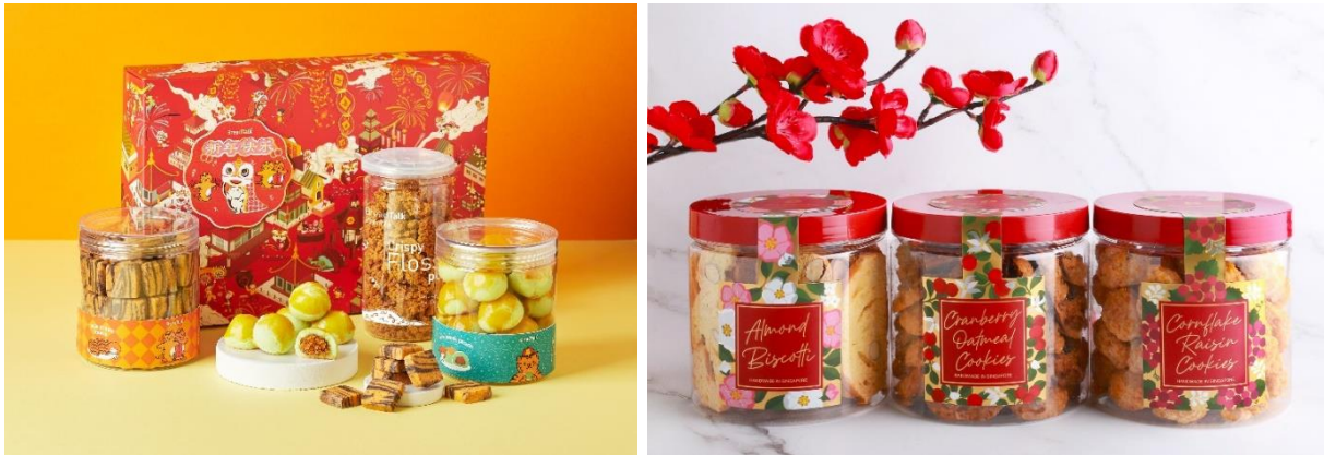
(L to R): BreadTalk's collection of irresistible festive treats and Da Paolo Gastronomia's Almond Biscotti, Cranberry Oatmeal Cookies and Cornflake Raisin Cookies

Leap into the new year with BreadTalk's collection of irresistible festive treats. Available till 15 February, customers can enjoy two bottles of assorted cookies and one bottled floss for only S$32.80 as part of its Little Blessings Set . The assortment of cookies ranges from the classic flavours such as mini pineapple pastry and cashew nut cookies, to unique creations such as tiger stripe cookies.