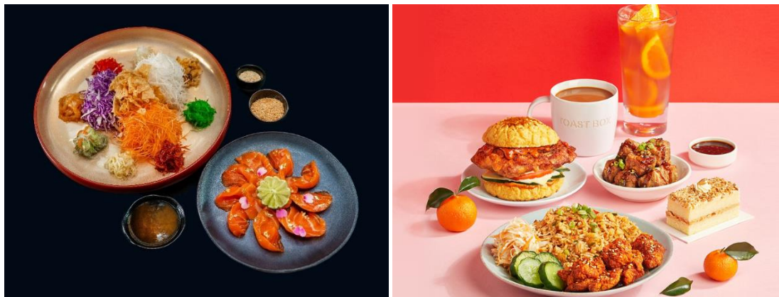
(L to R): Sen of Japan's Prosperity Salmon Yu Sheng and Toast Box's Fiery Feast Set

Huddle around and indulge in PUTIEN's Pot of Goodies (from S$198++), featuring 12 delectable ingredients such as abalone, sea cucumber, prawns, dried scallop and fish maw. Enjoy a complimentary PUTIEN's Mazu Mee Sua Gift Box with every Pot of Goodies takeaway ordered, valid from now till 15 February or while stocks last.