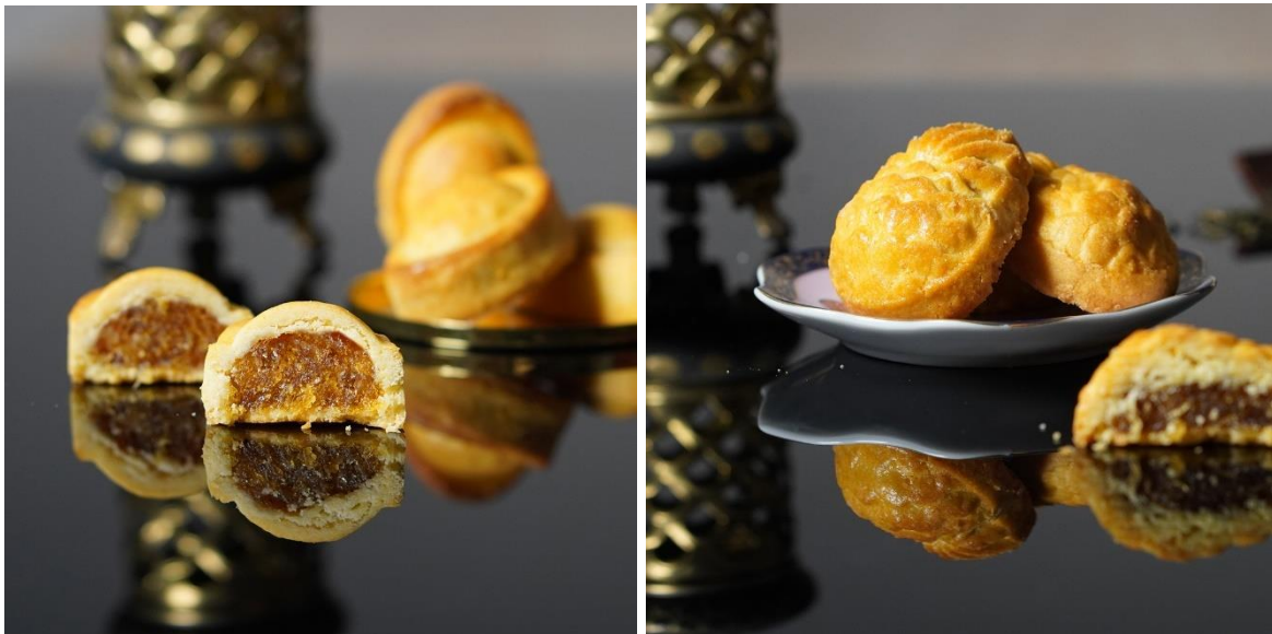
(L to R): Old Seng Choong's Original Pineapple Tarts and Yuzu Pineapple Tarts

From 14 January to 15 February, visitors can redeem a complimentary box of biscuits with every S$188 spent at Bacha Coffee . With every purchase of a gift hamper worth S$288 and above, visitors will receive a complimentary Autograph Canister.