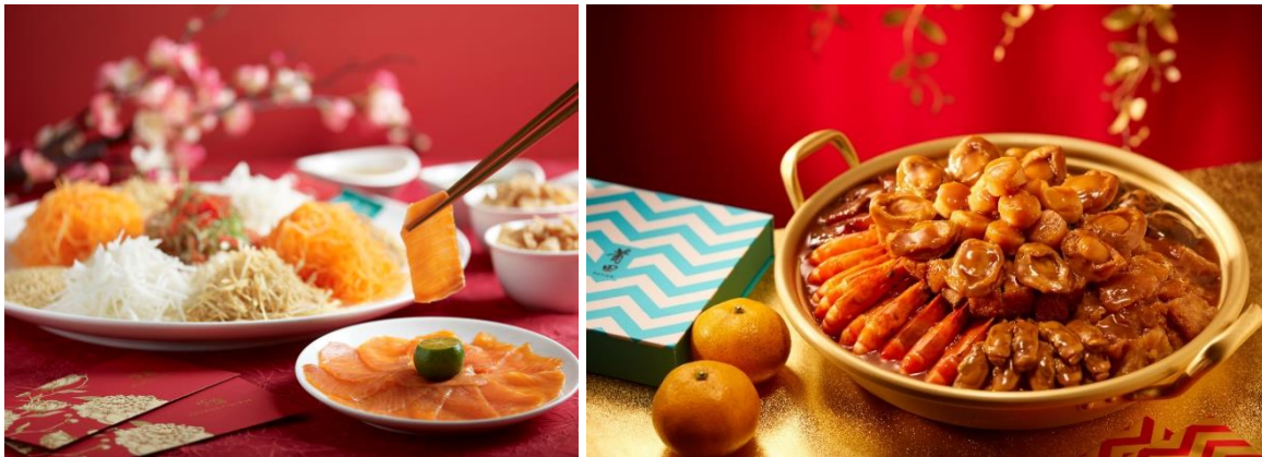
(L to R): Imperial Treasure Fine Chinese Cuisine's Fatt Choy Smoked Salmon Yu Sheng and PUTIEN's Pot of Goodies

Make room for blessings and good fortune with quintessential reunion dishes at Imperial Treasure Fine Chinese Cuisine . From now till 15 February, indulge in specially curated Chinese New Year Set Menus from S$168++ per person and be treated to delicacies such as Fatt Choy Smoked Salmon Yu Sheng , Baked Australian Lobster with Superior Broth , Peking Duck and more. Other festive indulgence includes the 5-Head Fresh Abalone Treasure Pot (S$468++), an extravagant pot studded with premium ingredients. Pre-order for takeaways is available online from 10 January to 31 January.