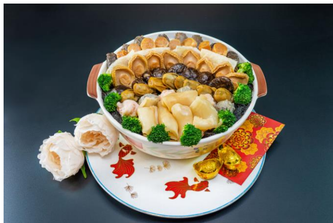
BLOSSOM's Auspicious Treasure Pot

Ring in the Year of the Tiger with BLOSSOM's six curated auspicious festive menus, starting from S$888++ for five guests, or enjoy the restaurant's delectable Auspicious Treasure Pot (S$568+ for eight pax) in the comfort of one's home. The treasure pot is a trove of premium-grade delicacies, symbolising layers of blessings and an abundance of food, wealth and prosperity for the New Year. Both set menus and the Auspicious Treasure Pot must be pre-ordered, and are only available from 25th January to 15 February 2022.