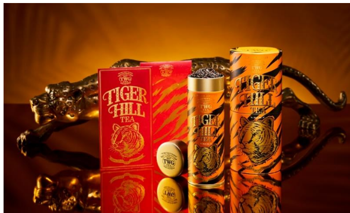
TWG Tea's Tiger Hill Tea

golden brown. The refreshing Yuzu Pineapple Tarts (S$29.80) features pineapple jam infused with citrusy yuzu juice and pulp, packed in a dainty pineapple tart shape. The Chocolate Orange Sea Salt Cookies (S$22.80) – made with intense dark chocolate and scented with natural orange oil – are the perfect sweet treat, while the Ginger Black Tea Cookies (S$22.80) are reminiscent of traditional ginger snaps that carry a subtle hint of ginger, completed with black tea and bergamot oil. Visitors can enjoy an early bird discount of 20 per cent when they purchase the treats before 15 January.