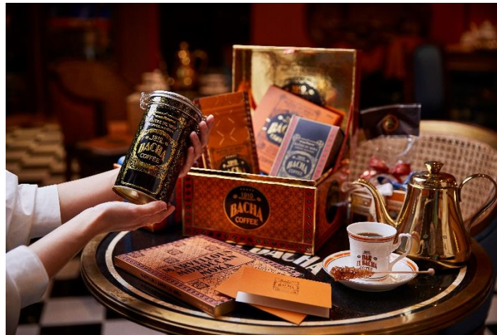
Every purchase of a Bacha Coffee gift hamper worth S$288 and above comes with a complimentary Autograph Canister

From 14 January to 15 February, visitors can redeem a complimentary box of biscuits with every S$188 spent at Bacha Coffee . With every purchase of a gift hamper worth S$288 and above, visitors will receive a complimentary Autograph Canister.