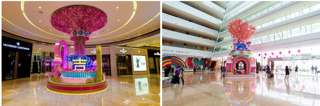
(L to R): Festive displays for visitors at The Shoppes and Marina Bay Sands' hotel lobby

As one explores the multitude of retail offerings at the integrated resort, bask in the spirit of spring surrounded by sprigs of plum blossoms and hues of pink, a symbolism for hope and warmth in the Year of the Water Tiger ahead. Visitors can also take a peek of their year's fortunes at the displays located on the Grand Colonnade of The Shoppes.