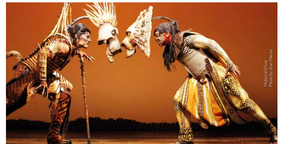
Mufasa and Scar

Discover the magic of Spectra and experience a captivating light and water display like no other. A reflection of Singapore's journey as a multicultural society into the cosmopolitan city she is today, this 15-minute visual spectacular is shown free nightly at the Event Plaza.