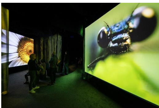
Left: Be immersed in the bats' world of Echolocation Right: Encounter insects and plants amid the grassland

Developed by a cross-disciplinary team of artists, designers, biologists, engineers, developers, neuroscientists, scent-makers, and media specialists, this multi-sensory show sits at the crossroads of exhibition, performing arts, cinema and technological innovation, as well as cognitive and natural sciences.