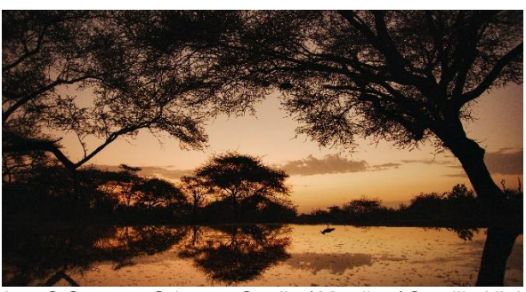
Left: A lone visitor floating amongst Greenland's glaciers © Sensory Odyssey Studio / Mardi 8 / Camille Niel Right: Image still from Savannah Night © Sensory Odyssey Studio / Mardi 8

As explorers for a day, visitors to the exhibition will join animals at a watering hole in the African Savannah, perch atop the rainforest canopy in French Guiana, and take to the skies with bats as they hunt for food. Visitors can also experience swimming with a family of giant sperm whales in the ocean near Mauritius and float across polar landscapes in the far north of Greenland, or even shrink in size to burrow into the ground before emerging in grasslands filled with pollinating insects.