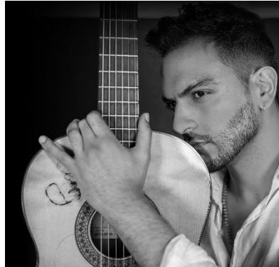
From L-R: Artists performing at Latinfest 2023! on 29 July at Sands Expo & Convention Centre

Rounding up the festival's new highlights is Latinfest 2023! , which is set to bring non-stop musical excitement with a line-up of exceptional artists to immerse showgoers in the vibrant world of Latin music. Held at Sands Expo & Convention Centre on 29 July, the one-day carnival of music will treat music fans to captivating performances of diverse musical styles, inviting all to dance, sing, and connect with the infectious rhythms and vibrant spirit of Latin music.