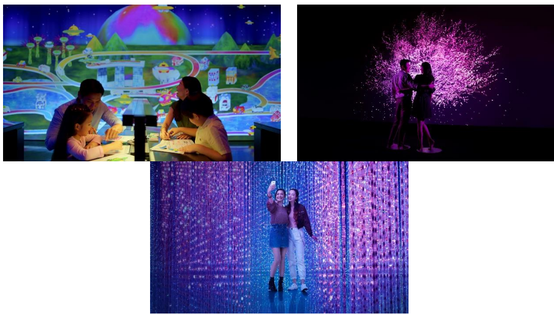
(From L-R) Image stills from the brand campaign for the three key audience segments – families, couples and friends

The campaign, titled "A Different Kind of Museum", positions ArtScience Museum as a museum like no other – allowing people to explore, co-create, play and interact in an immersive and fun filled environment. Running throughout 2021, the campaign will feature ArtScience Museum's anniversary programme, focusing on a year of brand-new exhibitions and unique events. The first two "A Different Kind of Museum" videos can be viewed <a href="here">here</a> (Romance) and <a href="here">here</a> (Binge-ing).