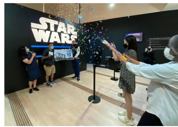
(From L-R) Lucky visitors were also identitifed at Planet or Plastic? and STAR WARS Identities

From now till 28 February, ArtScience Friends are invited to share their favourite memories or photos at ArtScience Museum on Facebook or Instagram with the following hashtags – #ASM10 and #ADifferentKindofMuseum. Upon showing their posts at the Museum's Visitor Experience counter, ArtScience Friends will receive a complimentary ArtScience Museum enamel mug.