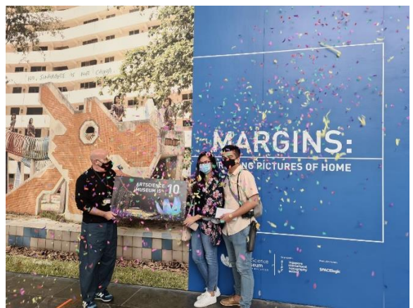
(From L-R) Lucky visitors at Future World and Margins were presented with complimentary ArtScience Friends membership