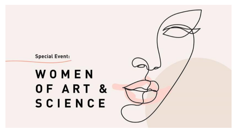
ArtScience Museum celebrates the Women of Art and Science this November

Singapore (9 November 2020) – This November, ArtScience Museum is dedicating a special event to the women of art and science with a specially curated line-up of onsite and online programmes from now till 27 November.