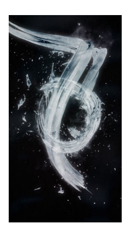
Enso - Cold Light 2018 Digital Work, Single Channel, Continuous Loop Artwork by teamLab

An ensō is created through the Zen practice of drawing a circle in a single brushstroke. It is said to symbolise enlightenment, the universe and equality teamLab have brought the ensō into the 21st century with a digital version that glides into existence before slowly dissolving into nothingness. In the Buddhist tradition monks were often taught this style of ink painting as a type of meditative practice. When the mind is still the monk takes up a brush and, in a single stroke, attempts to paint a perfect circle. Whilst perfection is almost impossible to achieve, this artistic expression of zero, or nothingness, stimulates deep contemplation. The circle in Enso - Cold Light reflects the hearts and minds of those who view it, with its interpretation left to the individual.