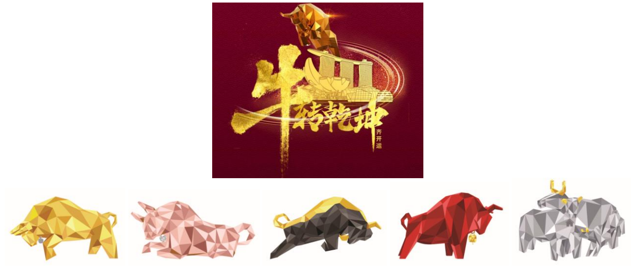
Auspicious Year of the Ox charms represent (from left-right): Health, Love, Prosperity, Luck, Family

Sands Rewards LifeStyle members can win and collect auspicious Year of the Ox collectibles in 35 different designs to usher in good health and fortune this Lunar New Year. Members simply swipe their membership card at the capsule machines located on Galleria Level, B1, of The Shoppes (above Sampan Rides), to win up to S$1,000 reward dollars<sup>5</sup> alongside the premium collectibles and exclusive SRL red packet envelopes. New SRL members get a free chance at the capsule game, with subsequent chances<sup>6</sup> requiring a minimum S$300 spend (before applicable taxes) in a single transaction.