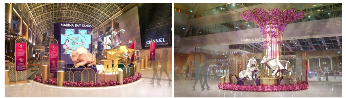
Immerse in the joyous Spring Festival across Marina Bay Sands' resplendent Year of the Ox installations

Singapore (25 January 2021) – Ring in a joyous Lunar New Year at Marina Bay Sands as the integrated resort welcomes the Year of the Ox with a host of culinary specials, retail indulgence and festive activities.