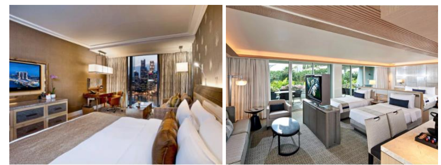
Enjoy a fun-filled staycation at Marina Bay Sands with your family this Lunar New Year (from L-R): Deluxe Room; Family Room

From 25 January to 25 February 2021, indulge in a festive getaway with Marina Bay Sands' limited time <u>Auspicious Staycation<sup>1</sup></u> package from S$788++, which entails complimentary early check-in and valet for a two-night stay, alongside a CNY themed lunch at RISE for two, a complimentary gift from the Hotel's gift shop, and S$120 resort dollars for SRL members. This package is available for booking from now until 22 February 2021.