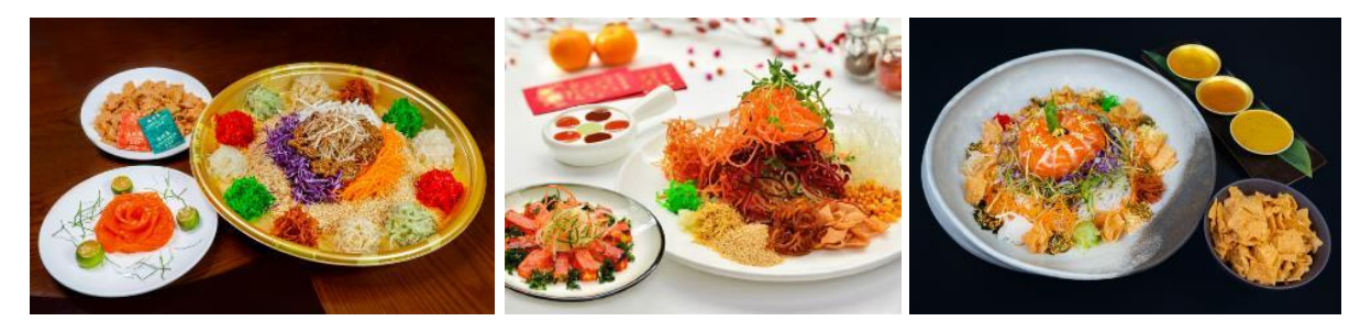
Take your pick from a diverse array of auspicious yu shengs from (left-right): BLOSSOM, Punjab Grill and Sen of Japan

Visitors will also rejoice in an abundance of reunion feasts and CNY treats across selected F&B outlets. From 2 to 28 February, toss to good health and prosperity at contemporary Chinese restaurant BLOSSOM over its prosperity salmon yu sheng featuring a medley of handcrafted delights and succulent smoked salmon (S$58++, serves six to eight pax), or try Sen of Japan 's rendition featuring glorious salmon sashimi, chopped vegetables, and a trio of sauces including golden miso, zesty ginger honey vinegar, and tangy plum sauce (S$38++ for two or S$78++ for four to six pax).