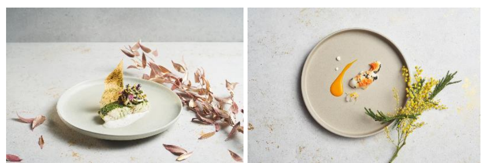
CÉ LA VI rolls out celebratory set menu for an unforgettable dinner reunion this Spring (From L-R): steamed Kühlbarra seabass; prosperity koi dessert

Adventurous gourmands can opt for Punjab Grill 's inventive chaat yu sheng (S$58++) inspired by the all-time favourite Indian savoury snack, available from 11 to 17 February. Chaat crisps such as namkeen para, garlic sev, spinach sev are combined with a date tamarind chutney and hint of plum sauce to give the salad an oriental twist.