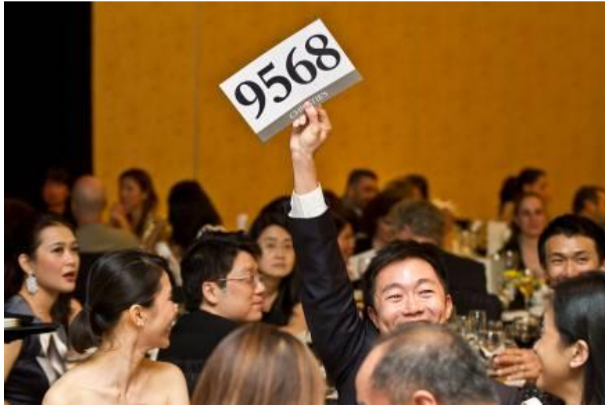
Guests bidding for artworks by 20 Singaporean artists, raising over S$306,800 for both artists and Art Outreach Singapore