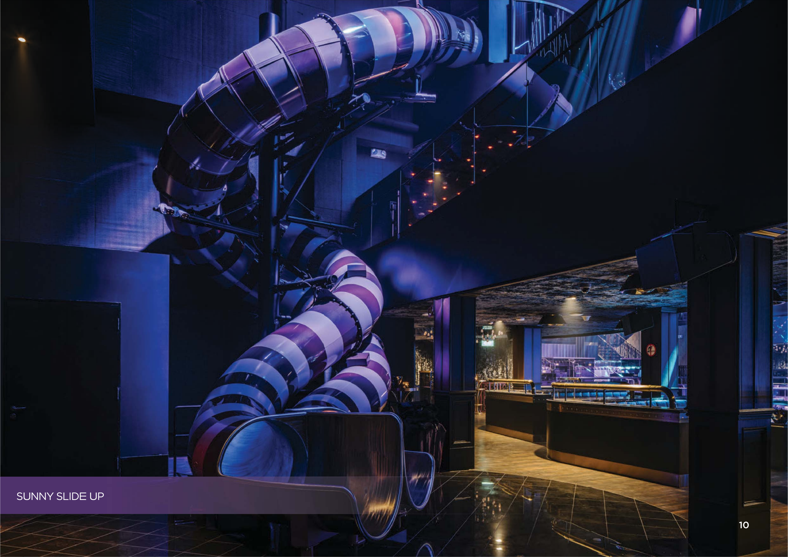
SUNNY SLIDE UP