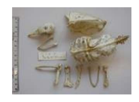
Pigeon skeleton UK