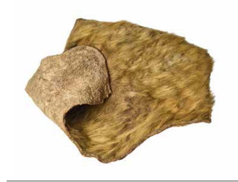
Skin of a giant ground sloth Chile Pleistocene Period, 13,000 years old