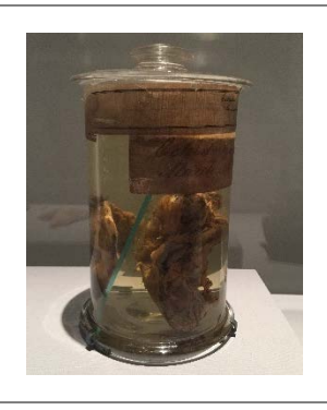
Owen's echidna dissection Australia