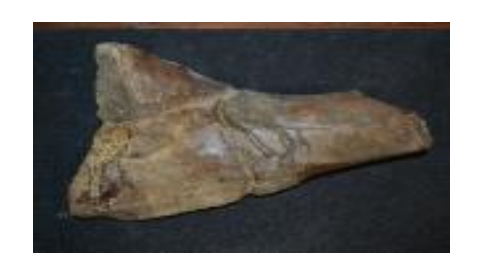
Iguanodon lower leg bone UK Cretaceous Period, 130 million years old