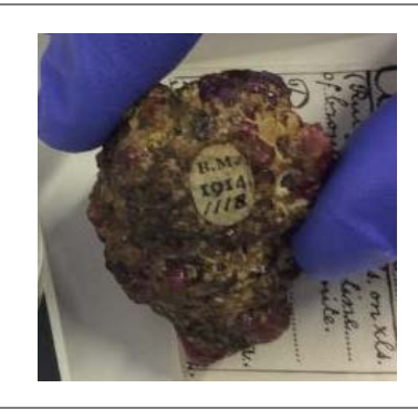
Painite rediscovered Myanmar