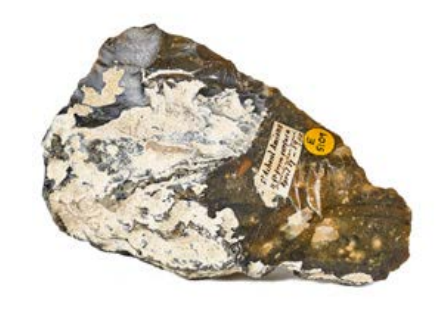
Hand axe France Around 400,000 years old