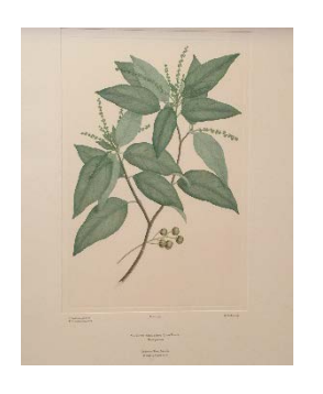
Colour print of the kamala plant, 1984