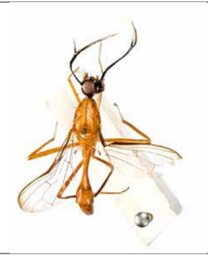
Flies with antlers Papua New Guinea