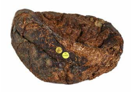
Giant ground sloth dung Chile Pleistocene Period, 13,000 years old

Giant ground sloth bone Chile Pleistocene Period, 13,000 years old