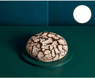
Chestnut Sourdough $10

A whimsical chocolate sponge carriage crafted with layers of salted caramel, yuzu and orange mousse, hazelnut dacquoise, crispy chocolate rice and feuilletine.