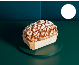
Champagne Brioche $18

A true festive delight to welcome the season, made with delicious dark rum.