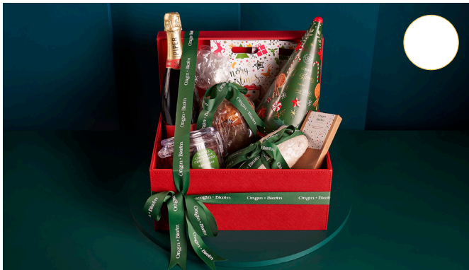
The Sparkling Soirée Hamper $198

Get into the holiday mood with sweet treats and champagne to celebrate, featuring a bottle of Duval-Leroy Brut Réserve (375ml), a chocolate bar, stollen and gingerbread men (2pcs). Ideal for intimate gatherings or season's gifting.