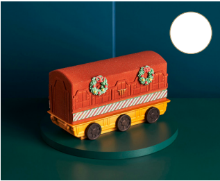
Polar Express $108

A beautifully crafted chocolate train carrying wrapped chocolate truffles. Pair it with our Polar Express for a complete festive train set to bring home the spirit of the holidays.