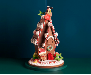
Santa in the Chimney $118

A Christmas classic. Rum-infused chocolate roulade wrapped around chocolate buttercream and ganache, adorned with hazelnut pralines.