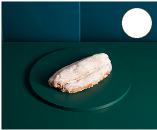
Black Forest Stollen $28

Delectable sourdough brioche made with raisins and honey, best shared cosying up with loved ones over the holidays.