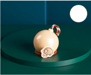
La Close Noel $12

Sweet holiday dreams are made of chocolate teddy bears filled with banana compote and Fleur de Sel salted caramel.