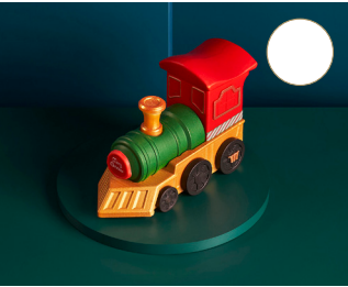
Nutcracker Station Train Piñata $118

A Christmas ornament crafted for the dessert platter instead. Decadent eggnog mousse and pear compote in an almond sponge atop crisp layers of feuilletine.