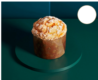
Chestnut & Amarena Cherry Panettone $24

It's the season for chocolate, after all. Savour the crunch of cocoa nibs and Piedmont hazelnuts before luscious Gianduja chocolate and praline paste on the inside.