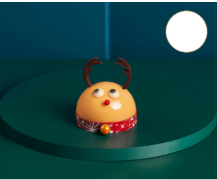
Nordic Reindeer $12

A hearty loaf filled with festive cheer, baked with roasted chestnuts for a sumptuous fragrance.