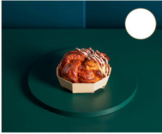
Spiced Pear & Almond Babka $8

A fondant Nutcracker plays on his handcrafted chocolate harlequin drum to reveal a surprise of chocolate-coated orange peels on the inside.