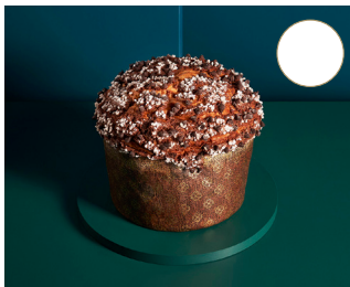
Gianduja & Hazelnut Praline Panettone $24

Perfect for an island-city Christmas. Dried pineapple and mango with tart passionfruit paste in every bite, fragrant coconut shaving on top.