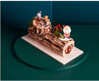
Chocolate Log Cake $108

An adorable, brandy-infused nutcracker filled with vanilla mousse, cranberry compote and Calvados apple chutney.