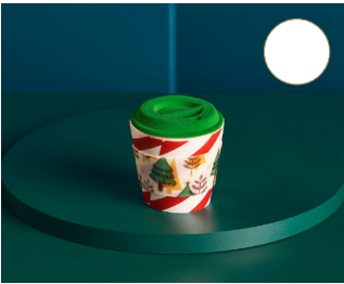
Caffe di Natale $12

A playful season's greeting gift. Spiced-honey & almond cake filled with raspberry compote and Acacia honey mousse.