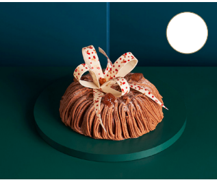
Christmas Wreath $58

Our Christmas morning coffee. Flourless chocolate sponge with a creamy Panama Geisha coffee and Piedmont hazelnut filling.