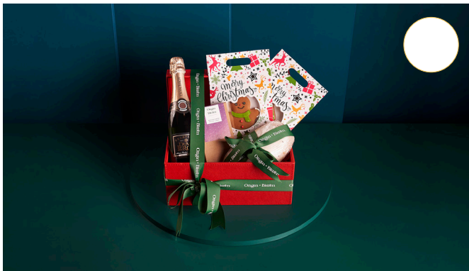
The Holiday Treat Hamper $108

Please fill in order quantity in the white circles.