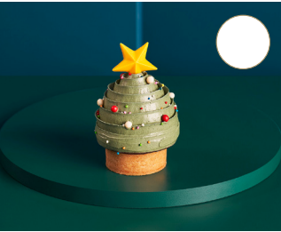
Le Sapin $12

A cherry brandy infused twist on the German festive classic. Kneaded with dried cherries, raisins, roasted hazelnuts, almond marzipan and lemon zest.