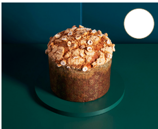
Tropical Panettone $24

A festive favourite filled with plump raisins and candied citron and orange peel. Made to share over holiday gatherings or as a snack to savour a taste of Christmas.