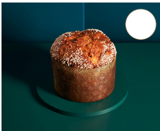
Classic Milanese Panettone $24

Please fill in order quantity in the white circles.