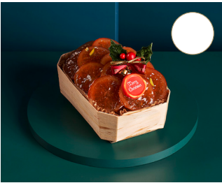
Dark Rum Fruit Cake $48

A party-sized mont blanc makes for the perfect Christmas centerpiece. Classic rum & chestnut cream beautifully piped onto a chestnut cake.