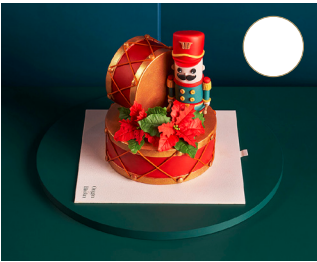
Drummer Boy Piñata $118

A playful yet classic Christmas scene featuring Santa climbing down the chimney. Meticulously crafted with cheeky whimsy, filled with crunchy rocher chocolates.