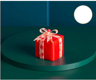
Christmas Gift Box $12

Please fill in order quantity in the white circles.