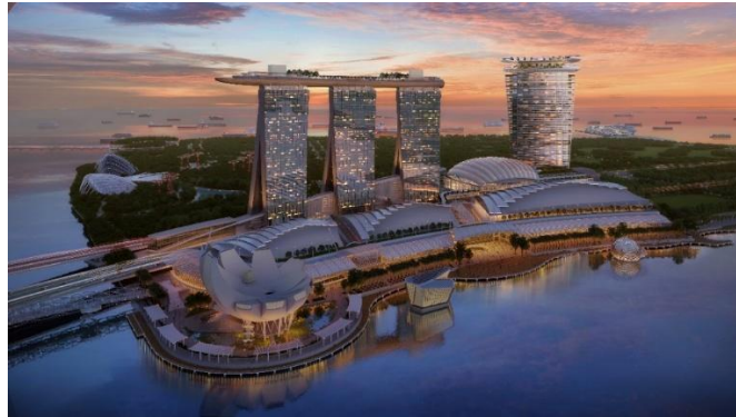
The envisioned waterfront with Las Vegas Sands' new ultra-luxury development featuring a 55-storey hotel tower and podium with 15,000-seat arena situated adjacent to the existing Marina Bay Sands.