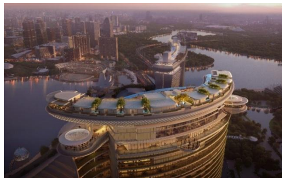
The revolutionary Skyloop from an aerial perspective that highlights the distinct design of its twin wings.