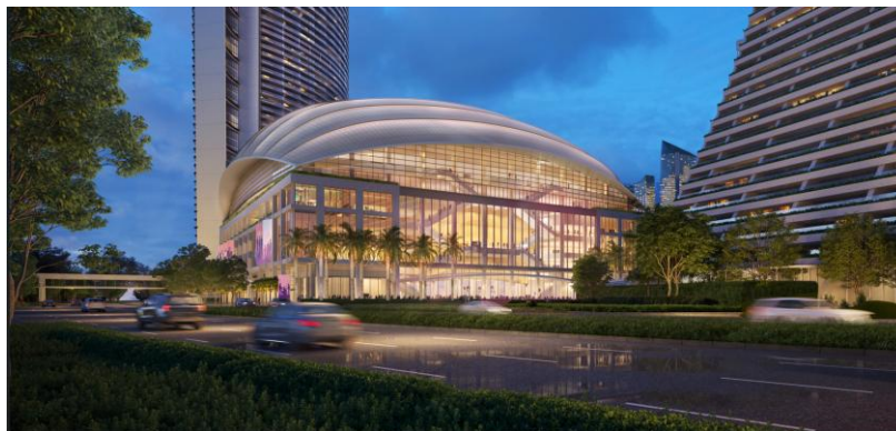
The podium will house three levels of premium MICE space and an arena designed to host the highest calibre live entertainment events.

As a counterpart to the iconic Sands SkyPark at Marina Bay Sands, the Skyloop's form is defined by overlapping elliptical volumes that spiral in opposing directions, giving the tower an overall dynamic quality, and affording 360-degree views. The lower Skyloop interweaves several points of public access, including an observatory, destination restaurants and lush rooftop gardens. Above, hotel guests can enjoy secluded experiences: private cabanas, infinity-edge pools and shading palms. There will also be a cantilevered wellness terrace that is designed for yoga, arts and specialty events.