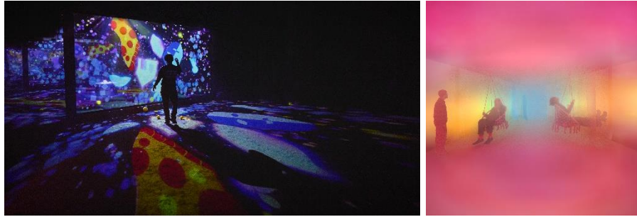
L to R: Get hands-on at Brainstorm by throwing balls at an interactive screen; Swings chairs are available at Moodscape for visitors to relax and immerse in the space

mirror how the human brain processes and organises information, with memories acting as interconnecting threads.