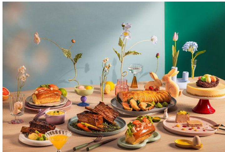
Hop into an Easter feast at RISE

traditional Thai sweets such as Kanom Krok Bai Toey , delicate pandan and purple sweet potato pancakes, or popular classics such as Red Ruby with crunchy water chestnuts and sweet coconut milk and Luk Chup , an intricate Thai confection made from mung bean paste, skillfully shaped into miniature fruits.