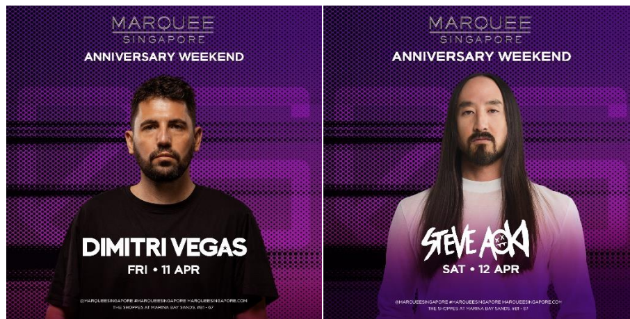
MARQUEE Singapore celebrates its anniversary in April with DJs Dimitri Vegas and Steve Aoki headlining on 11 and 12 April

MARQUEE Singapore will usher in its spectacular anniversary with an extraordinary line-up of world-renowned DJs and high-energy performances throughout the month of April. This year's milestone event will see none other than Belgian-Greek DJ Dimitri Vegas and Grammy-nominated artist Steve Aoki ignite the dancefloor with their high-energy sets filled with sonic anthems and euphoric remixes over the nightclub's anniversary weekend on 11 and 12 April.