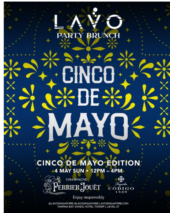
LAVO Party Brunch Cinco de Mayo edition rings in the Mexican festival with a lavish party

Cinco de Mayo takes over LAVO Singapore on 4 May, as LAVO Party Brunch (LPB) returns with its third rendition this year to celebrate the Mexican festivity in style and glamour. The party will showcase a vibrant menu that blends Italian flair with festive Mexican flavour, promising an unforgettable feast.