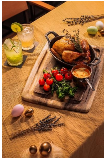
Elevate Easter gatherings with Yardbird's Seafood-Stuffed Whole Chicken Roulade

Guests can soak in the scenic views of the promenade while celebrating Easter Sunday at Yardbird Southern Table & Bar on 20 April, featuring a Seafood-Stuffed Whole Chicken designed to serve three to four guests. This indulgent dish, priced at S$98++, is generously filled with a perfect amalgamation of choice seafood ingredients, including clams, baby octopus, and crab, making it the perfect centre piece for a festive Easter gathering.