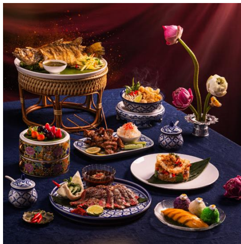
Dive into the vibrant flavours of Thailand this Songkran at RISE

RISE presents a trio of festive dining experiences this April, celebrating Songkran, Easter, and the Netherlands King's Day with authentic flavours and premium ingredients, thoughtfully curated for an unforgettable culinary journey.