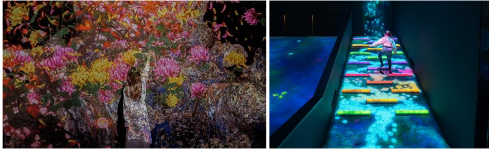
L to R: New installations include Continuous Life and Death and Waterfall Droplets, Flowing Down a Slope

After an extensive revamp, ArtScience Museum's beloved permanent exhibition Future World: Where Art Meets Science is reopening from 31 May with new and upgraded artworks by international art collective teamLab.