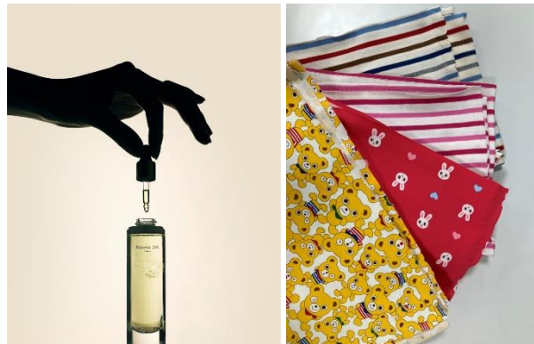
L to R: Maison 21G and MIKI HOUSE have curated in-shop programmes for Go Green SG

For more information on Drawn to the Wild , please visit https://www.marinabaysands.com/attractions/digital-light-canvas.html .