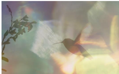
A still from Every Little Thing (2024) directed by Sally Atkin

From 29 June to 30 July, visitors can catch award-winning cinematic stories about the deep yet fragile connection between nature and humanity at ArtScience Cinema on Level 4 of the Museum. From tender portraits of wildlife rehabilitation to sojourns into sublime landscapes slowly eroded by climate change, Sustainable Futures Film Festival features a line-up of breathtaking films that are both an ode and plea to protect our planet.