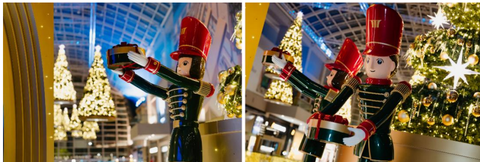
Nutcracker butlers at the Midnight Toy Factory captured preparing gifts, as part of the display at The Shoppes' The Grand Colonnade.

Beginning from the Porte Cochere, 2.1-metre-tall nutcracker butlers flank the striking entrance now transformed into The Nutcracker Station, hinting at the charming narrative that awaits visitors. At the Hotel Lobby, the majestic, multi-tiered Great Glistening Tree sits atop a gilded carousel-inspired dome embellished with shimmering ornaments. On its crown, a nutcracker butler is captured in a whimsical moment, placing the brightest star to complete the resplendent display. Meanwhile, nutcracker butlers with gifts in hand proudly stand around its base, evoking an ambience of festive grandeur.