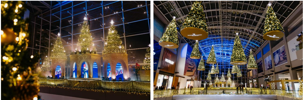
Holiday magic fills the air as The Midnight Toy Factory and The Levitating Fir Forest are amongst the Christmas decorations at the integrated resort.

The integrated resort unveils refined holiday elegance with magnificent decorations and immersive experiences.