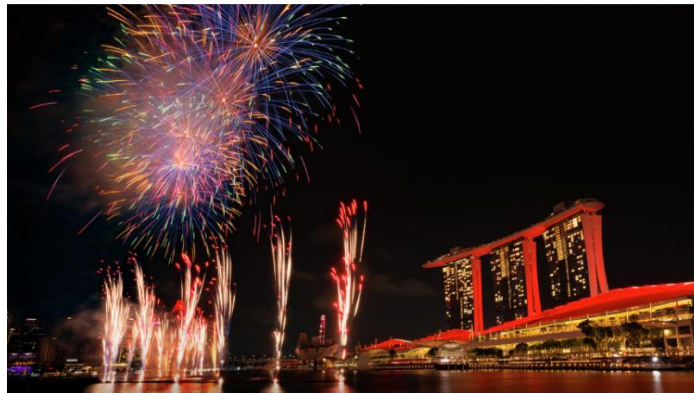
Celebrate the arrival of 2026 at Marina Bay Sands' Countdown in the Sky experience.

Ring in the new year from Singapore's most iconic vantage point as Countdown in the Sky returns to SkyPark Observation Deck on 31 December, Wednesday, from 10.30pm to 2.00am. Perched high above the glittering cityscape, visitors will be treated to a breathtaking spectacle of fireworks alongside live music that will set the tone for the night. A specially curated complimentary drink and mixed-flavour popcorn will add a festive touch to this celebration. This promises to be an extraordinary evening to welcome 2026 in style, leaving loved ones with joyous memories to carry into the new year. General admission tickets are available at S$188, with Sands Lifestyle members enjoying a special rate.