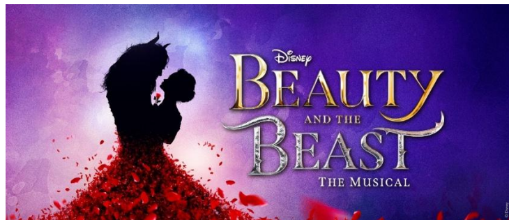
Disney's Beauty and the Beast will make its only stop in Asia at Sands Theatre, Marina Bay Sands. Credit to Base Entertainment Asia.