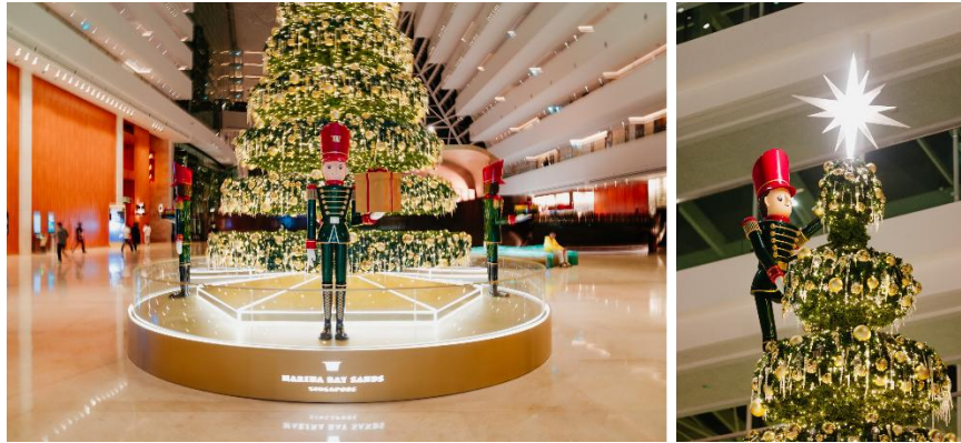
Nutcracker butlers surrounding the Great Glistening Tree at the Hotel Lobby enliven the vibrant festive spirit.

Beginning from the Porte Cochere, 2.1-metre-tall nutcracker butlers flank the striking entrance now transformed into The Nutcracker Station, hinting at the charming narrative that awaits visitors. At the Hotel Lobby, the majestic, multi-tiered Great Glistening Tree sits atop a gilded carousel-inspired dome embellished with shimmering ornaments. On its crown, a nutcracker butler is captured in a whimsical moment, placing the brightest star to complete the resplendent display. Meanwhile, nutcracker butlers with gifts in hand proudly stand around its base, evoking an ambience of festive grandeur.