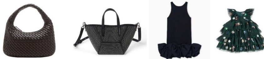
Fashion highlights in the gift guide feature brands such as Bottega Veneta, Brunello Cucinelli, Emporio Armani and Kids21.

For more details on the integrated resort's activations, visit www.marinabaysands.com/christmas .