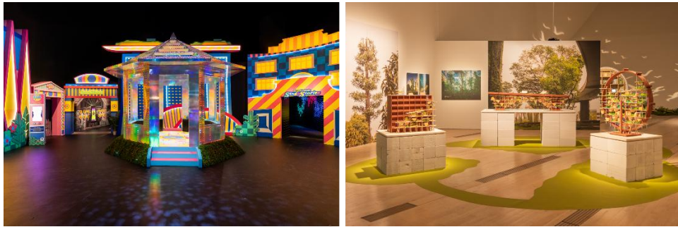
Singapop! 60 Years of Singapore Pop Culture and Another World Is Possible are among exhibitions at ArtScience Museum that are perfect to visit during the holidays.

Beyond the festive flavours and shimmering décor, the celebrations extend to Marina Bay Sands' iconic attractions. From awe-inspiring exhibitions at ArtScience Museum to the luminous wonder of the Digital Light Canvas by teamLab and the timeless charm of Sampan Rides, families are invited to journey through stories told through art, technology, and tradition. From now till 30 November, every adult ticket purchased to Singapop! 60 Years of Singapore Pop Culture , Another World Is Possible , Sampan Rides and Digital Light Canvas by teamLab includes two complimentary tickets for young explorers aged 2 to 12.