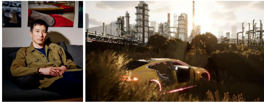
L to R: Portrait of Lawrence Lek by Nishant Shukla; NOX, 2023. © Lawrence Lek. Courtesy the Artist and Sadie Coles HQ, London. Commissioned by LAS Art Foundation, Berlin.

ArtScience Museum will also offer a chance for visitors to peek into the future with NOX: Confessions of a Machine .