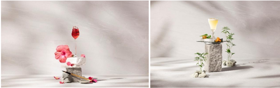
L to R: Wakuda offers Noren, a gin-based cocktail layered with delicate floral notes, while The Anna Wong at Mott 32 presents a citrus-forward, creamy blend

Marina Bay Sands elevates the art of dining with a curated collection of limited-time creations that celebrate heritage, craftsmanship, and cultural storytelling. From 22 January, guests are invited to savour experiences that transcend taste, bringing art and gastronomy together in thoughtful and expressive ways.