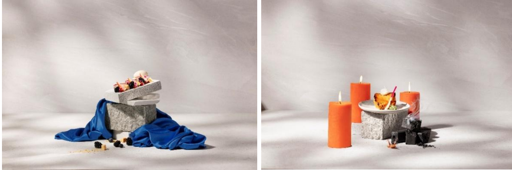
L to R: Blush Berry Silhouette at Maison Boulud, a vibrant berry and crème dessert, and Torii Flame Cod at KOMA, lacquered black cod

At Maison Boulud , the Blush Berry Silhouette (S$16++) captures the sun-kissed allure of the French Riviera. Layers of vibrant berries, silky crème, buttery shortbread crumble, and a light meringue swirl come together in a composition that celebrates femininity, refinement, and poetic simplicity through a modern French lens.