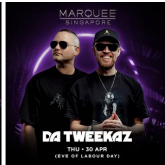
From L to R: Dabin, Vengaboys, Will Sparks, DA TWEAKAZ

MARQUEE amps up April with a powerhouse lineup as Dabin fires up the dancefloor on 5 April, Vengaboys bring their iconic party anthems on 25 April, Will Sparks drops big-room heat also on 25 April, and Da Tweekaz deliver their explosive hardstyle energy on 30 April.