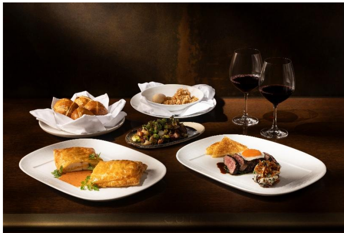
CUT welcomes spring with an Easter feast extravaganza

This Easter Sunday, CUT by Wolfgang Puck invites guests to celebrate the holiday with an indulgent Easter Lunch crafted around premium ingredients, signature techniques and quietly festive touches designed for both adults and families. Available only on 5 April, from 12.00pm to 2.00pm, the experience is offered as a three-course set menu priced at $145++ per person, with limited seatings available.