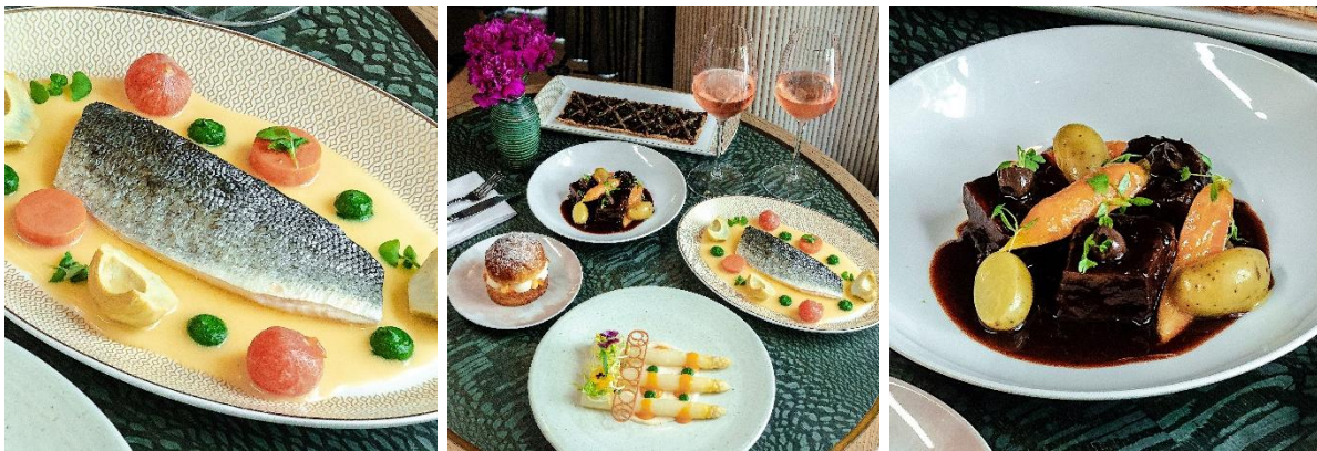
Savour the essence of Provence at Maison Boulud

Maison Boulud invites diners on a culinary journey through the regions of France with Terroirs de France , a series of featured menus celebrating traditional, seasonal specials inspired by the country's diverse regional landscapes and nostalgic hometown dishes. From the sun-washed coastlines of Provence and the forested hills of Burgundy to the many expressions of Bordeaux, the programme captures the essence of France through its regional ingredients and flavours.