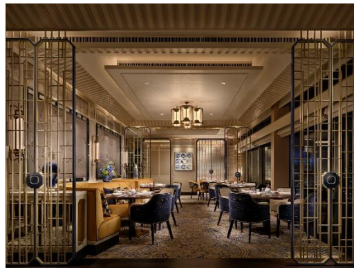
Jin Ting Wan presents a new selection of à la carte specialties

Jin Ting Wan has introduced a series of new dishes that reimagine everyday comfort through refined technique and exceptional sourcing. The new menu items span Teochew classics, Cantonese favourites, delicate dim sum and nourishing soups, united by a respect for tradition and a pursuit of quiet elegance on the plate.