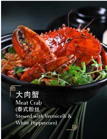
大肉蟹 Meat Crab (泰式粉丝 Stewed with Vermicelli & White Peppercorn)