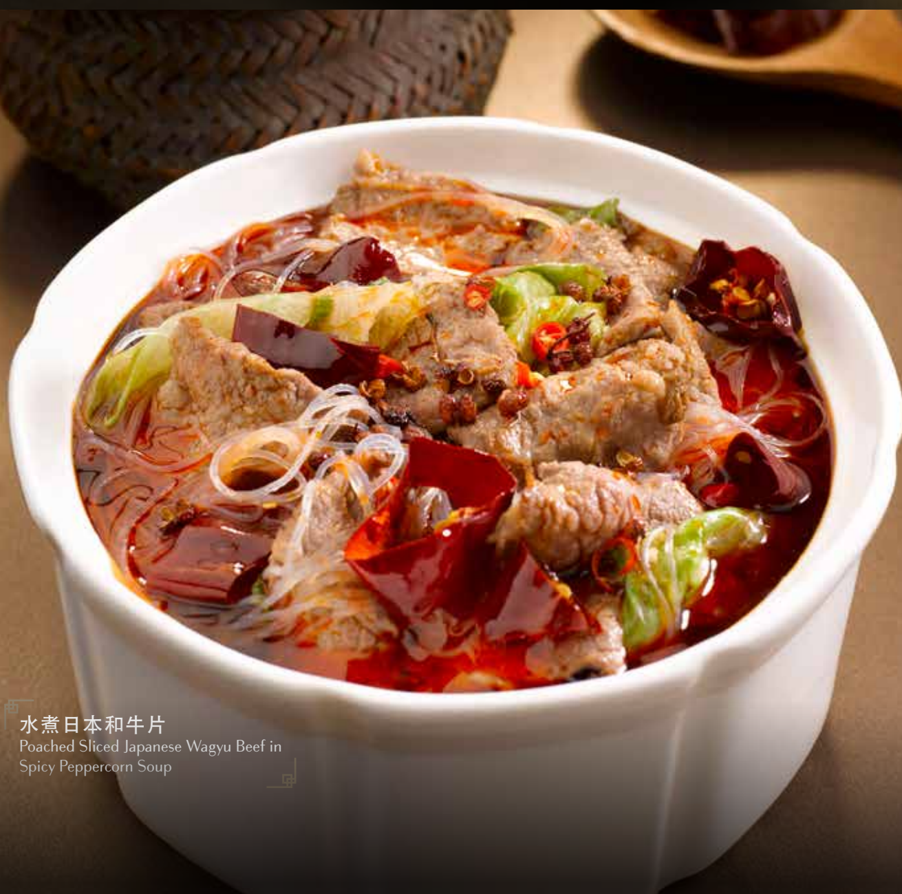
水煮日本和牛片 Poached Sliced Japanese Wagyu Beef in Spicy Peppercorn Soup