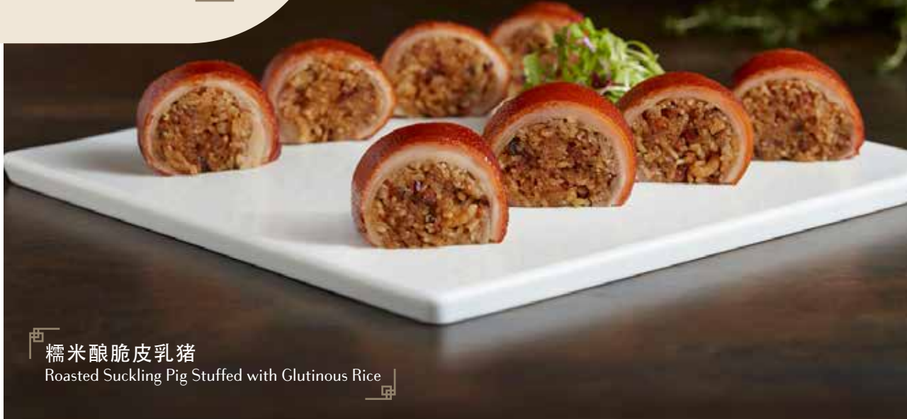
糯米酿脆皮乳猪 Roasted Suckling Pig Stuffed with Glutinous Rice