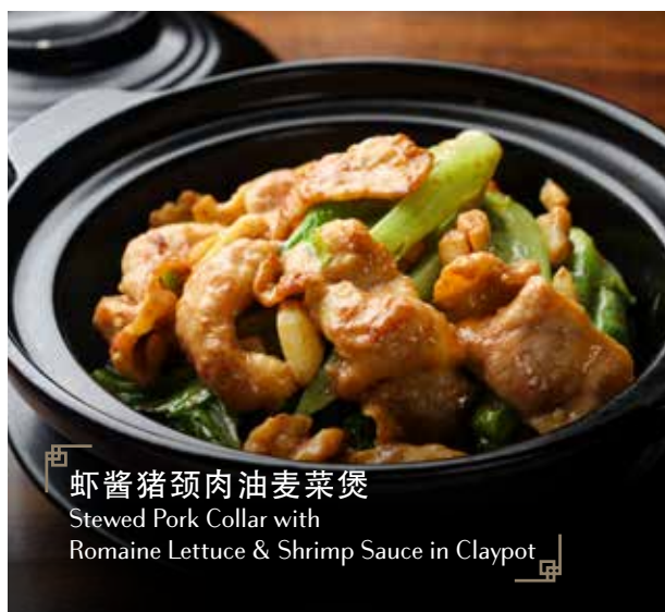
虾酱猪颈肉油麦菜煲 Stewed Pork Collar with Romaine Lettuce & Shrimp Sauce in Claypot