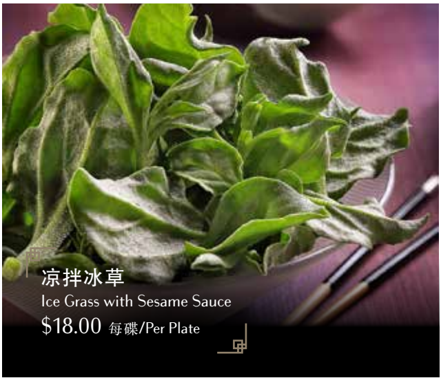
凉拌冰草 Ice Grass with Sesame Sauce $18.00 每碟/Per Plate