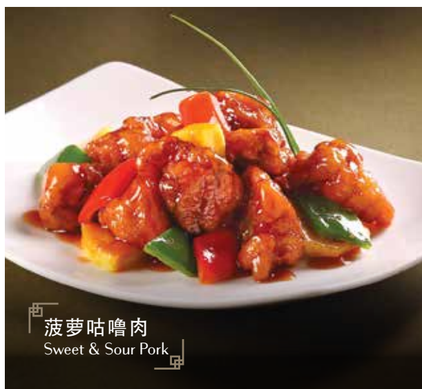
菠萝咕嚕肉 Sweet & Sour Pork