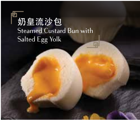
奶皇流沙包 Steamed Custard Bun with Salted Egg Yolk