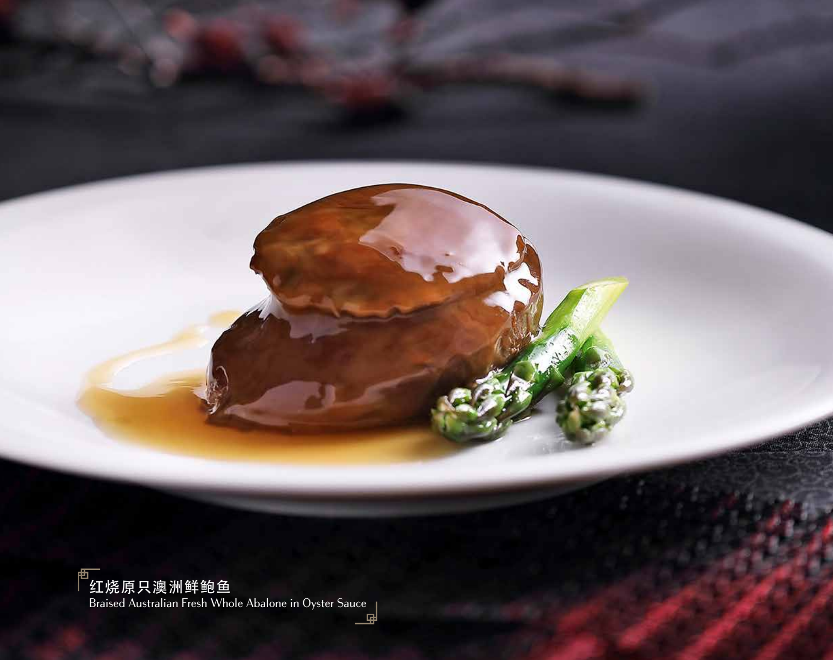
商 红烧原只澳洲鲜鲍鱼 Braised Australian Fresh Whole Abalone in Oyster Sauce