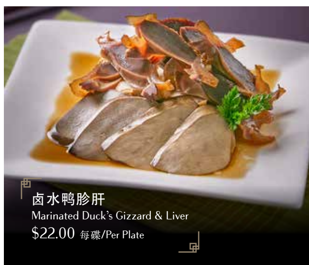
卤水鸭胗肝 Marinated Duck's Gizzard & Liver $22.00 每碟/Per Plate