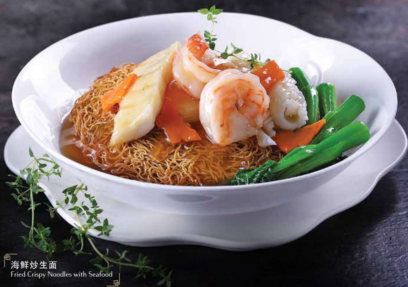
海鲜炒生面 Fried Crispy Noodles with Seafood