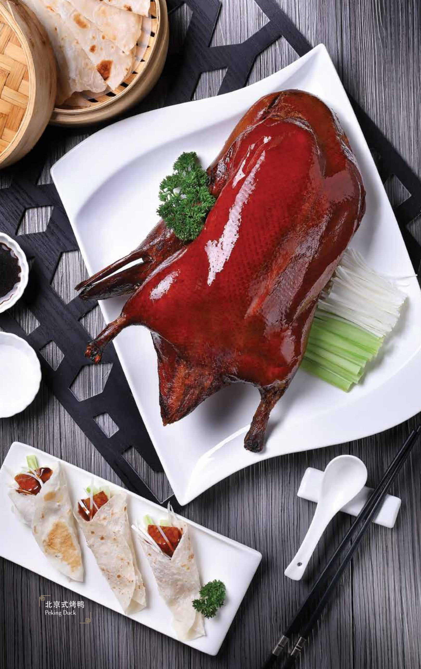
北京式烤鸭 Peking Duck