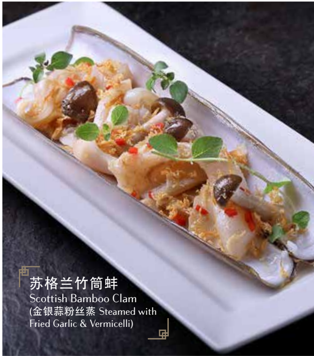
苏格兰竹筒蚌 Scottish Bamboo Clam (金银蒜粉丝蒸 Steamed with Fried Garlic & Vermicelli)