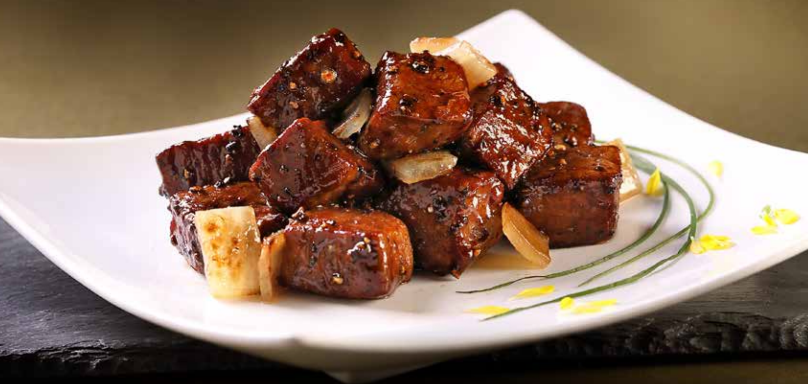
黑椒牛柳粒 Sautéed Diced Beef with Black Pepper