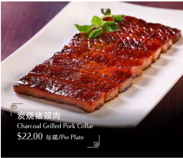
炭烧猪颈肉 Charcoal Grilled Pork Collar $22.00 每碟/Per Plate