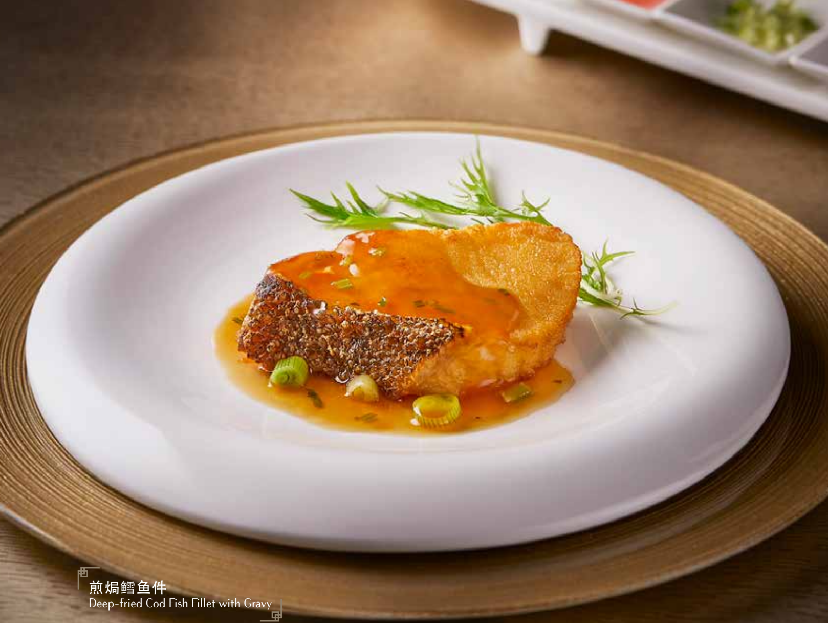
煎焗鳕鱼件 Deep-fried Cod Fish Fillet with Gravy