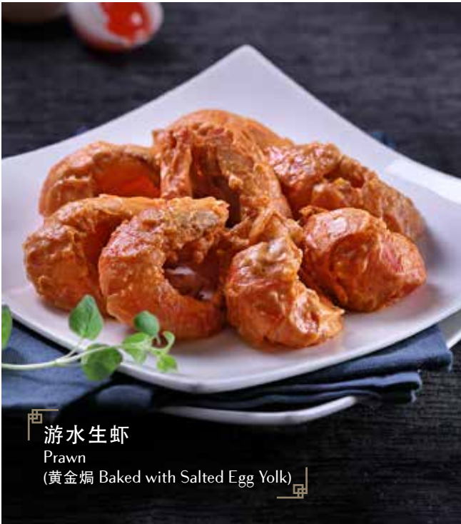
游水生虾 Prawn (黄金焗 Baked with Salted Egg Yolk)