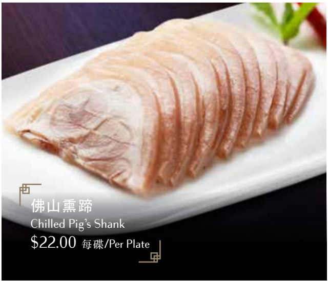
佛山熏蹄 Chilled Pig's Shank $22.00 每碟/Per Plate