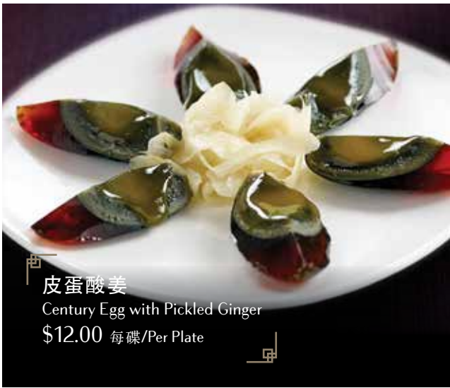
皮蛋酸姜 Century Egg with Pickled Ginger $12.00 每碟/Per Plate