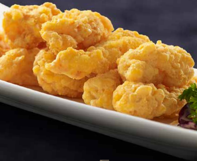
黄金焗鲜鱿 Baked Squid with Salted Egg Yolk