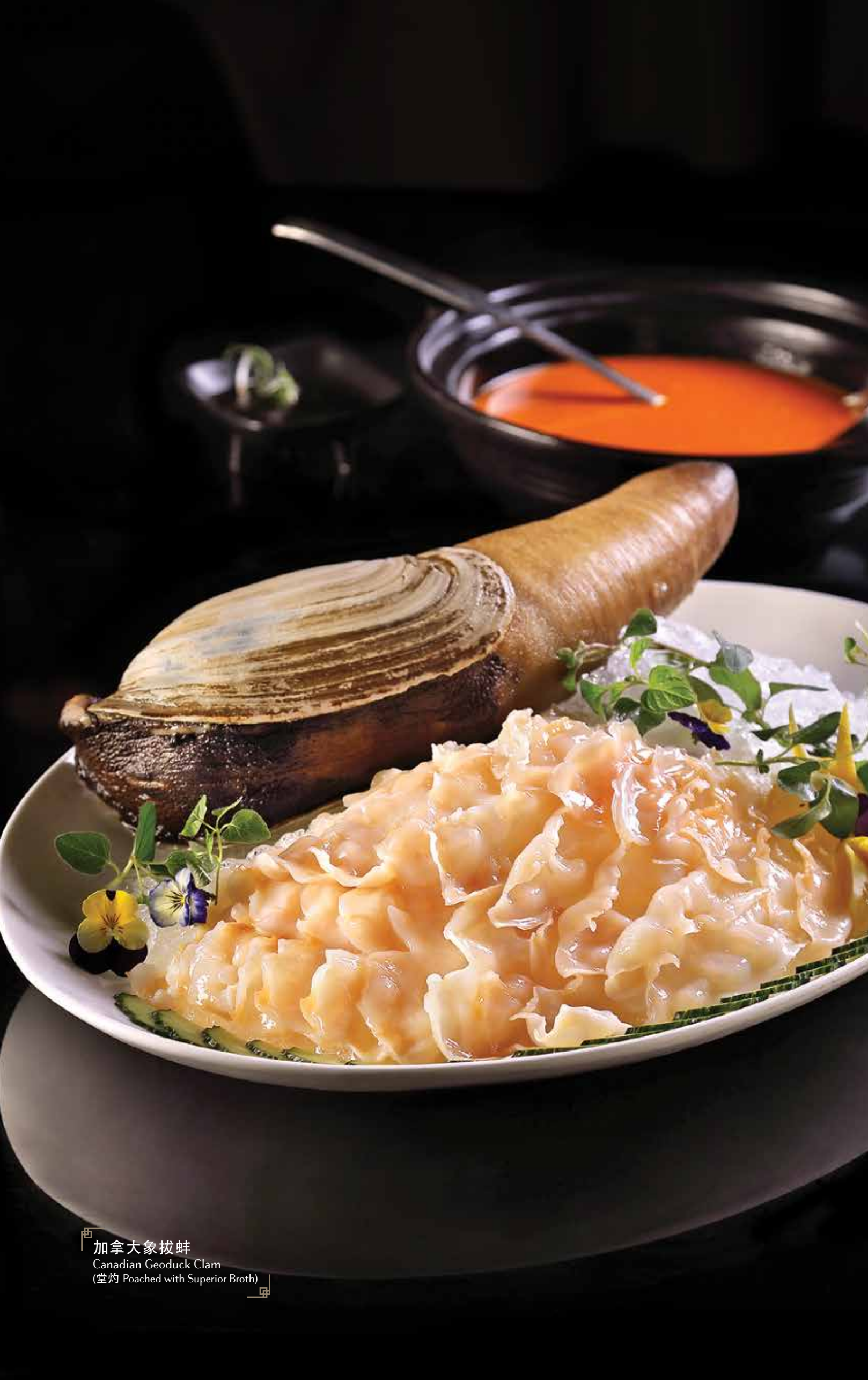
加拿大象拔蚌 Canadian Geoduck Clam (堂灼 Poached with Superior Broth)