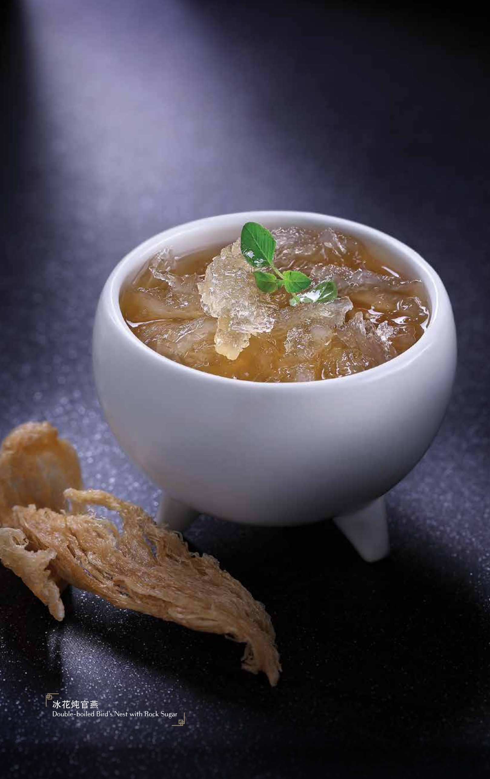
冰花炖官燕 Double-boiled Bird's Nest with Rock Sugar