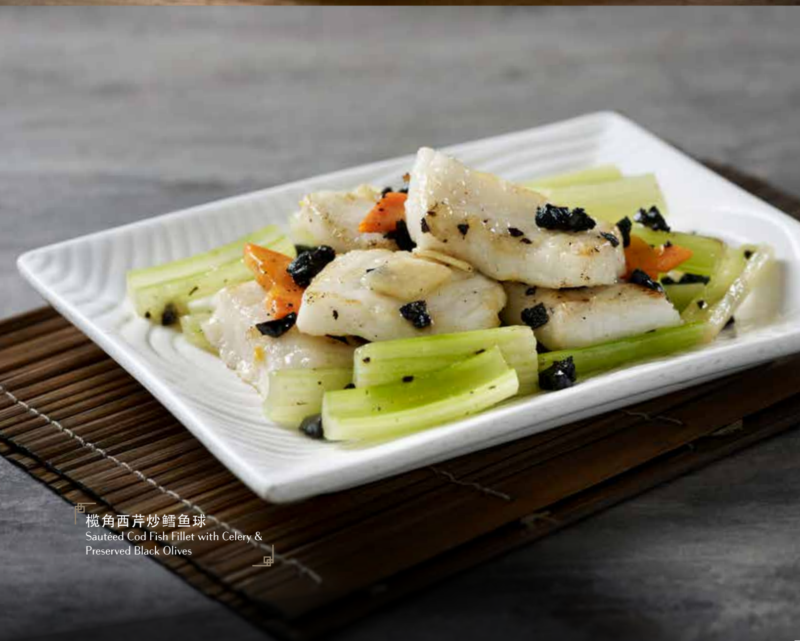
榄角西芹炒鳕鱼球 Sautéed Cod Fish Fillet with Celery & Preserved Black Olives