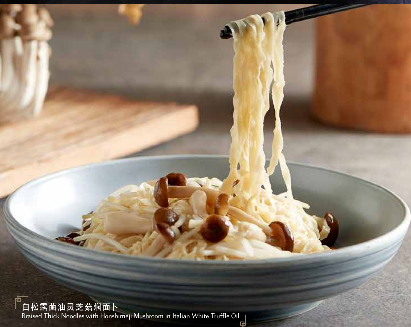
白松露菌油灵芝菇焖面卜 Braised Thick Noodles with Honshimeji Mushroom in Italian White Truffle Oil