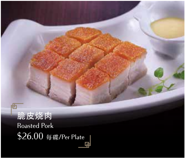
脆皮烧肉 Roasted Pork $26.00 每碟/Per Plate