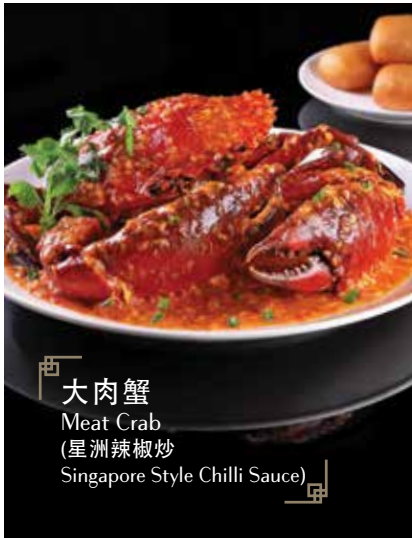
大肉蟹 Meat Crab (星洲辣椒炒 Singapore Style Chilli Sauce)