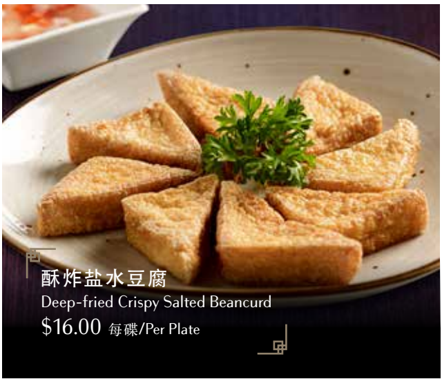
酥炸盐水豆腐 Deep-fried Crispy Salted Beancurd $16.00 每碟/Per Plate