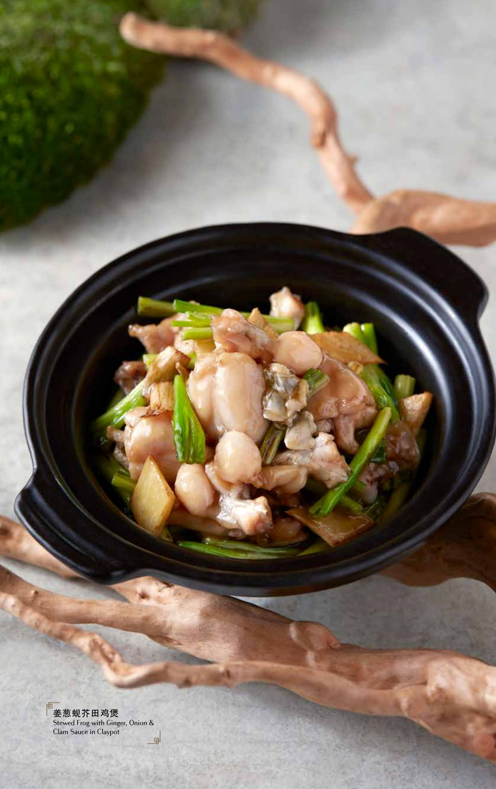
姜葱蚬芥田鸡煲 Stewed Frog with Ginger, Onion & Clam Sauce in Claypot