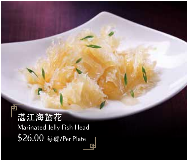
湛江海蜇花 Marinated Jelly Fish Head $26.00 每碟/Per Plate