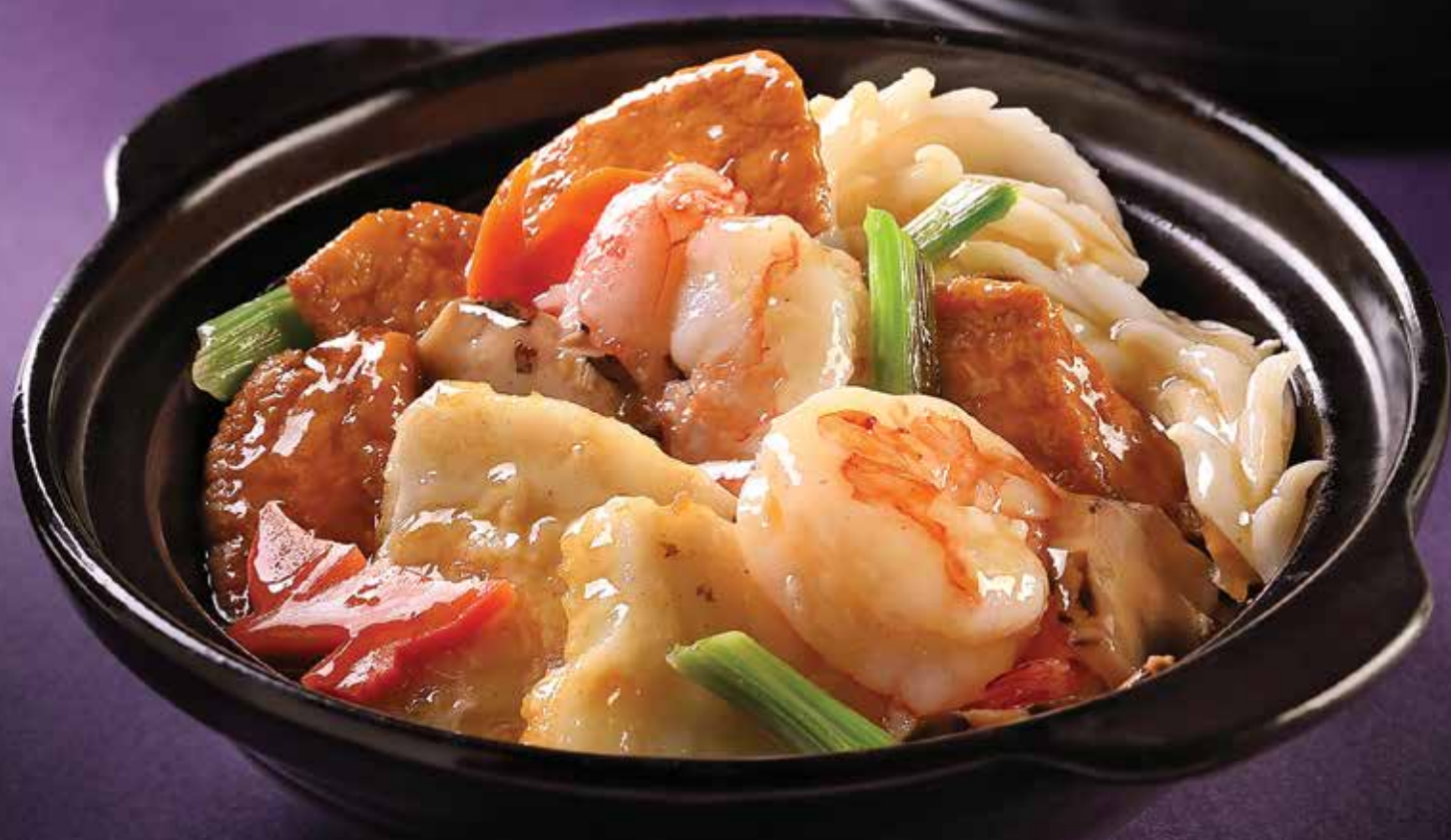
海鲜豆腐煲 Stewed Beancurd with Seafood in Claypot