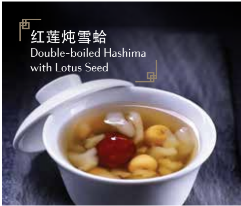
紅蓮炖雪蛤 Double-boiled Hashima with Lotus Seed