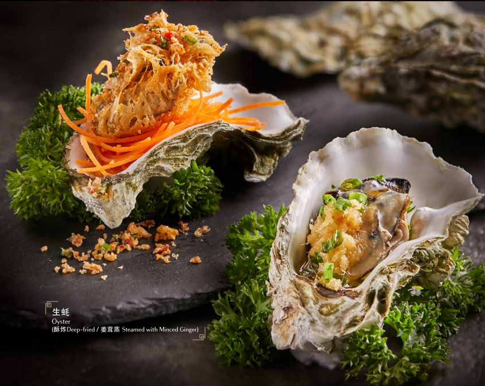
生蚝 Oyster (酥炸Deep-fried / 姜茸蒸 Steamed with Minced Ginger)