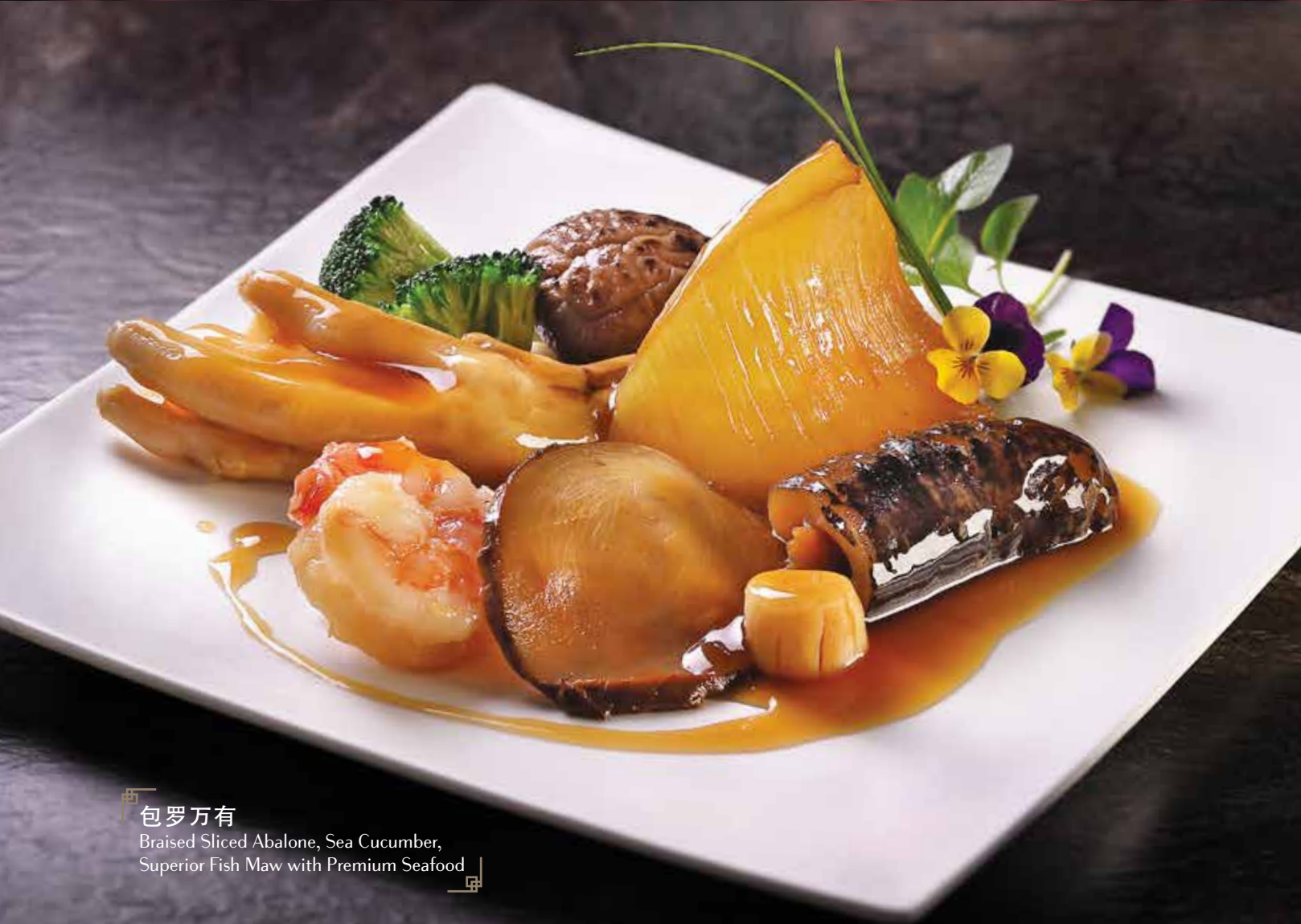
商 包罗万有 Braised Sliced Abalone, Sea Cucumber, Superior Fish Maw with Premium Seafood