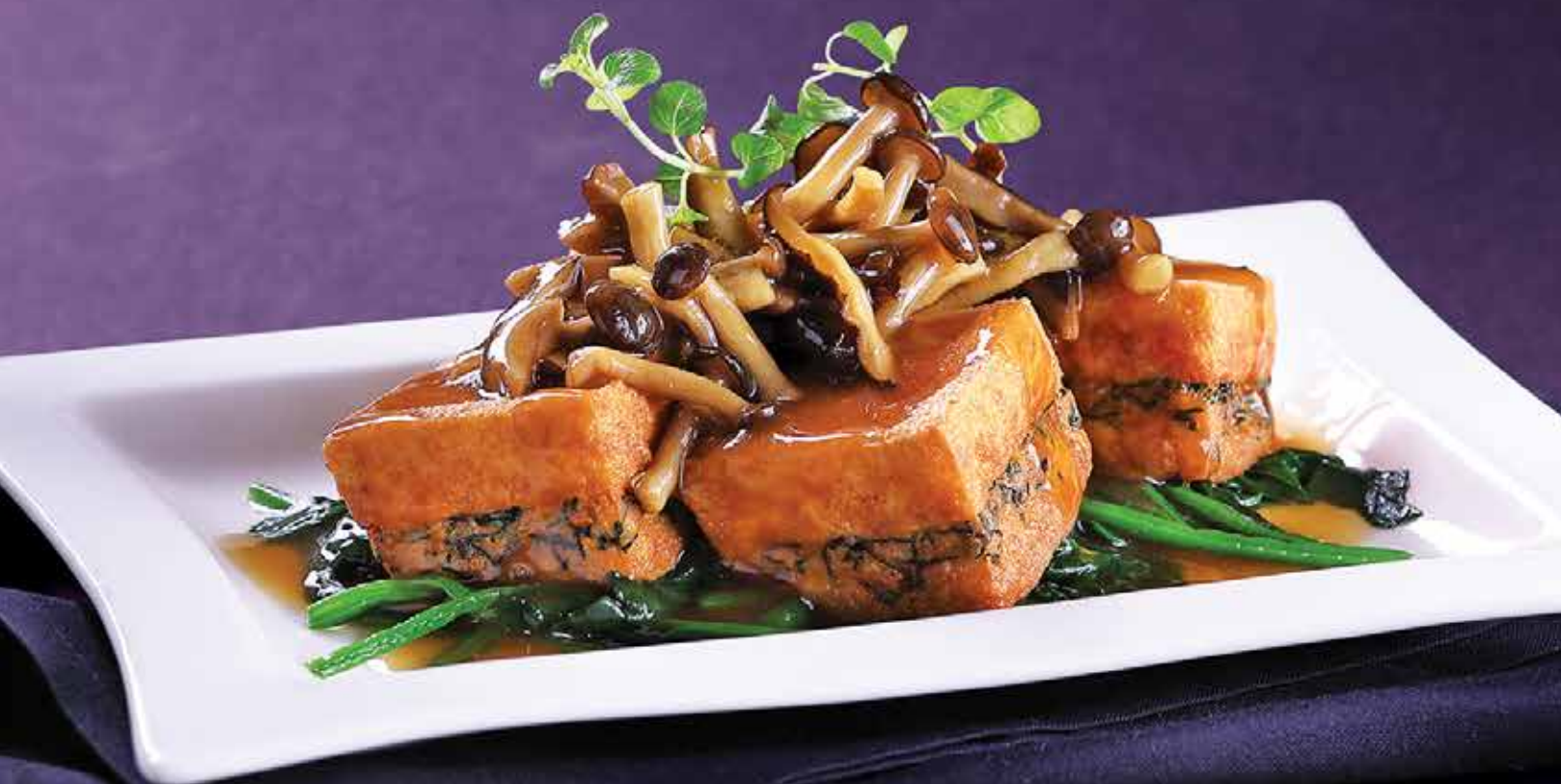
三菇扒菠菜豆腐 Braised Spinach Beancurd with Assorted Mushrooms