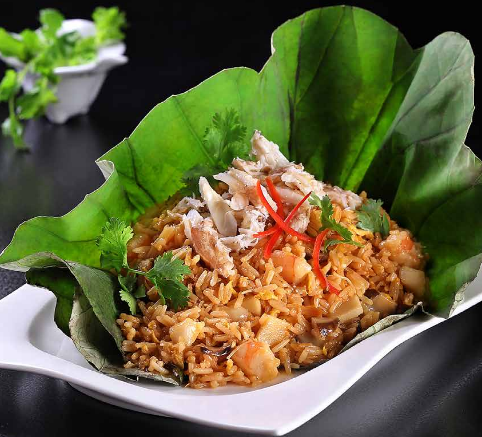
鮑汁海鮮荷葉飯 Steamed Diced Seafood Rice Wrapped in Lotus Leaf