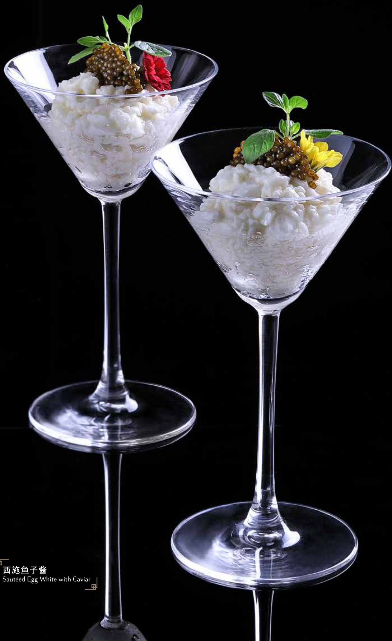
西施鱼子酱 Sautéed Egg White with Caviar