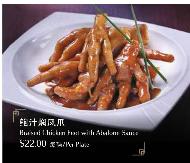
鲍汁焖凤爪 Braised Chicken Feet with Abalone Sauce $22.00 每碟/Per Plate

百花炸皮蛋 Deep-fried Century Egg Stuffed with Shrimp Paste $24.00 每碟/Per Plate