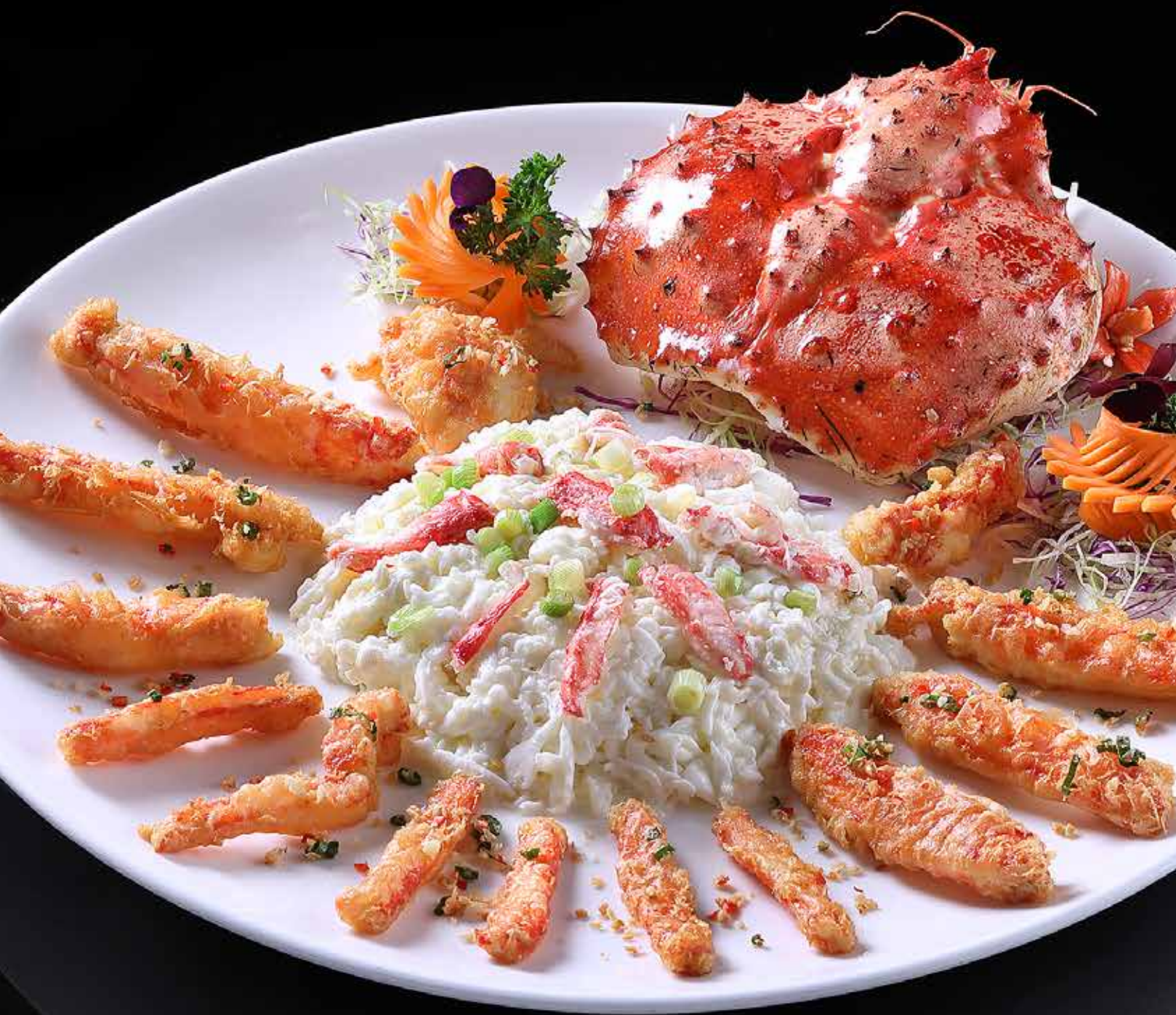
阿拉斯加蟹 Alaskan Crab (两味：西施焗身 / 椒盐 Two Ways: Sautéed with Egg White / Pepper & Salt)