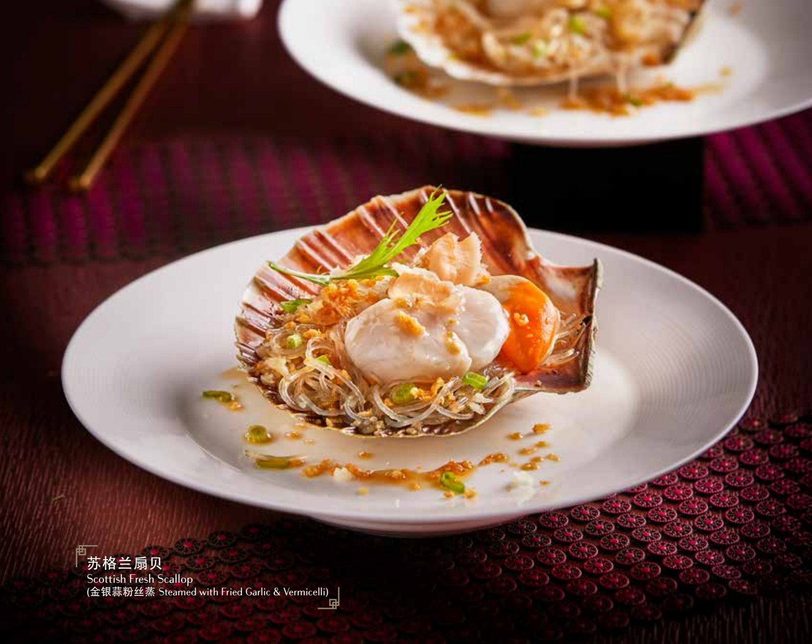
苏格兰扇贝 Scottish Fresh Scallop (金银蒜粉丝蒸 Steamed with Fried Garlic & Vermicelli)