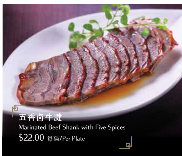
五香卤牛腱 Marinated Beef Shank with Five Spices $22.00 每碟/Per Plate