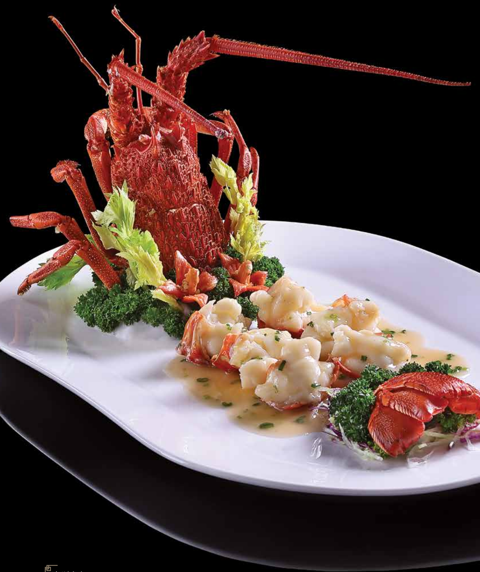
澳洲龙虾 Australian Lobster (上汤焗 Baked with Superior Broth)