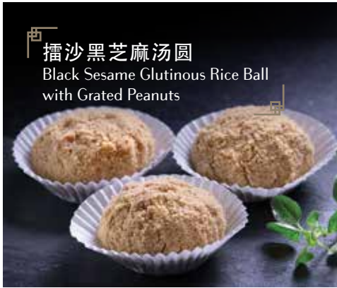
擂沙黑芝麻汤圆 Black Sesame Glutinous Rice Ball with Grated Peanuts