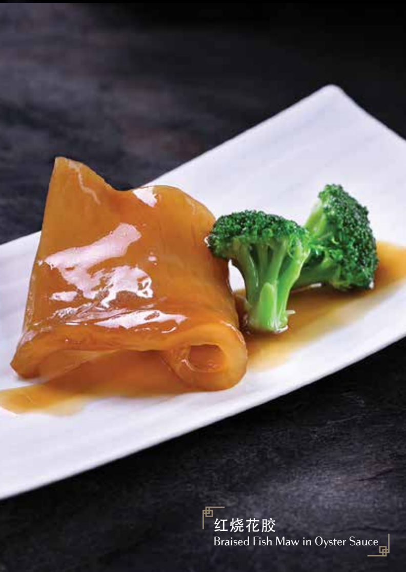
红烧花胶 Braised Fish Maw in Oyster Sauce