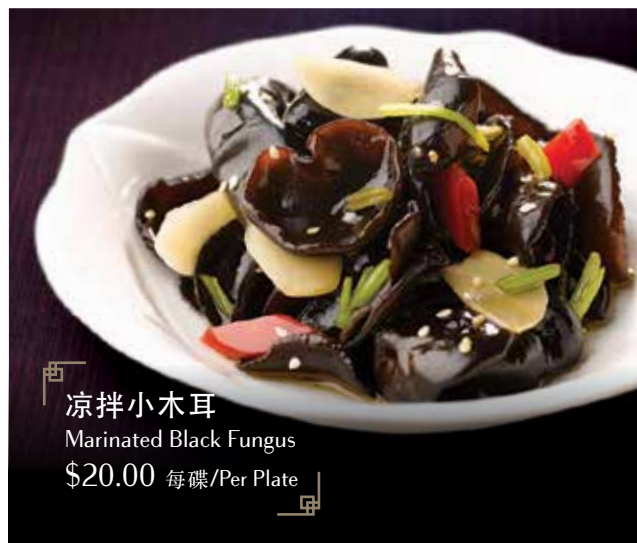
凉拌小木耳 Marinated Black Fungus $20.00 每碟/Per Plate