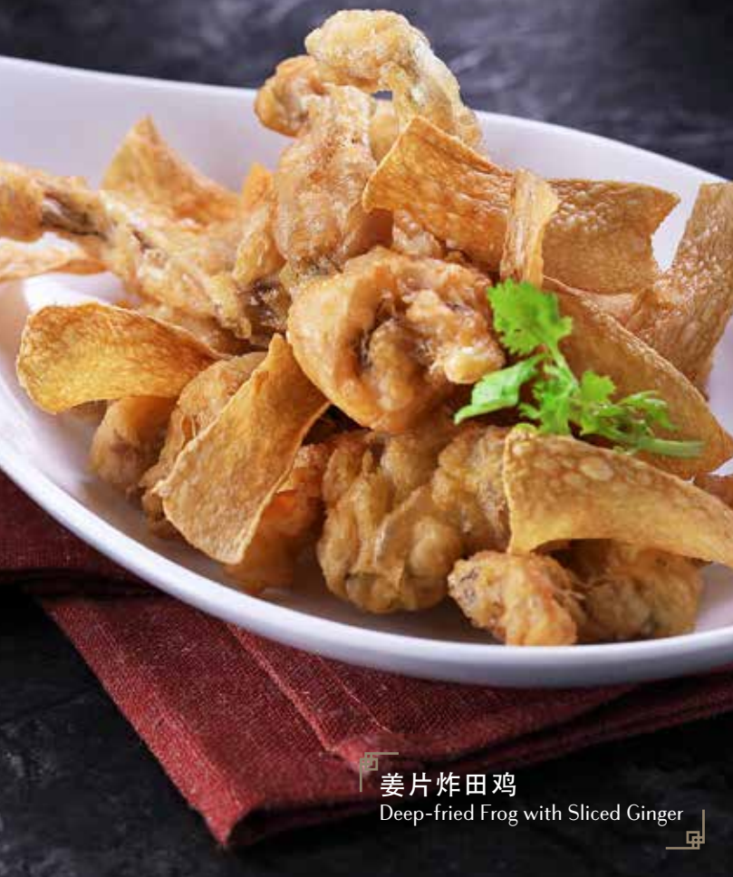
姜片炸田鸡 Deep-fried Frog with Sliced Ginger