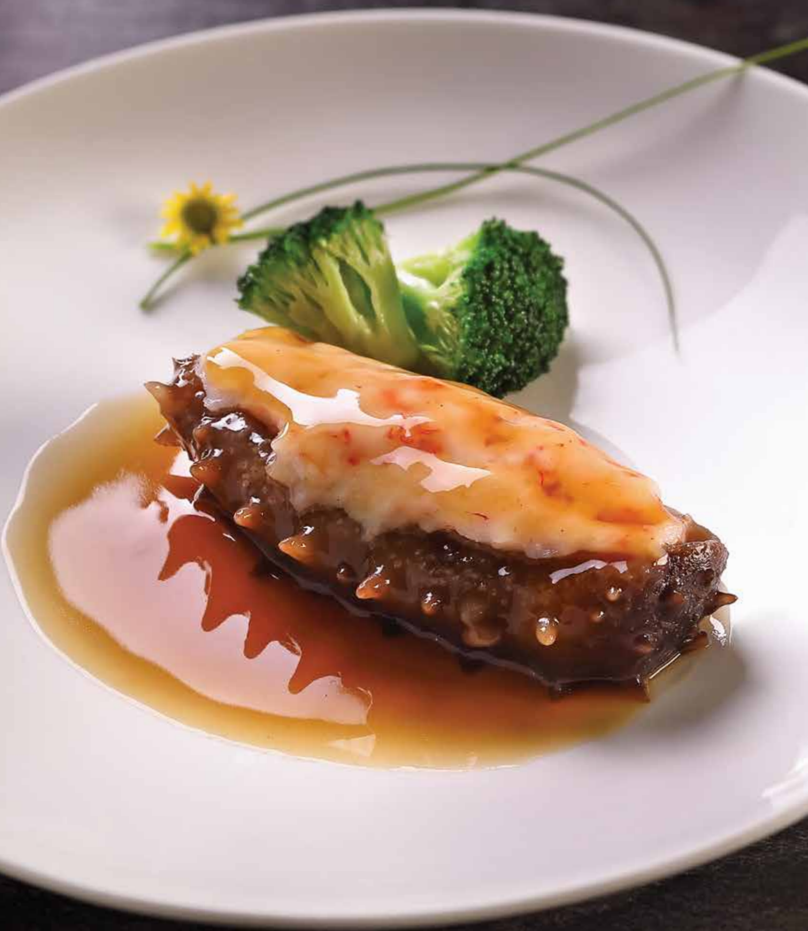
红烧百花酿原条辽参 Braised Whole Hokkaido Sea Cucumber Stuffed with Shrimp Paste