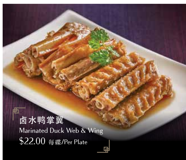
卤水鸭掌翼 Marinated Duck Web & Wing $22.00 每碟/Per Plate