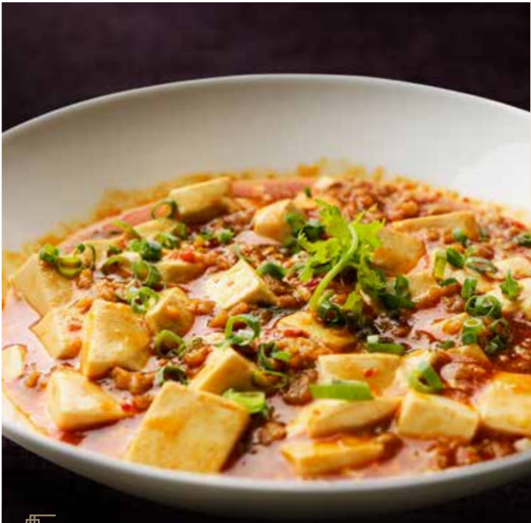
麻婆豆腐 Stewed Beancurd with Minced Pork in Spicy ‘Ma Po’ Sauce