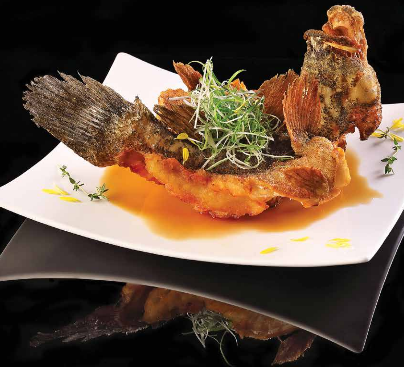
筍壳鱼 Marble Goby 'Soon Hock' Fish (油浸 Deep-fried)