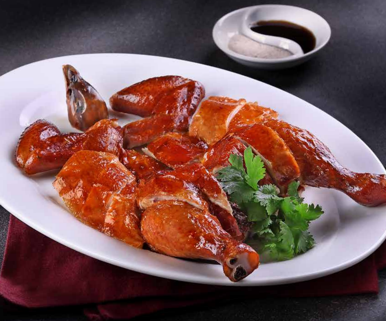
脆皮炸子鸡 Roasted Crispy Chicken