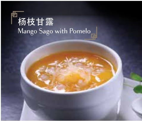
楊枝甘露 Mango Sago with Pomelo