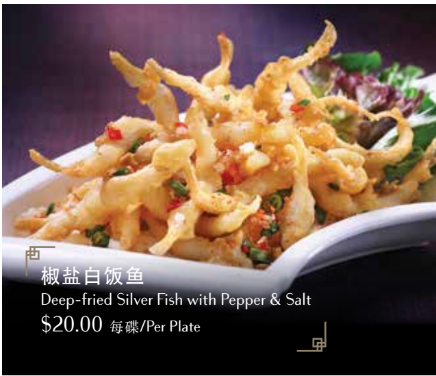
椒盐白饭鱼 Deep-fried Silver Fish with Pepper & Salt $20.00 每碟/Per Plate