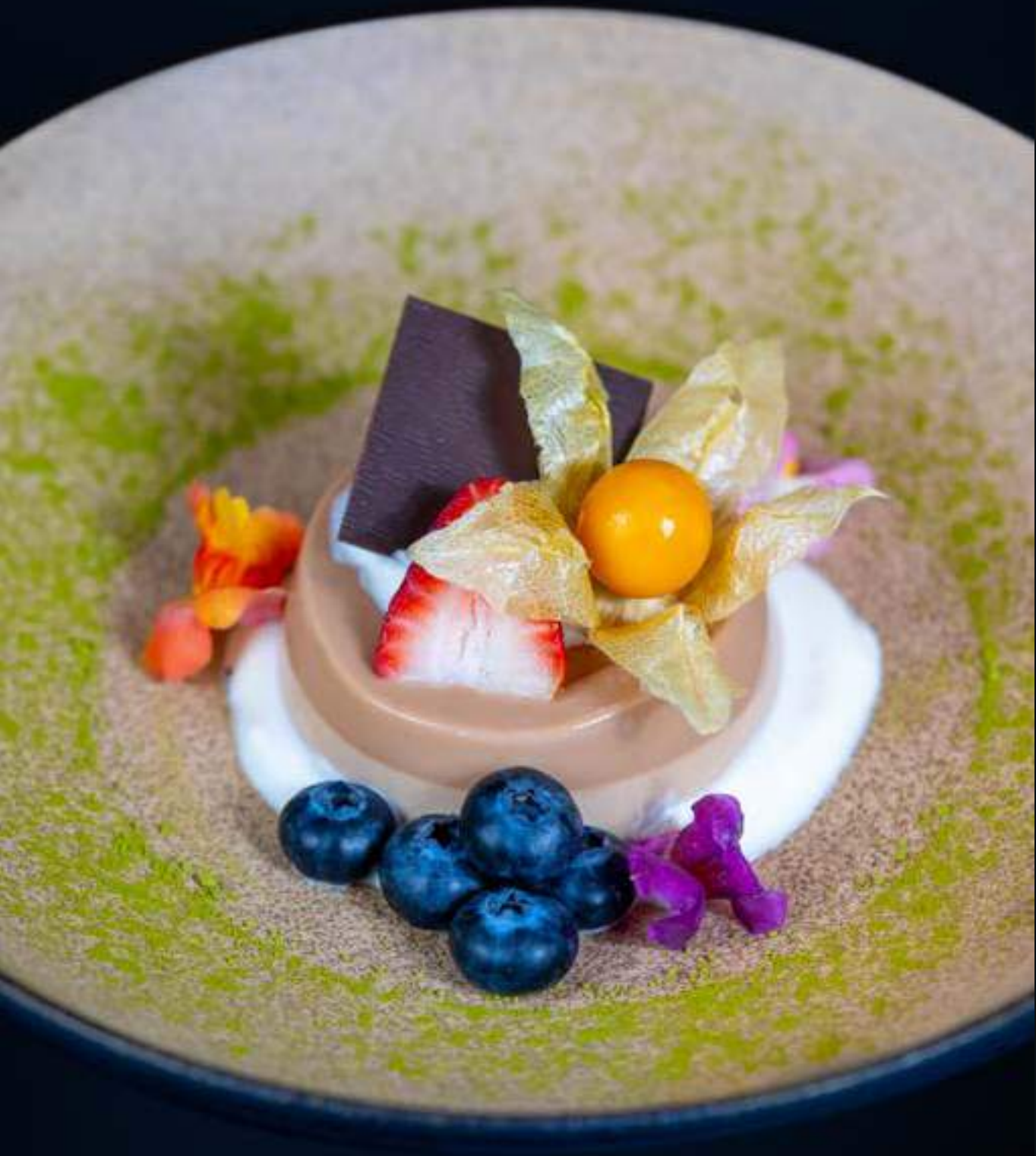
Earl Grey Panna Cotta