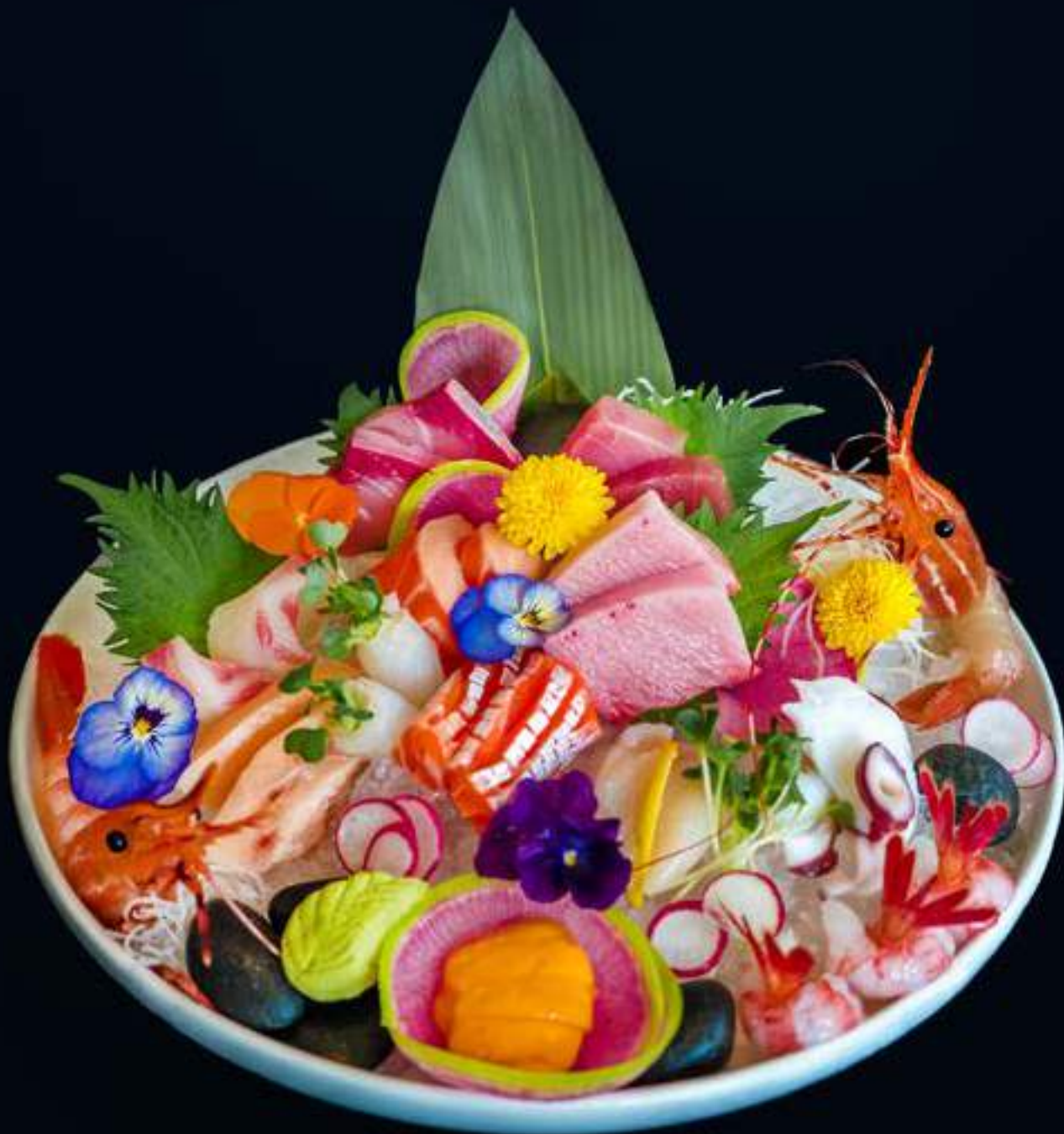
Chef's Omakase Sashimi Platter