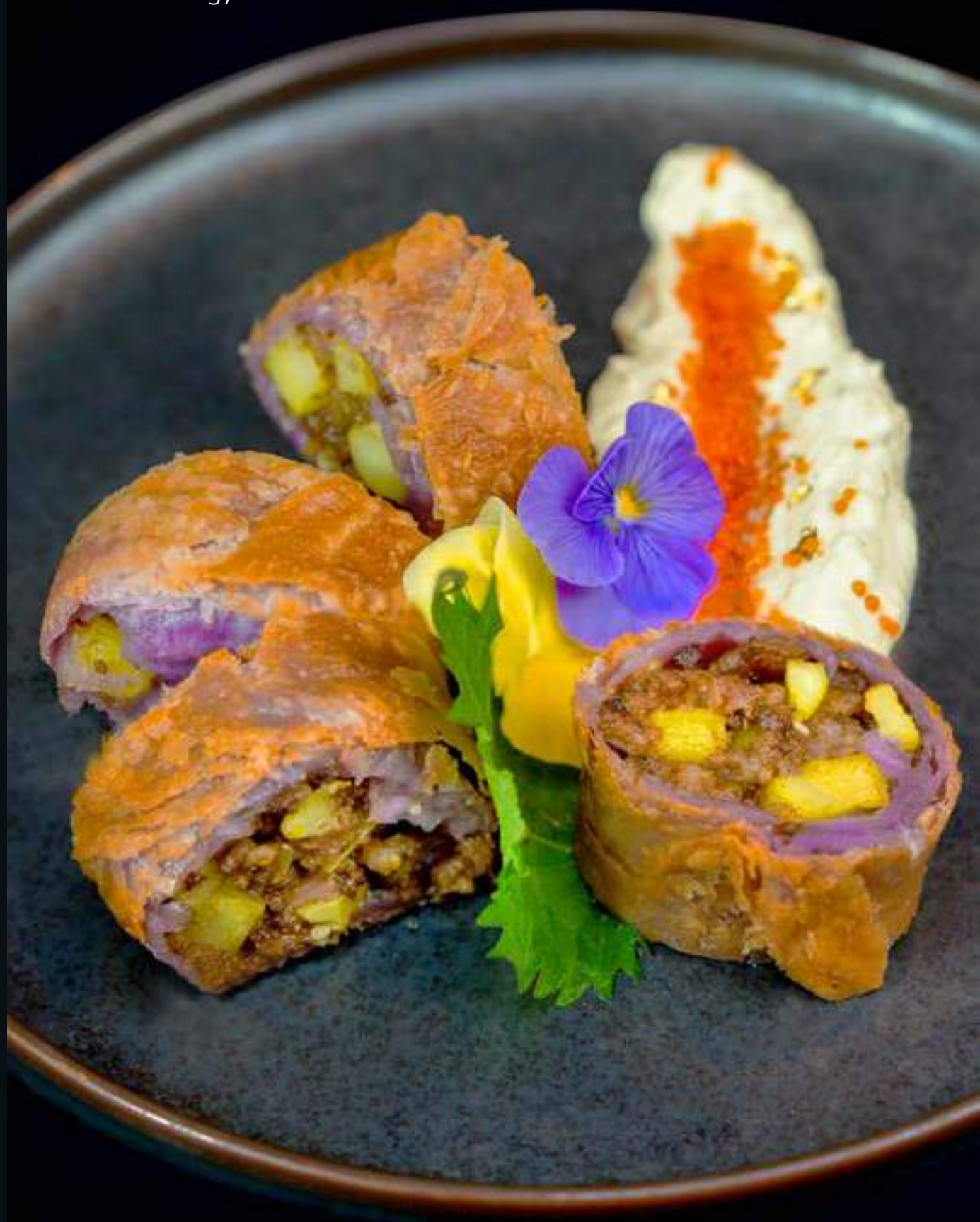
Minced Wagyu Purse