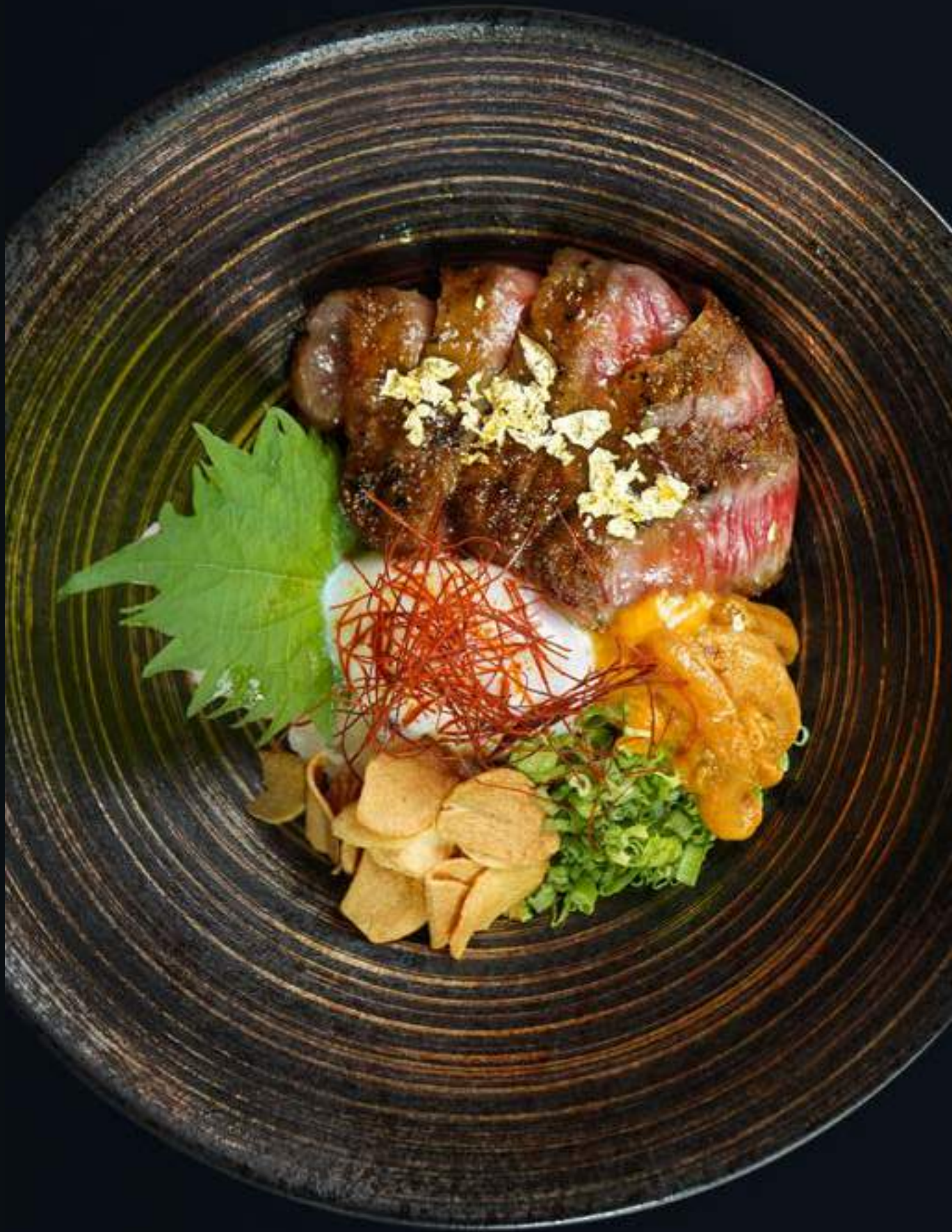
Mini Wagyu Don