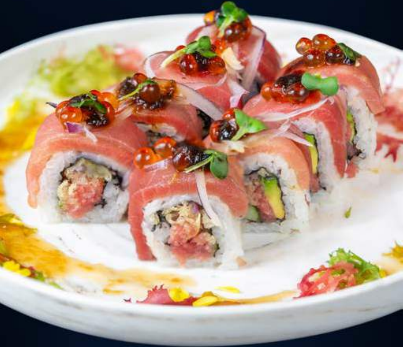
Maguro Madness Maki