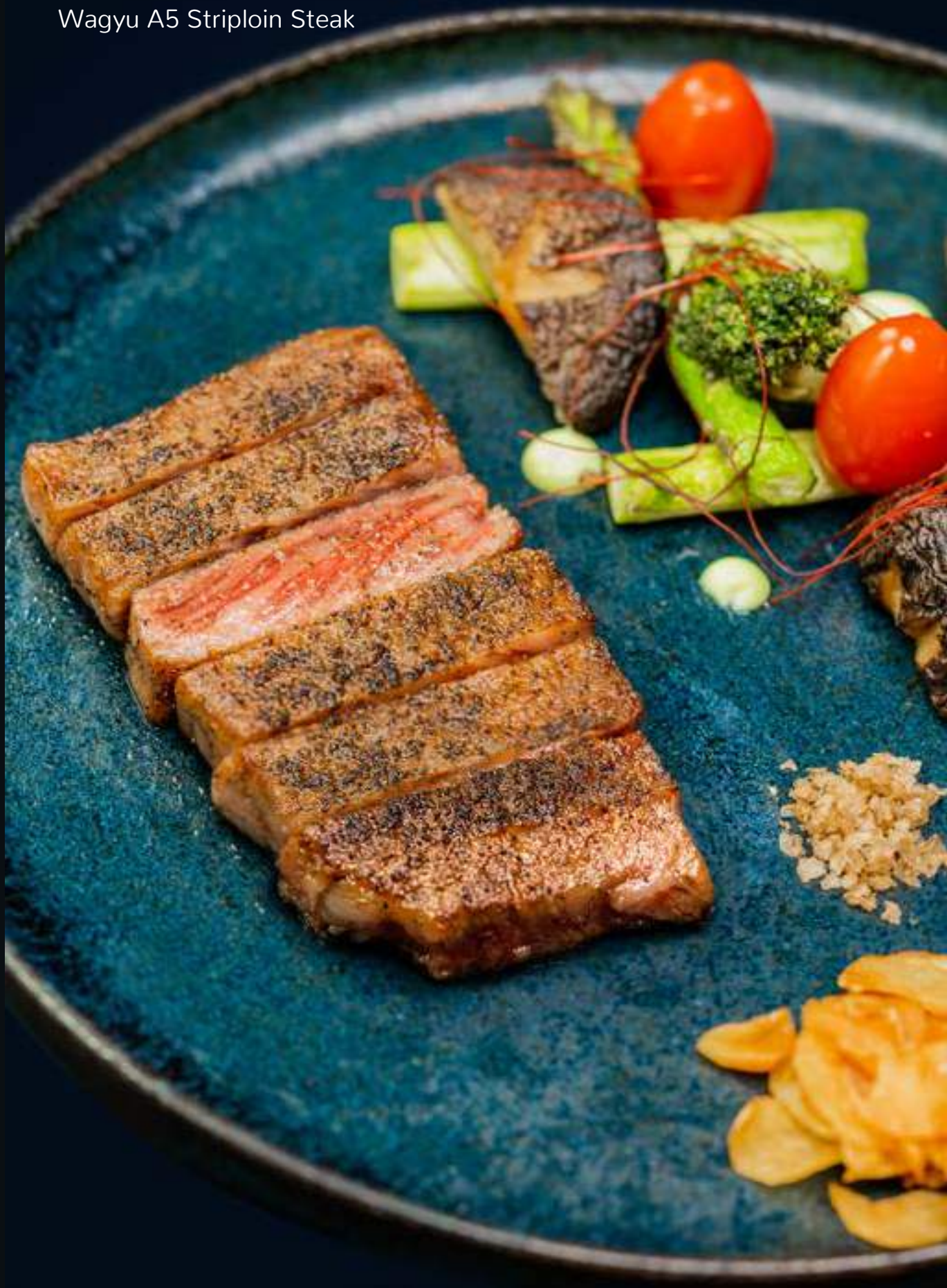
Wagyu A5 Striploin Steak