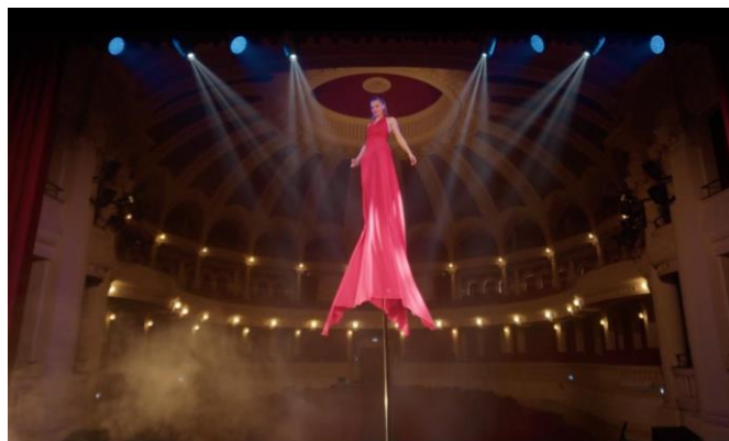
Italian creative agency Hovo Faber will be flying in performers for a special 'Where Art Takes Shape' inspired Dress Show at the Event Plaza

Other must-see installations include Drift (2010) by Antony Gormley, a massive three-dimensional stainless steel polyhedral matrix suspended cloud-like in the air of the atrium of Hotel Tower 1, and Wind Arbor (2011) by Ned Kahn, the largest and most visible piece of the art path as it features 260,000 aluminum metal flappers that reflect light and cools down the building.