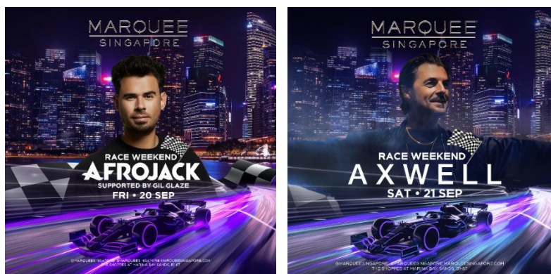
MARQUEE Singapore brings together two industry giants for two back-to-back performances over the F1 race weekend