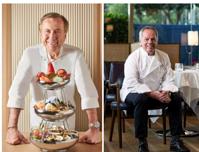
Celebrity chefs Daniel Boulud and Wolfgang Puck present a high-octane celebration with a culinary twist

Look forward to a dazzling evening on 19 September as two acclaimed Michelin-starred restaurants, CUT by Wolfgang Puck and Thevar, come together for an exclusive four-hands dinner (from 5pm, S$248++ per person). Presented by renowned celebrity chef Wolfgang Puck and chef Mano Thevar, the dinner will see both chefs bring their unique flair and mastery to the table for one evening only. Wine aficionados can enjoy the dishes with wine pairing options starting from S$148++ per person. Reservations are strongly encouraged; visit marinabaysands.com/restaurants/cut.html .