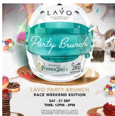
LAVO Party Brunch: Race Weekend Edition returns on 21 September

Gear up at noon with LAVO Party Brunch: Race Weekend Edition (21 September, 12pm – 4pm)