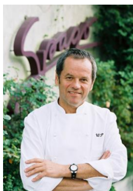
A Night with Wolfgang: A Culinary Retrospective will feature a curated menu showcasing chef Wolfgang's classic and timeless dishes alongside his cherished childhood favourites