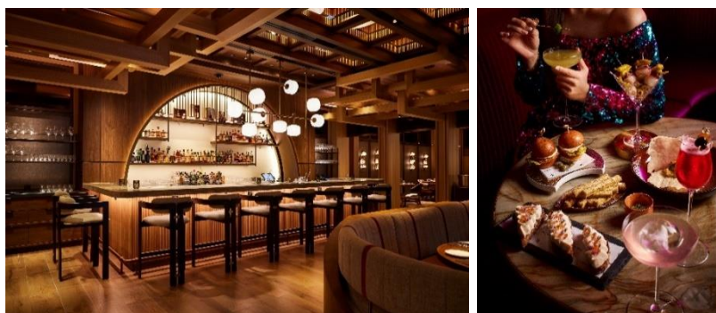
Step into the enthralling world of WAKUDA with a special bar takeover this F1 season

For the whole of September, fans of Scuderia Ferrari HP can look forward to a line-up of five innovative cocktails (S$28++ per glass) inspired by the history and legacy of the iconic team at contemporary Chinese restaurant Mott 32 . Rev up the tastebuds with F40 , a vibrant blend of tequila, crème de cassis and yuzu sake named after the iconic supercar. The spirited concoction is topped with a salt rim and adorned with a twisted dried orange peel, offering a perfect balance of sweet, sour and salty notes. Speed into flavour with the Scarlet Speedway that captures the essence of the team's iconic colour and energy with rosemary-infused rum, mixed with passion fruit puree and lime juice for a delightful, tropical zest, or indulge in Racing Green , a smooth and velvety beverage featuring tequila with undertones of fruity essence from Midori and pear sake. Fans who appreciate a sophisticated twist can savour Scuderia Drift, a bold and smokey number that combines the rich and complex flavours of whisky, Pedro Ximenez and Benedictine, or fuel up with a tribute to the passionate fans of Scuderia Ferrari HP named Tifosi , a luscious pink-hued gin-based cocktail complemented by the fruity flavours of pink guava puree and lemon which will end the night on a high note. For reservations, visit marinabaysands.com/restaurants/mott32.html .