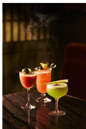
Mott 32 presents innovative cocktails inspired by the legacy of Scuderia Ferrari HP (from L to R): Tifosi ; Scarlet Speedway ; Racing Green

Racegoers can unwind with a sophisticated afterhours experience at KOMA Singapore from 20 to 21 September, as the modern Japanese restaurant specially extends its hours till 2am. Guests can look forward to special menus of cocktails and canapes, available from 11.30pm to 1.30am on both evenings. Presented on a mini version of KOMA's traditional Japanese foot bridge, one of the stunning interior highlights of the award-winning restaurant, the line-up comprises eight meticulously selected canapes that can be enjoyed with a caviar tin. For reservations, visit marinabaysands.com/restaurants/koma-singapore.html .