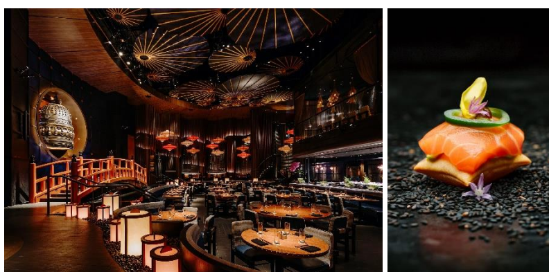
Live the good life at KOMA, one of the most stunning restaurants in the city; (second image) the signature salmon pillow , one of the highlights on the limited-time KOMA bridge

On 21 and 22 September, brunch like a champion at Bread Street Kitchen & Bar as the restaurant brings an extraordinary 8-course (S$98++) and 12-course (S$128++) brunch experience that will thrill racing fans and foodies alike. To complement the dishes, diners can enjoy free flow Ferrari champagne (additional S$48++ per person) – a fitting nod to the speed and luxury of the racing event – while soaking in the views of the waterfront. For reservations, visit marinabaysands.com/restaurants/bread-street-kitchen.html .