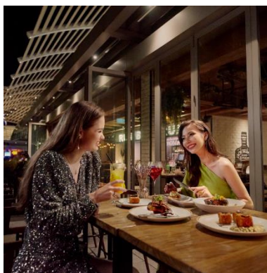
Yardbird joins in the electrifying weekend with a bar takeover by Sweet Liberty at The Loft on Level 1

Revel into the night at The Loft on Level 1 at Yardbird Southern Table & Bar , as the award-winning classic American restaurant presents a three-day collaborative menu with Miami Beach's cocktail royalty Sweet Liberty, neighbours of Yardbird's first location on South Beach. Starring Westland whiskey and campari, the innovative cocktails are perfect for savouring at any time of the day. Delight in Roses & Rosé , an aromatic cocktail that is shaken with cochini rosa and lychee, as well as Tropical Negroni , a refreshing cocktail that has a 48-hour infusion of fresh pineapples and mangoes before being shaken with passionfruit. Pair them with the king crab tortelli (S$78++), a sharing-style dish with heirloom baby beets, butter sauce, trout roe and sage. For reservations, visit marinabaysands.com/restaurants/yardbird-southern-table-and-bar.html .