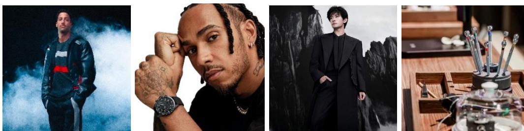
The Shoppes presents a range of capsule collections and shopping privileges during the exhilarating month of September (from L to R): HUGO’s collaboration with VISA Cash App RB Formula One team; Lewis Hamilton for IWC Schaffhausen; Jackson Yee for Emporio Armani; Panerai’s watchmaking flash masterclass.

The Shoppes at Marina Bay Sands presents an exciting line-up of special capsule collections and shopping privileges during the race season. In 2024, HUGO enters the world of Formula 1 in a brand-new collaboration with the Visa Cash App RB Formula 1 Team. The boutique at The Shoppes will showcase the limited-edition capsule collection featuring graphic contrasting lines and racing motifs. These include hoodies, sweats, T-shirts, leather pieces and the statement suit – each featuring the sporty side of HUGO’s distinctive tailoring. Meanwhile, amp up stylish outfits with IWC Schaffhausen as shoppers will receive a complimentary IWC Pilot’s crown cufflinks with a minimum spend of S$12,000 on a single timepiece in a single receipt from 16 to 23 September.