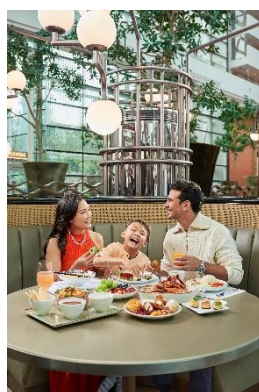
Make a delicious pit stop with the family with a special weekend brunch at RISE

Families are invited to immerse in the race-themed fun at RISE and Origin + Bloom