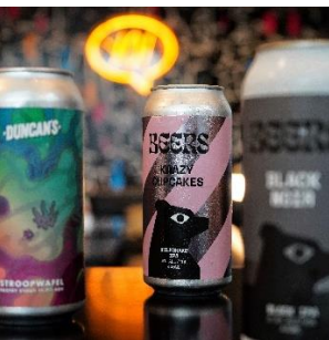
L-R: LAVO's Giotto's palette with Stanchi cocktail; Bread Street Kitchen's The Queen's Guard ; WAKUDA's Fushimi Inari Shrine cocktail with spicy tuna crispy rice; Duncan's Brewing beers at Black Tap

Bridging culinary delight with artistry, various restaurants across Marina Bay Sands will enchant guests with an assembly of over 40 newly created, limited-time cocktails and mocktails as well as bar bites in celebration of the wondrous world of art.