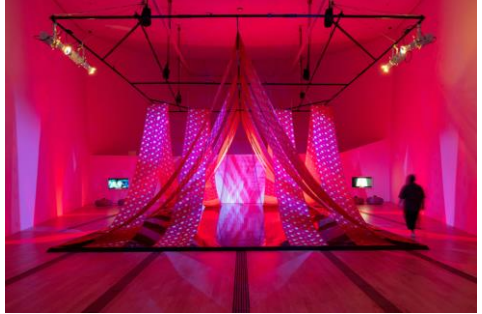
L to R: One of the galleries in Mars: The Red Mirror showcases contemporary artworks inspired by Mars; Red Silk of Fate – The Shrine (2023) by Sputniko! and Napp Studios & Architects at New Eden: Science Fiction Mythologies Transformed

During the festival, visitors can also lift off into a spectacular season of science and science fiction with two exhibitions at ArtScience Museum. <u>Mars: The Red Mirror</u> immerses visitors in many extraordinary worlds as they journey through 12,000 years of culture, art, history and science about Mars from ancient times to the present day, while <u>New Eden: Science Fiction Mythologies Transformed</u> uncovers new perspectives on the sci-fi genre through the lens of 24 women artists and collectives from Asia.