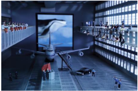
L to R: Stills from Cao Fei's moving image works - Nova (2019), Asia One (2018), La Town (2014)

Additionally, from 19 to 28 January, visitors can delve into aspects of the 20-year career of celebrated international artist Cao Fei with the film programme Technotopias: A Cao Fei Multiverse at ArtScience Museum. Having consistently contributed to the ever-changing shape of Asian futurism, Cao Fei's practice extends to a series of critically acclaimed moving image works that encapsulate the Asian dilemma of progress versus culture which the artist often presents in the most mundane of settings. From Asia One commissioned by the Guggenheim Museum in 2018, to the dystopic miniature dioramas of La Town and finally, her most recent sci-fi epic Nova – all of which are making their Southeast Asian premieres in this programme – Cao Fei creates worlds that are both poignant and playful. Serving as a counter to Western-centric ideals of the future, the film programme also encourages dreams of a better future in an increasingly fractured society.