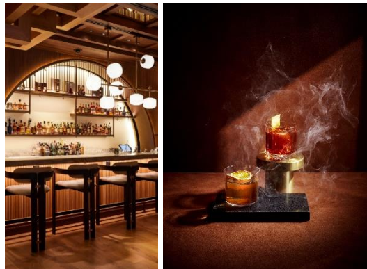
A tipping journey awaits with four inventive cocktails WAKUDA’s Negroni Month

For the month of July, elevate your evenings at ‘ Suntory Sundowner ’ at Spago Bar & Lounge with breathtaking views, refreshing drinks and delectable bites every Saturday between 5pm and 9pm. Delight in a selection of Suntory highballs and whisky cocktails at S$16++, perfectly paired with a specially curated menu of Japanese-inspired light bites, including grilled Japanese corn (S$10++), Japanese fried chicken ‘Karaage’ (S$14++) and Spago’s signature big eye tuna tartare cones (S$24++). For reservations, visit marinabaysands.com/restaurants/spago-bar-and-lounge.html .