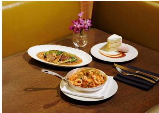
CUT by Wolfgang Puck presents a medley of local dishes this National Day (from L to R): U.S.D.A prime beef hor fun ; sambal fried rice ; Ondeh Ondeh chiffon cake

Bread Street Kitchen pays homage to Singapore's rich culinary heritage with a modern twist this National Day with its mouthwatering take on the classic chilli mud crab, available only on 9 August. Look forward to a succulent chilli mud crab (S$88++) cooked to perfection, and bathed in a rich, tangy chilli sauce, enhanced with subtle hints of spices and herbs that elevate the dish to new heights. Diners can also indulge in a meticulously crafted three-course menu (S$128++ per person) where they can choose between a slice of delicate beef wellington or chilli mud crab for mains, accompanied with a selection of refreshing appetisers and delectable sweets. For reservations, visit marinabaysands.com/restaurants/bread-street-kitchen.html .