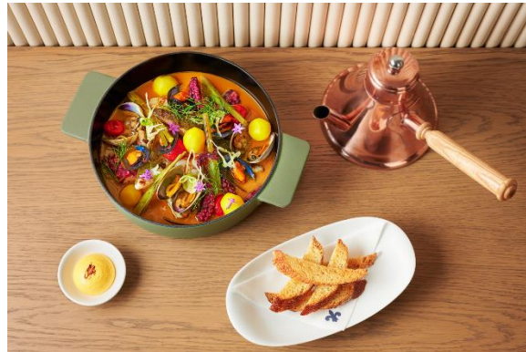
Experience Summer in Provence at Maison Boulud with iconic dishes such as the Bouillabaisse

aioli and pineapple vinaigrette. For reservations, visit marinabaysands.com/restaurants/black-tap.html .