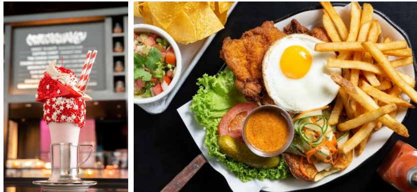
Black Tap shines the spotlight on local favourites bandung and nasi lemak through the National Day CrazyShake® and glorious Nasi Lemak Sandwich this August

Come August, revel in the nation's spectacular celebrations with the return of Black Tap's Singapore-exclusive National Day CrazyShake® (S$23++) – a tribute to the classic rose and milk beverage that many locals love. Available from 9 to 11 August, the pastel pink-hued bandung CrazyShake® is decked in patriotic colours of the Singapore flag, complete with red and white star sprinkles on a vanilla frosted rim, a slice of red and white cake, whipped cream, crescent icing cookie, red sprinkles, and a bright red cherry on top. The locally inspired Nasi Lemak Sandwich (S$25++) also makes a return from 1 to 31 August with its flavourful combination of crispy fried chicken, sunny side up egg, tangy sambal mayo and piquant pickled cucumber slaw. For reservations, visit marinabaysands.com/restaurants/black-tap.html .