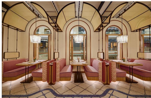
Celebrate National Day with a touch of French flair at Maison Boulud

Ring in the National Day revelry at LAVO Italian Restaurant & Rooftop Bar this 9 August, as the sky-high restaurant presents three splendid one-night only specials. Gather around the table for the Singapore chilli seafood with deep fried mantou (S$68++), starring Alaskan king crab legs, prawns, scallops and clams in a fiery chilli crab sauce. The Italian American restaurant also nods to Singaporeans' love for crustaceans with the butter cereal slipper lobster (S$58++), a fragrant wok fried delicacy boasting firm, sweet meat that adds a burst of flavour with curry leaves and oats. Cool off from the heat with the strawberry maritazzi (S$22++), decked in patriotic colours of red and white with strawberry compôte and vanilla cream sandwiched between a pair of sweet almond buns. Pair these indulgent creations with LAVO's signature series of handcrafted cocktails in hand as you enjoy unparalleled views of the fireworks from 57 storeys above. For reservations, visit marinabaysands.com/restaurants/lavo.html .