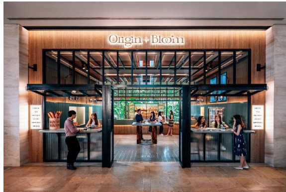
Sweeten your day with intricate National Day-themed treats at Origin + Bloom

from 5.30pm to 10pm. For reservations, visit marinabaysands.com/restaurants/maison-boulud.html .