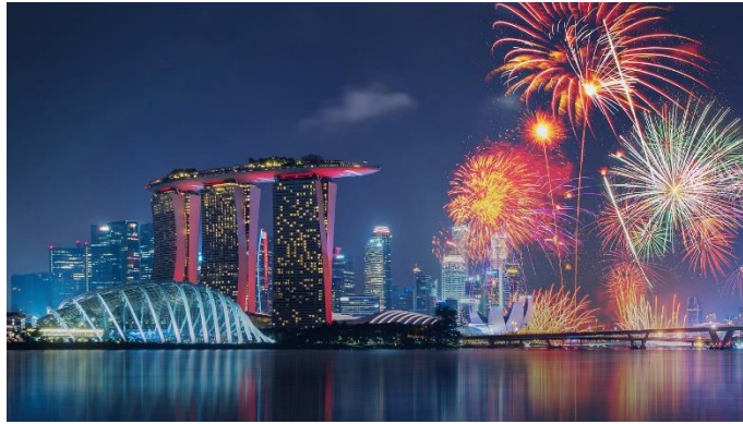
Commemorate Singapore's National Day at SkyPark Observation Deck

Flock to Yardbird Southern Table & Bar for its National Day special of smoked-kissed Chicken Satay sandwich (S$32++), available all day on 9 August. The gourmet sandwich features tantalising peanut sauce smothered on a succulent grilled boneless chicken thigh, stacked with familiar sides of nasi impit (compressed rice cakes), cucumbers and red onions for a delectable crunch. For reservations, visit marinabaysands.com/restaurants/yardbird-southern-table-and-bar.html .