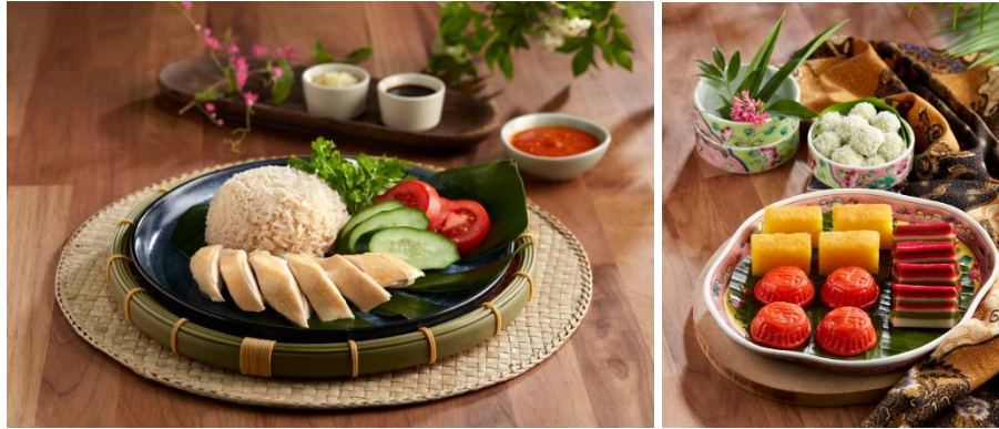
Singapore's heritage delicacies take centrestage at RISE this National Day (from L to R): Hainanese chicken rice ; local assortment of kueh kuehs

With over 100 sumptuous delicacies to please every palate, Marina Bay Sands' signature restaurant RISE promises a splendid Singapore National Day celebration from 8 to 9 August. Indulge in hearty mains such as the iconic Hainanese chicken rice and roasted pork belly , an array of Indian handipots and slow-braised Australian wagyu beef cheek rendang marinated with a mélange of spices and steeped in coconut milk, and fulfill cravings for the freshest catch of the sea with Sri Lankan crabs prepared in three cooking styles, from chilli crab sauce and Sarawak black pepper to salted egg yolk & butter, as well as braised whole seabass with sambal and wok-kissed hawker-style noodles with lobster . Sweeten up with a medley of desserts celebrating Singapore's rich heritage, from whole cakes such as pineapple sugee and pandan gula melaka layered cake , to a twist on tradition with yuan yang cheesecake (Nanyang-style coffee and tea), Singapore Sling pound cake , milo dinosaur chocolate gateau , and a beautiful assortment of Nyonya kueh-kuehs .