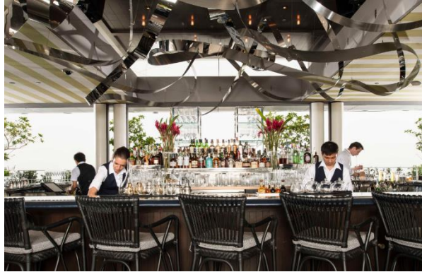
Indulge in Suntory highballs and whisky cocktails at Spago Bar & Lounge

For the month of July, elevate your evenings at ‘ Suntory Sundowner ’ at Spago Bar & Lounge with breathtaking views, refreshing drinks and delectable bites every Saturday between 5pm and 9pm. Delight in a selection of Suntory highballs and whisky cocktails at S$16++, perfectly paired with a specially curated menu of Japanese-inspired light bites, including grilled Japanese corn (S$10++), Japanese fried chicken ‘Karaage’ (S$14++) and Spago’s signature big eye tuna tartare cones (S$24++). For reservations, visit marinabaysands.com/restaurants/spago-bar-and-lounge.html .