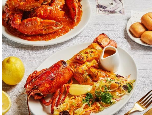
LAVO celebrates National Day with two seafood dishes that pays homage to Singapore's treasured flavours (for illustration purpose only)

Ring in the National Day revelry at LAVO Italian Restaurant & Rooftop Bar this 9 August, as the sky-high restaurant presents three splendid one-night only specials. Gather around the table for the Singapore chilli seafood with deep fried mantou (S$68++), starring Alaskan king crab legs, prawns, scallops and clams in a fiery chilli crab sauce. The Italian American restaurant also nods to Singaporeans' love for crustaceans with the butter cereal slipper lobster (S$58++), a fragrant wok fried delicacy boasting firm, sweet meat that adds a burst of flavour with curry leaves and oats. Cool off from the heat with the strawberry maritazzi (S$22++), decked in patriotic colours of red and white with strawberry compôte and vanilla cream sandwiched between a pair of sweet almond buns. Pair these indulgent creations with LAVO's signature series of handcrafted cocktails in hand as you enjoy unparalleled views of the fireworks from 57 storeys above. For reservations, visit marinabaysands.com/restaurants/lavo.html .