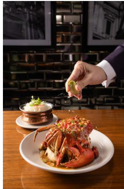
The chilli mud crab at Bread Street Kitchen makes its return this National Day

Bread Street Kitchen pays homage to Singapore's rich culinary heritage with a modern twist this National Day with its mouthwatering take on the classic chilli mud crab, available only on 9 August. Look forward to a succulent chilli mud crab (S$88++) cooked to perfection, and bathed in a rich, tangy chilli sauce, enhanced with subtle hints of spices and herbs that elevate the dish to new heights. Diners can also indulge in a meticulously crafted three-course menu (S$128++ per person) where they can choose between a slice of delicate beef wellington or chilli mud crab for mains, accompanied with a selection of refreshing appetisers and delectable sweets. For reservations, visit marinabaysands.com/restaurants/bread-street-kitchen.html .