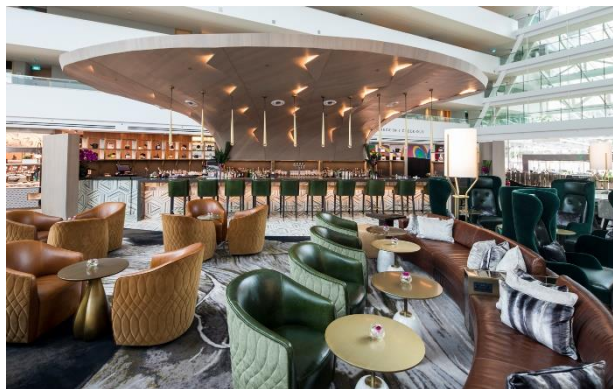
Unwind at the lobby lounge over two limited time pairings in August

This National Day, Origin + Bloom celebrates the cultural and ethnic diversity of the Lion City with five picture-worthy mini cakes (from S$9), available from 5 to 11 August at the flagship café in the lobby of Hotel Tower 3. From a sweet rendition of Nasi Lemak , magnified versions of childhood treats such as gem cookie and white rabbit , a twist on the classic angku kueh and a decadent bandung “ice cream” sandwich, the collection embodies the Singaporean identity with nostalgic flavours for a walk down memory lane. For enquiries, visit marinabaysands.com/restaurants/origin-and-bloom.html .