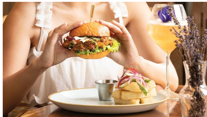
Indulge in Yardbird's limited-time chicken satay sandwich this National Day