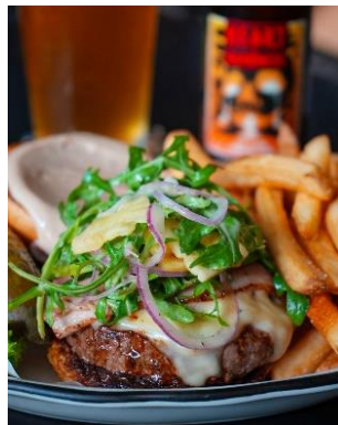
Enjoy a taste of pristine paradise with Black Tap's Maui Wowi Burger

This July, kick it with Black Tap's craft burger experience and savour the new Maui Wowi Burger (S$27++), a Hawaiian-inspired burger featuring prime beef with black garlic and pepper teriyaki sauce, topped with melted Swiss cheese, prosciutto cotto, grilled pineapple, fresh arugula, garlic