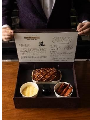
Bread Street Kitchen presents the Beef Wellington Takeaway Box for the first time

Experience a culinary masterpiece at Bread Street Kitchen & Bar as the beef wellington , one of Chef Gordon Ramsay's most iconic creations and the restaurant's best-selling dish, arrives in a brand-new format. The first-of-its-kind Beef Wellington Takeaway Box (S$205 nett) features a whole beef wellington cooked to a perfect medium rare accompanied by brie mash potatoes, exquisite honey roast carrots and a savoury beef jus sauce, perfectly nestled in a luxurious box. Beyond a delightful treat, it is ideal as an unforgettable gift or to make an impression at a party. The takeaway box will be available for pre-orders from 13 June for pick-up from 16 June. For more information, visit marinabaysands.com/restaurants/bread-street-kitchen.html .