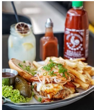
Saigon BBQ Chicken Burger at Black Tap delivers robust flavour highlighted by hoisin barbecue sauce

This June, indulge in Black Tap 's Saigon BBQ Chicken Burger (S$24++), featuring a tantalising harmony of exotic flavours and textures of juicy chicken patty layered with chicken liver pâté and mortadella. Elevated with a drizzle of tangy hoisin BBQ sauce, perfectly balanced with the unique zesty crunch of pickled green papaya and topped with fresh coriander and spring onions for an aromatic finishing touch, this burger brings a sweet and savoury depth to each bite. Pair the mouthwatering meal with Black Tap's selection of craft beers including Singapore's Lion Brewery Island Lager on tap (S$18++) and a bottle of Vietnam's Heart of Darkness Island Tropical Lager (S$14++). For reservations, visit marinabaysands.com/restaurants/black-tap.html .