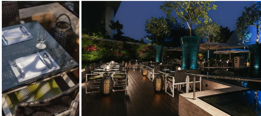
Located in Hotel Tower 1, RISE Outdoors beckons with an alfresco retreat amidst lush greenery for a picturesque hideout to dine and unwind for every occasion

Experience a culinary masterpiece at Bread Street Kitchen & Bar as the beef wellington , one of Chef Gordon Ramsay's most iconic creations and the restaurant's best-selling dish, arrives in a brand-new format. The first-of-its-kind Beef Wellington Takeaway Box (S$205 nett) features a whole beef wellington cooked to a perfect medium rare accompanied by brie mash potatoes, exquisite honey roast carrots and a savoury beef jus sauce, perfectly nestled in a luxurious box. Beyond a delightful treat, it is ideal as an unforgettable gift or to make an impression at a party. The takeaway box will be available for pre-orders from 13 June for pick-up from 16 June. For more information, visit marinabaysands.com/restaurants/bread-street-kitchen.html .