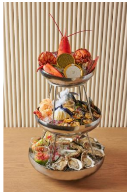
Maison Boulud presents a three-course Bastille Day brunch menu on 13 and 14 July

Tickets are available online ; early bird tickets are priced at S$168 per person, while general admission tickets are priced at S$188 per person.