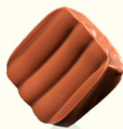
African Ball Tea, Peanut & Salted Caramel