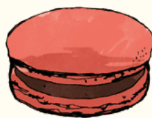
Bain de Roses Tea