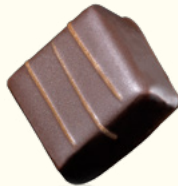
Napoleon Tea & Caramel