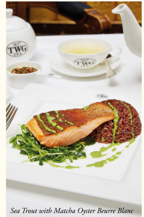
Sea Trout with Matcha Oyster Beurre Blanc