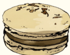
Vanilla Bourbon Tea & Blackcurrant