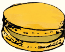
Lemon Bush Tea