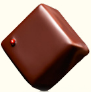
Singapore Breakfast Tea & Hazelnut