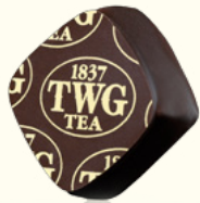
1837 Black Tea, Dark Chocolate Ganache