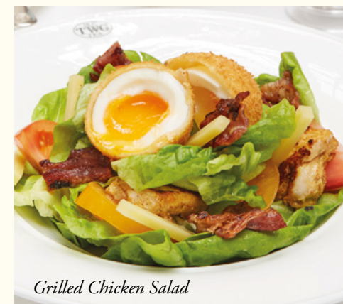
Grilled Chicken Salad