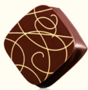
Lemon Bush Tea, White Chocolate Ganache