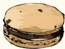
Number 12 Tea & Tiramisu