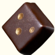
Matcha Nara, White Chocolate Ganache