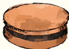
Earl Grey Fortune & Chocolate