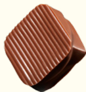
1837 Green Tea, Raspberry & Caramel