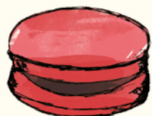
1837 Black Tea & Blackcurrant