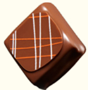
Polo Club Tea, Chestnut & Apricot