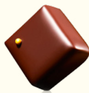
Grand Wedding Tea & Passion Fruit