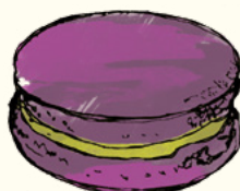
Grand Wedding Tea, Passion Fruit & Coconut