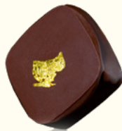
Earl Grey Fortune, Dark Chocolate Ganache