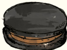
Napoleon Tea & Caramel