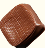
Spice Route Tea, Banana & Ginger