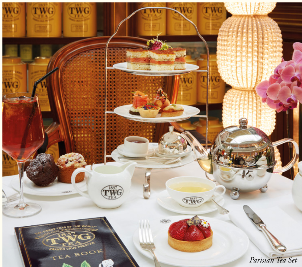
Parisian Tea Set