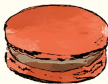
Pink Garden Tea & Lychee