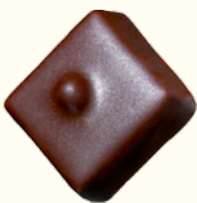
White Night Jasmine Tea, Dark Chocolate Ganache