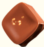
Miraculous Mandarin Tea, Sesame & Honey