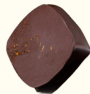
Vanilla Bourbon Tea, Dark Chocolate Apricot