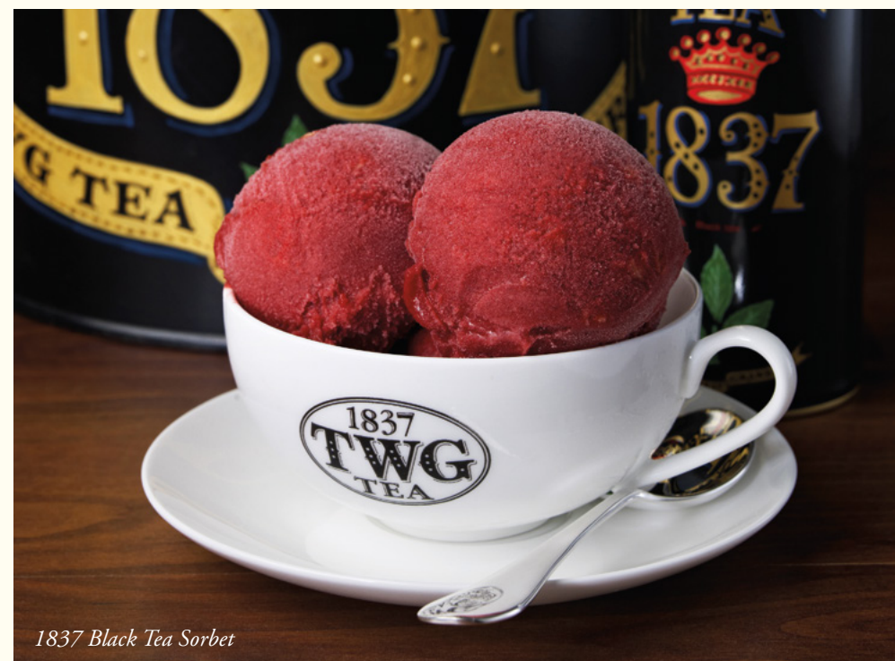
1837 Black Tea Sorbet