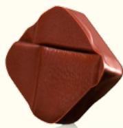
Camelot Tea & Gianduja