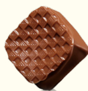
Brothers Club Tea, Maple Syrup & Pecan