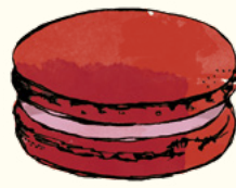
Silver Moon Tea & Strawberry