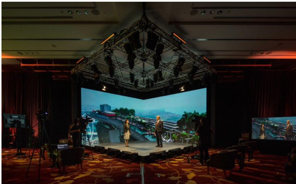
Marina Bay Sands' state-of-the-art hybrid event broadcast studio

The world-class studio is set to transform MICE events into immersive visual experiences