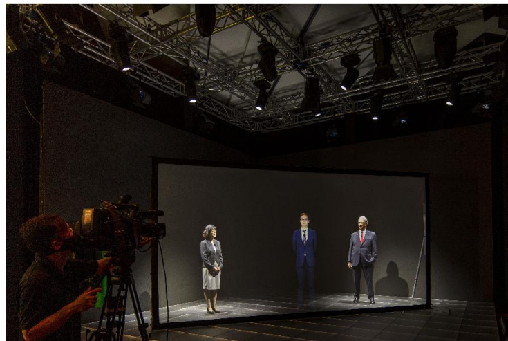
The studio's holographic telepresence abilities allow planners to beam speakers 'live' into Singapore

The world’s largest and most recognised network of business events strategists, PCMA’s (Professional Convention Management Association) much anticipated annual Convening Leaders conference is the best industry showcase of a highly effective hybrid event. The annual meeting gathers business events professionals around the world to drive innovative ideas and gain insights from industry leaders. Aligning with PCMA’s belief in the transformative power that business events can bring, Marina Bay Sands soft launched the hybrid broadcast studio late in July through a collaboration with PCMA. Attendees of the inaugural “PCMA Asia Pacific Community Conversations” were given a sneak preview during the virtual event’s welcome address. The integrated resort also recently partnered PCMA and the Singapore Tourism Board (STB) to launch PCMA’s Digital Event Strategist (DES) accreditation to a select group of international clients. The virtual kick-off session’s welcome address demonstrated to the virtual attendees how holographic telepresence could be used in a hybrid event setting by beaming in one of the presenters onto the set.