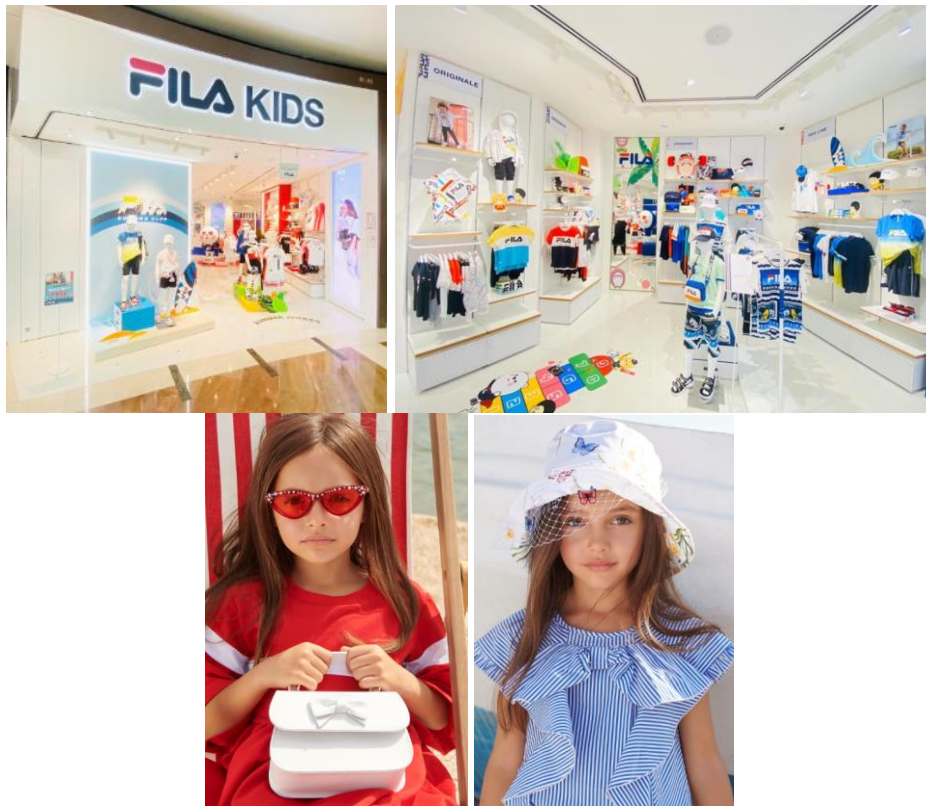
(Top) Fila Kids joins The Shoppes' children's precinct; (Bottom): New-to-market Italian childrenswear brand Monnalisa offers apparel for 0 to 16 year olds, from daily and sportswear to couture designed for special occasions.

The Shoppes' already impressive luxury children's precinct is also in the midst of expansion, with the recent opening of Fila Kids in July, as well as new-to-market Italian kidswear label Monnalisa with its first and only standalone store in Southeast Asia this month.