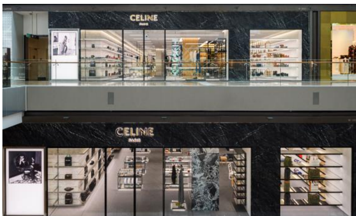
CELINE's largest flagship store in Southeast Asia boasts a balanced and expansive sculptural interior.

In addition to CELINE's outstanding handbag collection – such as the Ava Bag, the newly launched Pico-sized Belt bag, and the iconic Triomphe handbag – shoppers can discover CELINE's latest ready-to-wear collection featuring sharp tailoring, flou bohemian dresses and perfect-for-everyday knitwear pieces, fusing elegance and modernity with a touch of Parisian flair.