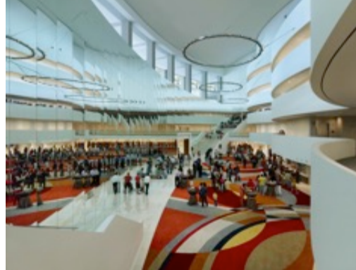
The MasterCard Theatres at Marina Bay Sands

Meeting planners and delegates can indulge in world-class entertainment and dining experiences at Marina Bay Sands, with the integrated resort's Show & Dine Entertainment package. This customisable package allows guests to select from an array of shows being staged at The MasterCard Theatres, and book a sumptuous pre- or post-theatre dinner at participating celebrity chef restaurants. There are also additional options for guests to add a hotel stay or a visit to the Sands SkyPark or ArtScience Museum. For more information, visit http://www.marinabaysands.com/entertainment/show-packages.html