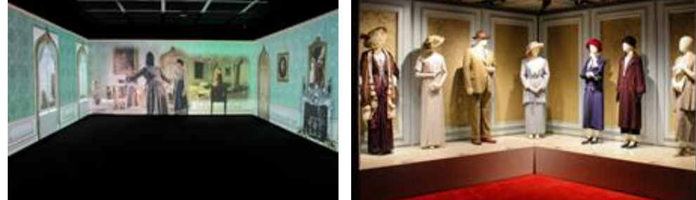
The exhibition features a mix of immersive video screenings and costume displays.

"The show is extremely large and immersive, much larger than most normal galleries will accommodate. Expo halls are actually the perfect setting for experiences like this as the physical space was excellent for us to work in. It also gave us an excellent opportunity to focus on the details of each environment, with plenty of space to make any adjustments to recreate the authentic Downton experience," Zaller said.