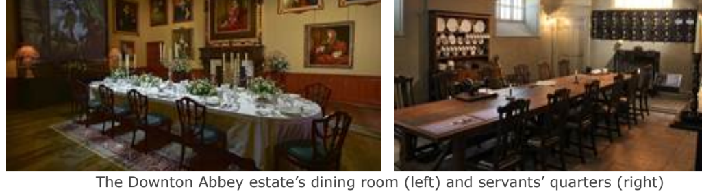
The Downton Abbey estate's dining room (left) and servants' quarters (right)

Presented by NBCUniversal and created by Imagine Exhibitions, Inc., the exhibition features re-created scenes from the television show, designed to make visitors feel as though they are walking through the Downton Abbey estate itself – from the busy kitchens to the intimate confines of the bedrooms.