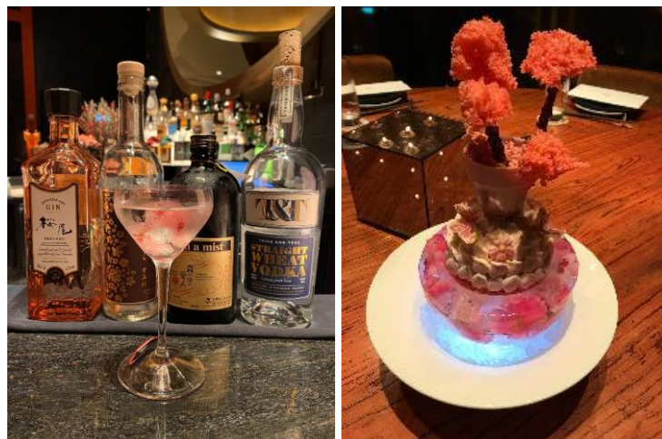
Usher in the season of cherry bloom with sakura-themed cocktails and dessert at KOMA (from L to R): Sakura Martini; Sakura baked Alaska

KOMA salutes the achievements of all women on International Women's Day with a one-for-one cocktail promotion on 8 March. Guests can choose from four KOMA signature cocktails – including the KOMA Canary , a gin cocktail with saffron syrup and lemon; the Sakura Spritz with Brachetto d'Acqui, prosecco and Mancino Sakura vermouth; the spirit forward Sawayaka Sake , a blend of Tried & True vodka, yuzu sake, shiso juice and spiced honey; and the Umeshu Sunrise with Komasa umeshu, yuzu sake, spiced honey and grapefruit soda. The one-for-one promotion will be available from 7pm to 10pm on 8 March.