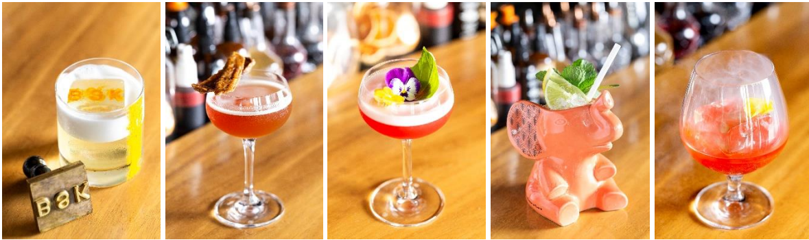
Enjoy creative cocktails over sunsets by the Marina Bay waterfront promenade (from L to R): ABV% Camomile; Peachy Blinder; Wild Flower; Tropic Like It's Hot; Mezcalina

Relive your tropical paradise getaway at Bread Street Kitchen by Gordon Ramsay as the restaurant introduces five brand new tipples inspired by the spectacular Marina Bay waterfront. Featuring flavours such as passionfruit, banana and coconut, these original cocktail creations are perfect for basking in the sun by the scenic palm-tree lined promenade.