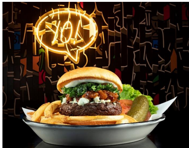
Black Tap introduces the PBJ Burger as a limited-time special for the month of March

Starting 1 March, Black Tap Craft Burgers and Beer will be presenting its special of the month – the PBJ Burger (pear bacon jam burger; S$27++). A treat with contrasting flavours and textures, the PBJ Burger features a juicy USDA prime beef patty topped with blue cheese crumbles, sweet-savoury pear-bacon jam, crispy fried kale and fragrant roasted garlic aioli, sandwiched between two pillowy potato buns. Enjoy the burger with a generous side of Idaho fries and one of Black Tap's nine gravity-defying CrazyShakes ® milkshakes.