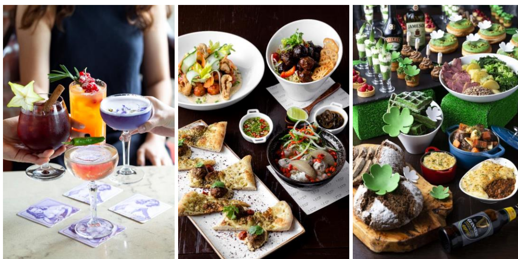
Ring in celebratory feasts at LAVO (from L to R): Four alluring cocktails on International Women's Day; four variations of meatballs for different palates on International Meatball Day; the return of LAVO's Champagne Brunch for St. Patrick's Day

LAVO Italian Restaurant & Rooftop Bar is celebrating International Women's Day on 8 March with four exclusive cocktails to toast the occasion. Guests can indulge in the Purple Haze , a gin cocktail made with St. Germain elderflower liqueur and elderflower syrup; the Sweet Elena , a barrel aged Sangria cocktail; the whimsical Prom Dance , created with Stolichnya vodka, dry vermouth and agave syrup; or Mango Sunrise , a tropical delight using Don Julio tequila, Cointreau, mango puree and banana syrup. All four cocktails are priced at S$18++ each and will be available from 11am to 10pm on 8 March.