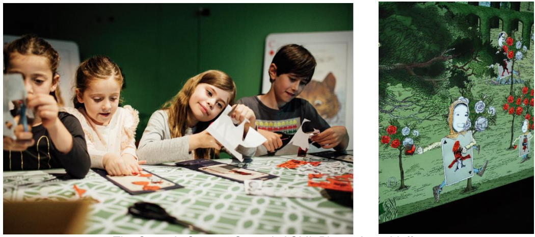
The Queen's Croquet Ground, ACMI, Photo: Anne Moffatt

Developed by Sandpit, the Lost Map of Wonderland serves as a physical interactive tool that offers visitors a unique exhibition experience – triggering different video, audio and interactive content at Wonderland . At The Queen's Croquet Ground , the map plays an integral part to the craft activity component, allowing visitors' work to be brought to life digitally, projected on a large wall for all to see.