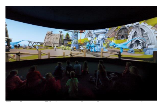
The Dragon Flight, a 40-foot diameter, 180-degree panoramic screen

Fans will be provided with interactive opportunities throughout the exhibition that unveil the secrets of creative filmmaking and animation. Visitors of all ages can learn the basic principles of animation while creating their own short movie at The Animation Desk, using a simplified version of DreamWorks' software.