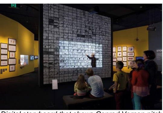
Digital storyboard that shows Conrad Vernon pitching for Shrek's infamous 'Interrogating Gingy' scene

A massive digital storyboard anchors the Story gallery. Visitors will be drawn in as they watch filmmaker Conrad Vernon perform, step-by-step, his gripping pitch for the infamous 'Interrogating Gingy' scene in Shrek .