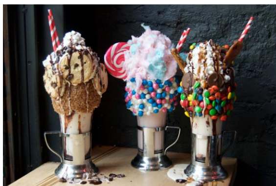
Black Tap Singapore will offer the brand's signature specialty Crazyshake™ milkshakes

A huge part of Black Tap's DNA is its unique beverage programme, which features a diverse menu of signature cocktails, mocktails, craft beers, and more. Notable brews include the Brooklyn Lager, Sweetwater Hop Hash Session IPA as well as local brews, such as the Singapore Blonde Ale. Signature cocktails include the Black Tap Mule , featuring vodka, fresh ginger, cucumber, lime and club soda, and the Mint Green Tea , Jameson, Gilford Peche de Vigne, lemon and fresh mint.