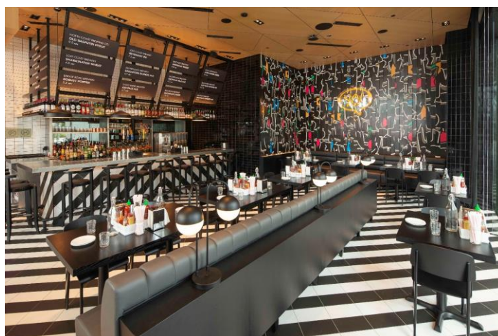
Black Tap Singapore offers a casual vibe reminiscent of a classic American luncheonette

A huge part of Black Tap's DNA is its unique beverage programme, which features a diverse menu of signature cocktails, mocktails, craft beers, and more. Notable brews include the Brooklyn Lager, Sweetwater Hop Hash Session IPA as well as local brews, such as the Singapore Blonde Ale. Signature cocktails include the Black Tap Mule , featuring vodka, fresh ginger, cucumber, lime and club soda, and the Mint Green Tea , Jameson, Gilford Peche de Vigne, lemon and fresh mint.