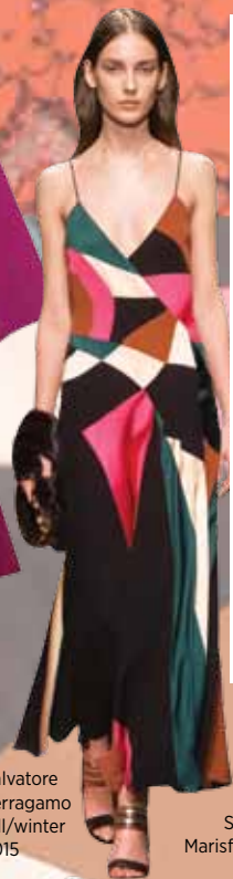
Salvatore Ferragamo fall/winter 2015