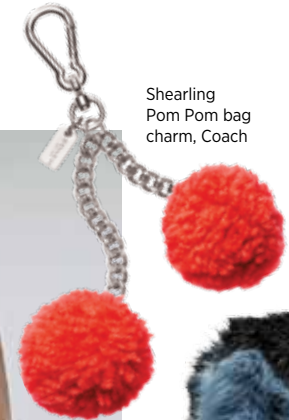
Shearling Pom Pom bag charm, Coach

Fashion goes tactile with fluffy accoutrements that feel as good as they look—fur real!