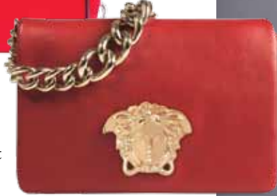
Palazzo bag, Versace