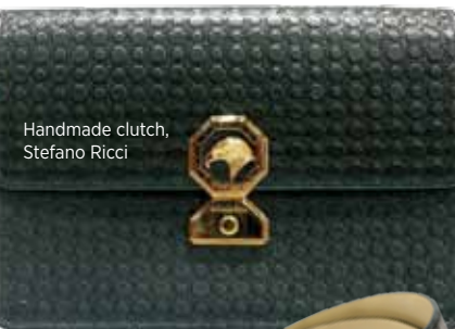
Handmade clutch, Stefano Ricci

Not that a gentleman needs an excuse to look on-point, but the holiday season calls for an impeccable ensemble. Indulge in plush textures like exotic skins and precious metals for understated elements that will not be lost on the trained sartorial eye.