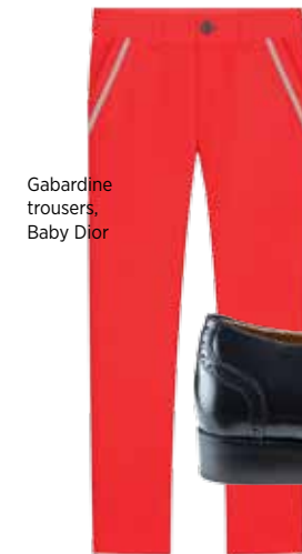
Gabardine trousers, Baby Dior