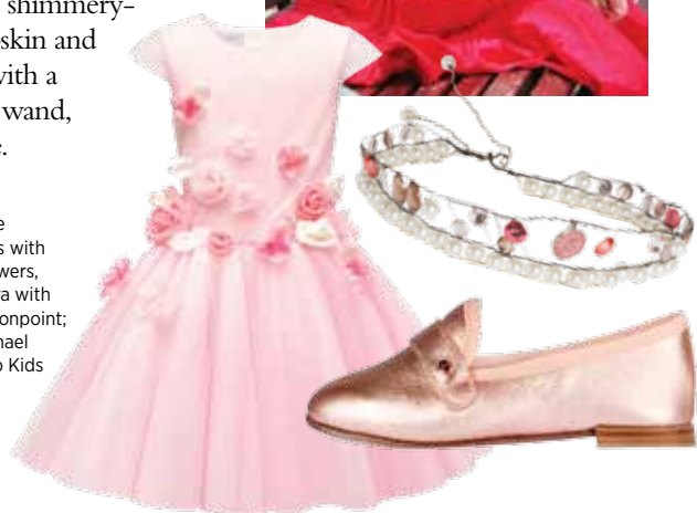
From left: Tulle exclusive dress with handmade flowers, Baby Dior; tiara with rhinestones, Bonpoint; Lambskin Michael loafer, Repetto Kids

Swathe your sweet little bundle of joy in the cosiest and most decadent baby must-haves of the season.