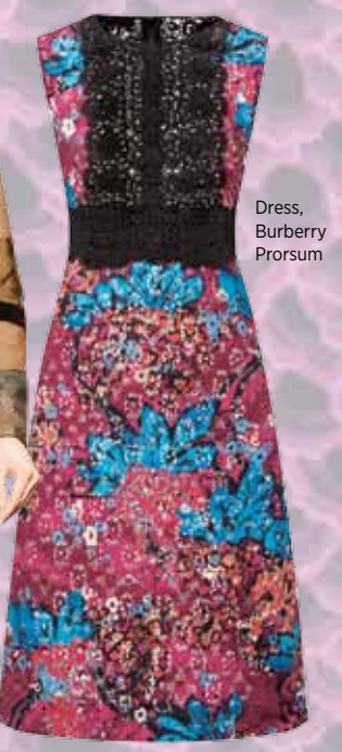
Dress, Burberry Prorsum