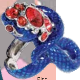
Ring, Roberto Cavalli