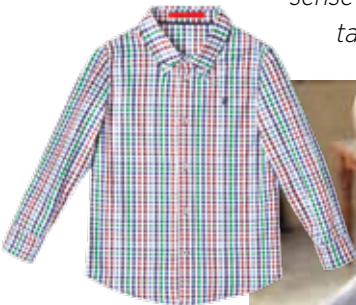
Cotton shirt, CH Carolina Herrera

Play up your little fashionmeister's sense of style with festive looks tailored for the tiny set.