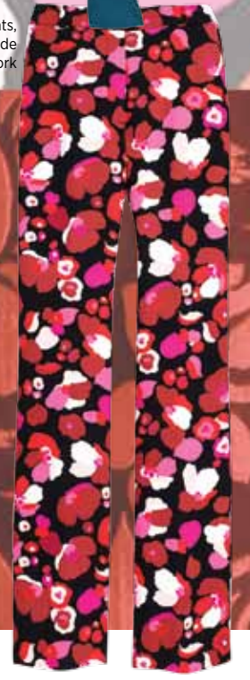
Pants, Kate Spade New York