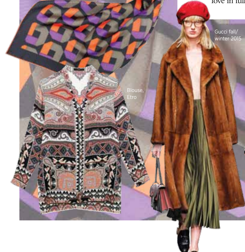
Gucci fall/winter 2015