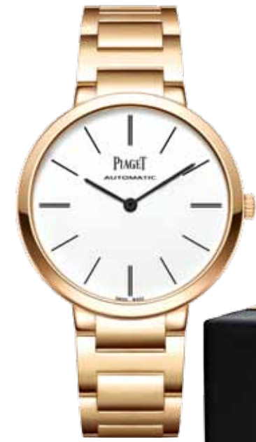
From top: Pink gold Altiplano (38mm) watch, Piaget; Gift Box clutch, Kate Spade New York; Mini Lily in Metallic, Mulberry

From a subtle gleam to high wattage sheen, there’s no doubt that the gold rush is a fashion look that transcends seasons.