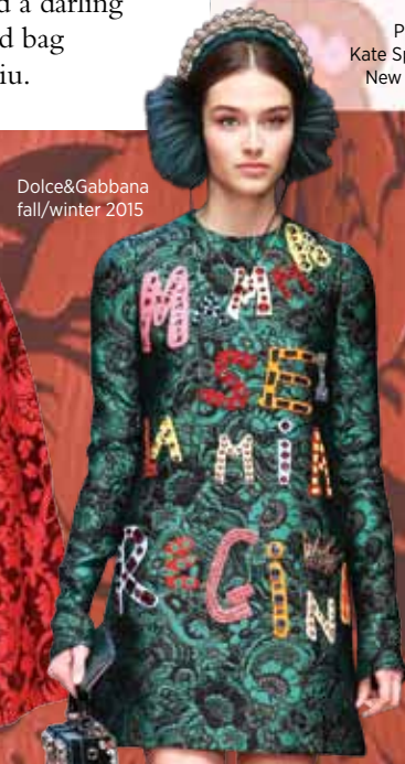
Dolce&Gabbana fall/winter 2015