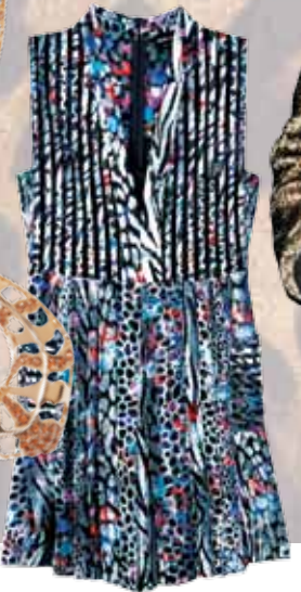
Dress, Emporio Armani