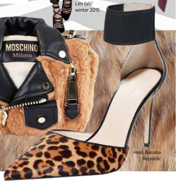
Heel, Banana Republic