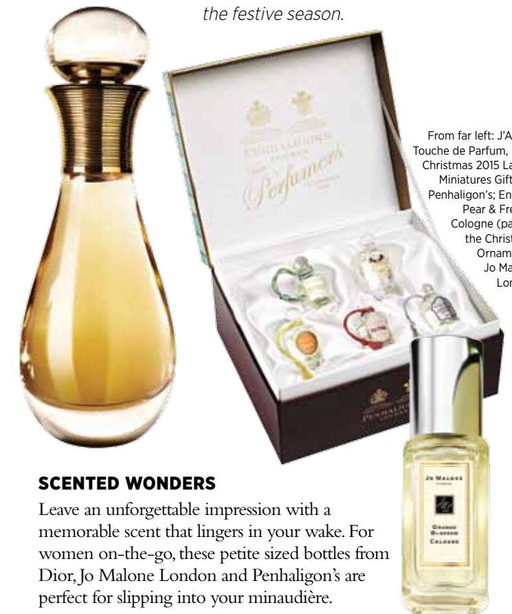
From far left: J'Adore Touche de Parfum, Dior; Christmas 2015 Ladies Miniatures Gift Set, Penhaligon's; English Pear & Freesia Cologne (part of the Christmas Ornament), Jo Malone London