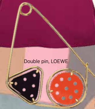
Double pin, LOEWE