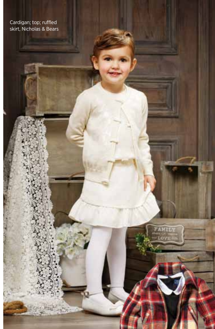
Cardigan; top; ruffled skirt, Nicholas & Bears