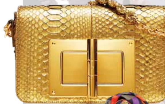
Bag, TOM FORD