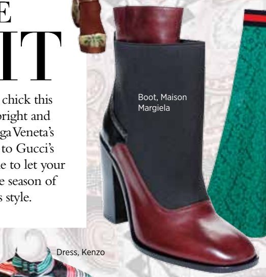
Boot, Maison Margiela