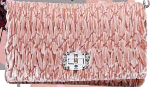
Bag, Miu Miu