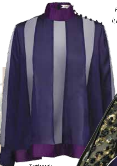
Turtleneck panelled blouse, MOISELLE