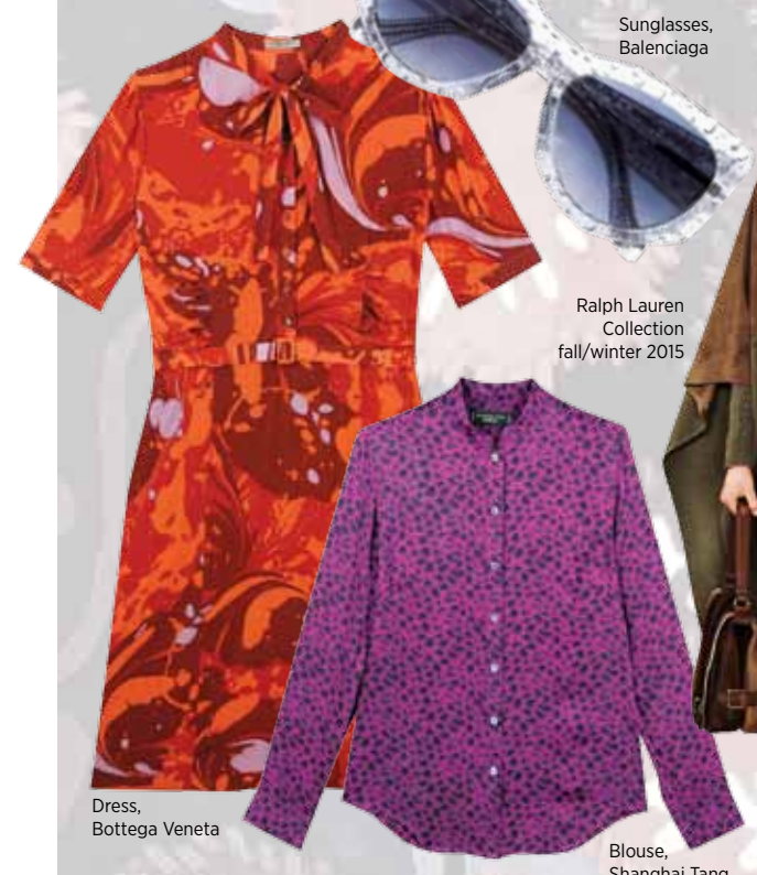
Dress, Bottega Veneta