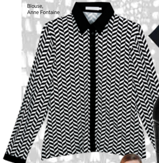
Blouse, Anne Fontaine