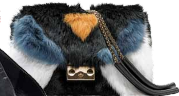
Bella Lapin bag, Furla