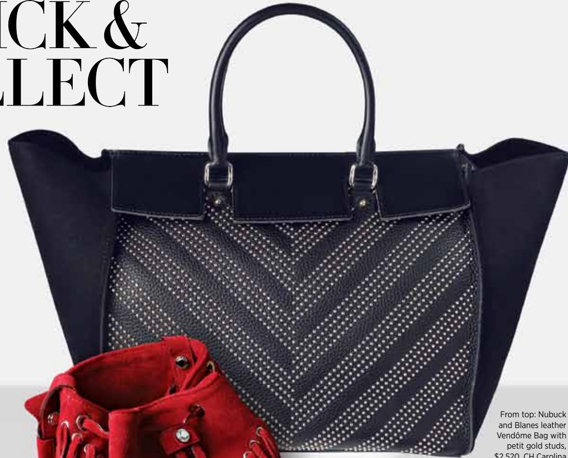
From top: Nubuck and Blanes leather Vendôme Bag with petit gold studs, $2,520, CH Carolina Herrera; suede Adula bag, $690, Sandro; perforated leather PSI medium bag, $2,960, Proenza Schouler

The new digital service at The Shoppes at Marina Bay Sands ensures you never miss out on its specially curated list of exclusive luxury offerings ever again