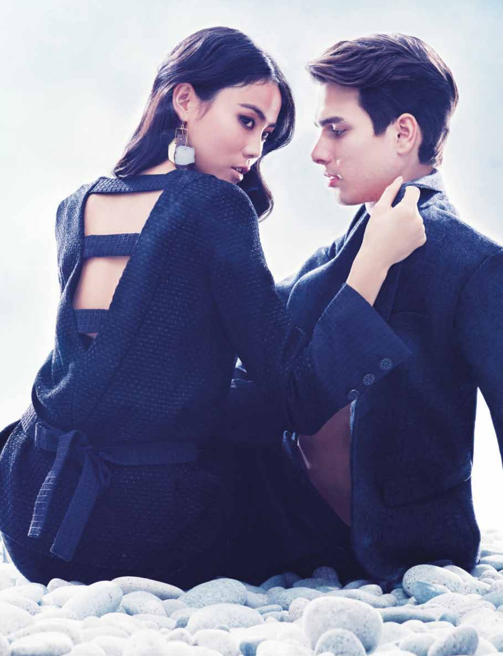
(On her) Embroidered lace dress; embroidered jacquard and leather pumps, Dolce&Gabbana. (On him) Printed silk jacket; cotton shirt; wool and cotton pants, Dolce&Gabbana. Calfskin shoes, Hermès OPPOSITE: (On her) Tweed jacket; tweed pants, Chanel. Brass enamelled patchwork earrings, Céline. (On him) Wool jacket; wool pants, Fendi