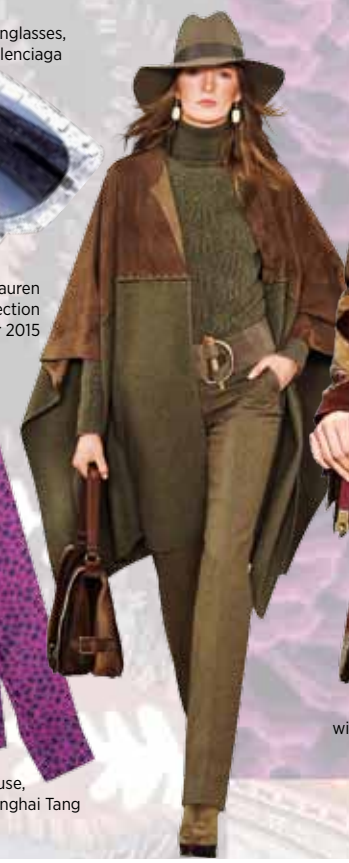
Etro fall/winter 2015