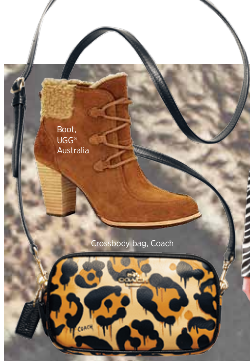
Boot, UGG® Australia