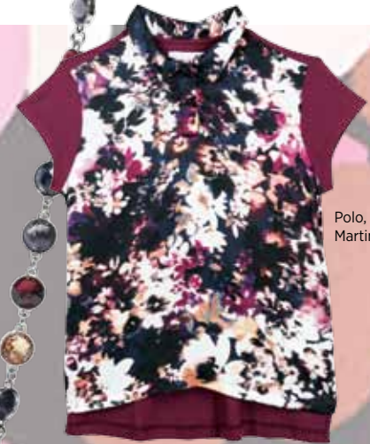
Polo, La Martina