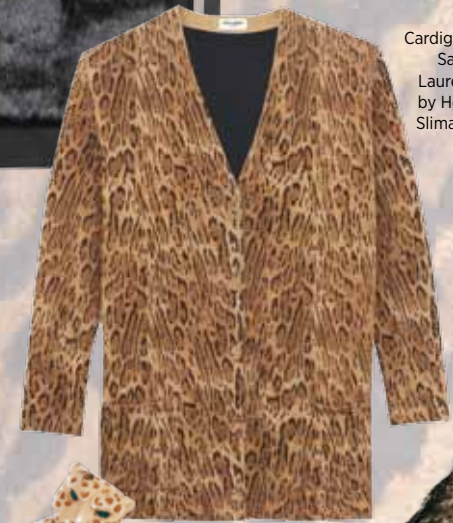
Cardigan, Saint Laurent by Hedi Slimane