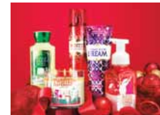
Holiday Traditions Collection, Bath & Body Works

From bath and body treats to a cute Hello Kitty manicure set, these Yuletide treats are sure to bring a sparkle to any beauty lover's eyes.