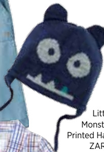
Little Monster Printed Hat, ZARA