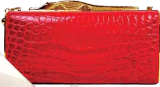
Signature Tin clutch, KWANPEN