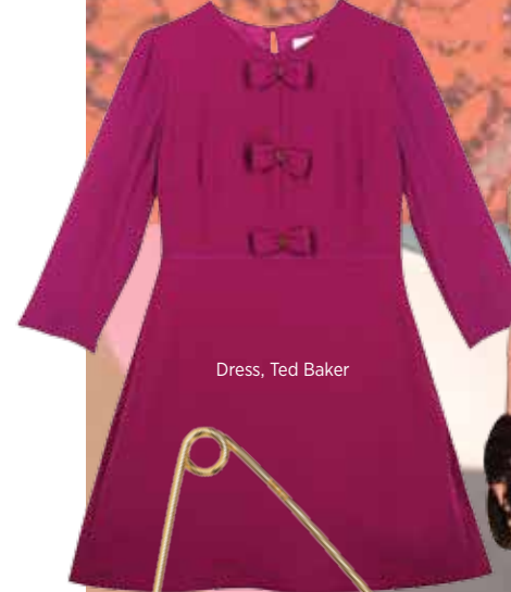
Dress, Ted Baker