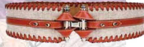
Belt, Givenchy by Riccardo Tisci