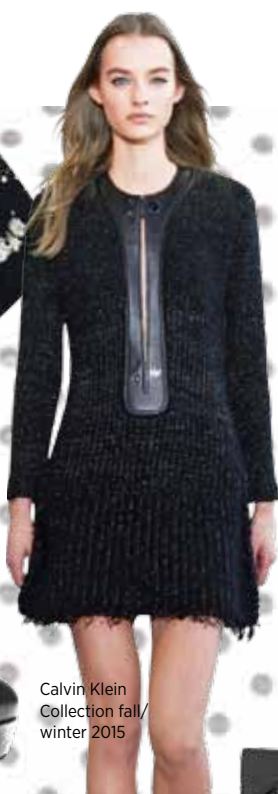
Calvin Klein Collection fall/ winter 2015