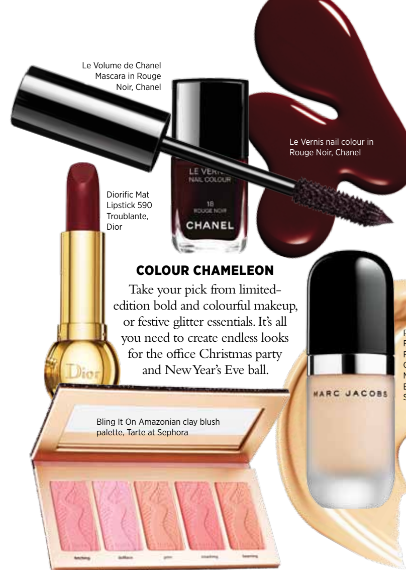
Le Volume de Chanel Mascara in Rouge Noir, Chanel