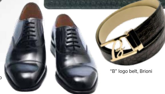
Calfskin Oxford shoes, Boggi Milano