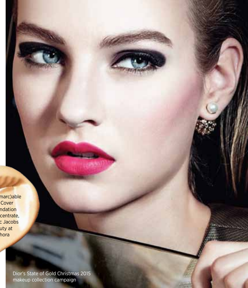
Dior's State of Gold Christmas 2015 makeup collection campaign