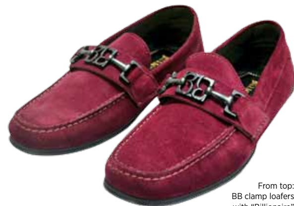
From top: BB clamp loafers with “Billionaire” embroidery, Billionaire Couture; Monte Carlo shoe, Louis Vuitton