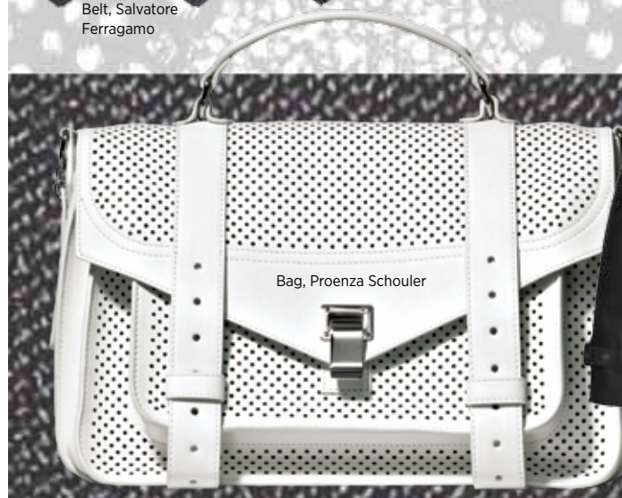
Bag, Proenza Schouler