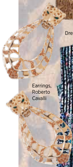
Earrings, Roberto Cavalli