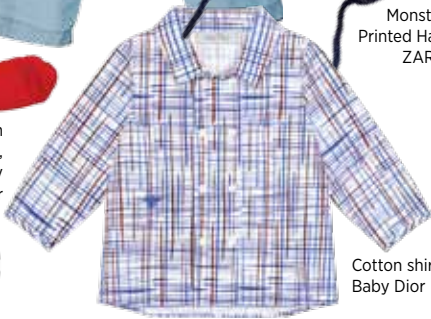
Cotton shirt, Baby Dior