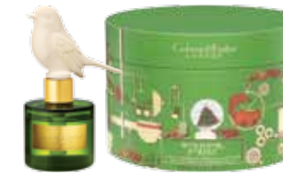
Windsor Forest Home Fragrance Porcelain Diffuser, Crabtree & Evelyn