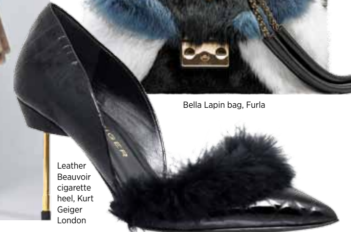
Leather Beauvoir cigarette heel, Kurt Geiger London