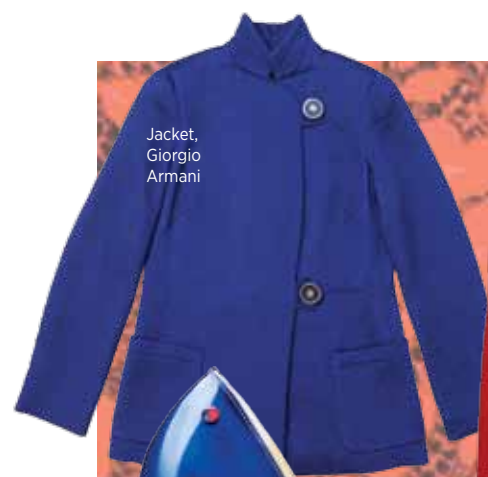
Jacket, Giorgio Armani