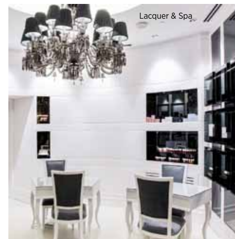
Lacquer & Spa

Leave an unforgettable impression with a memorable scent that lingers in your wake. For women on-the-go, these petite sized bottles from Dior, Jo Malone London and Penhaligon's are perfect for slipping into your minaudi re.