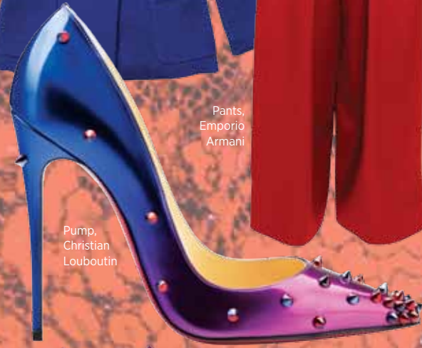
Pump, Christian Louboutin