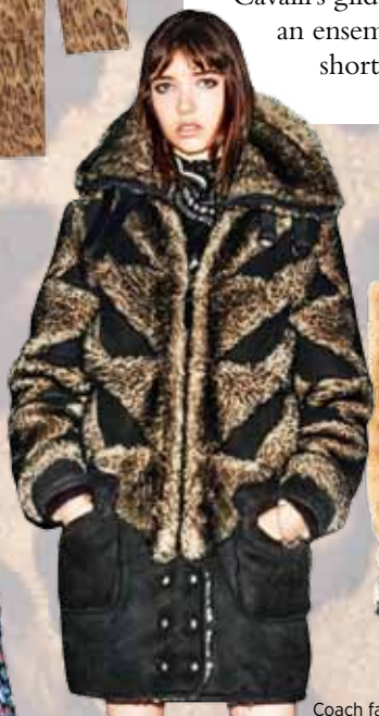
Coach fall/winter 2015