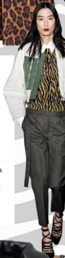
3.1 Phillip Lim fall/winter 2015