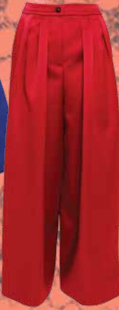
Pants, Emporio Armani