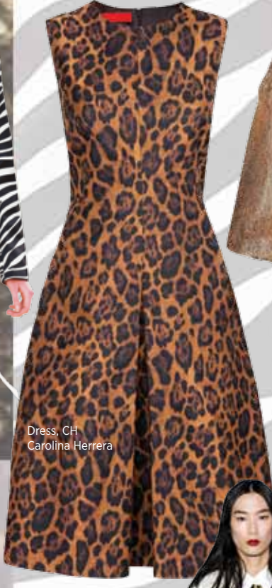
Dress, CH Carolina Herrera