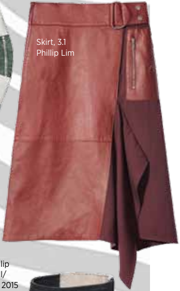
Skirt, 3.1 Phillip Lim