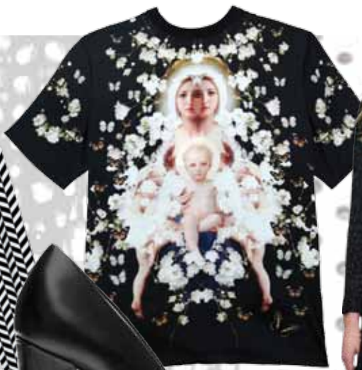
T-shirt, Givenchy by Riccardo Tisci