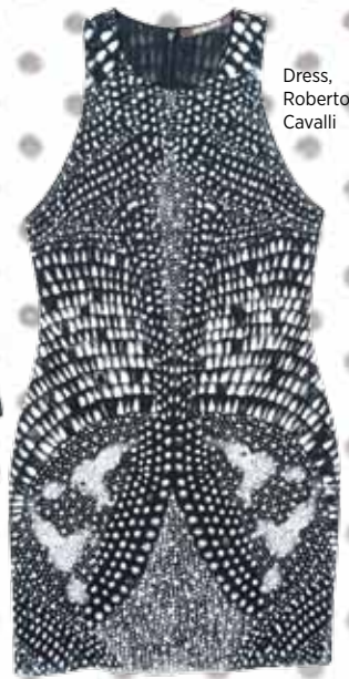
Dress, Roberto Cavalli