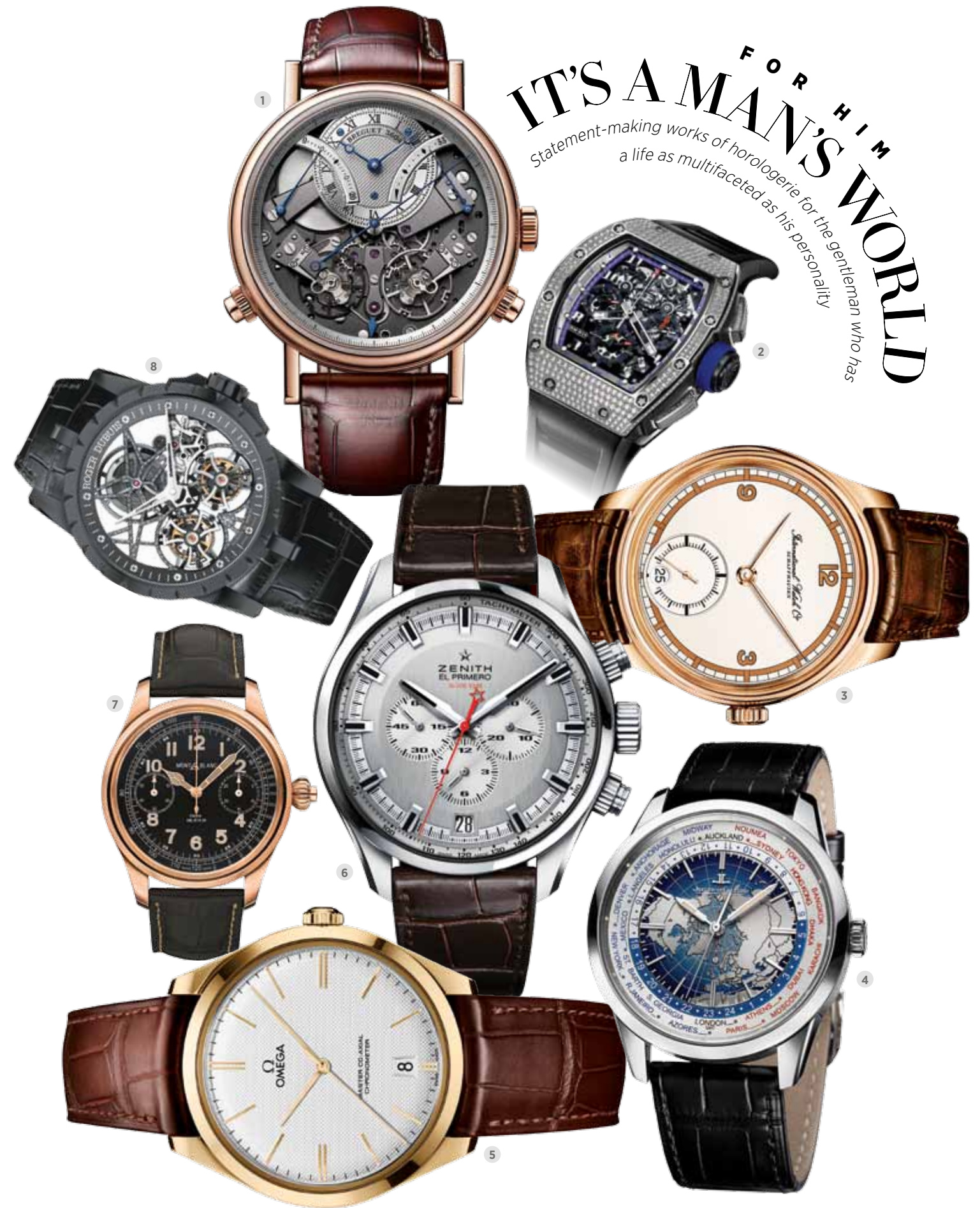
1. Rose gold Tradition Independent Chronograph 7077, Breguet 2. White gold and diamond RM 011 - Asia Limited Edition, Richard Mille 3. Red gold Portugieser Hand-Wound Eight Days Edition "75th Anniversary", IWC Schaffhausen 4. Stainless steel Geophysic Universal Time, Jaeger-LeCoultre 5. Yellow gold De Ville Tresor Master Chronometer, Omega 6. Stainless steel El Primero Sport, Zenith 7. Rose gold 1858 Chronograph Tachymeter Limited Edition 100, Montblanc 8. DLC titanium Excalibur Skeleton Double Flying Tourbillon, Roger Dubuis

Statement-making works of horologerie for the gentleman who has a life as multifaceted as his personality