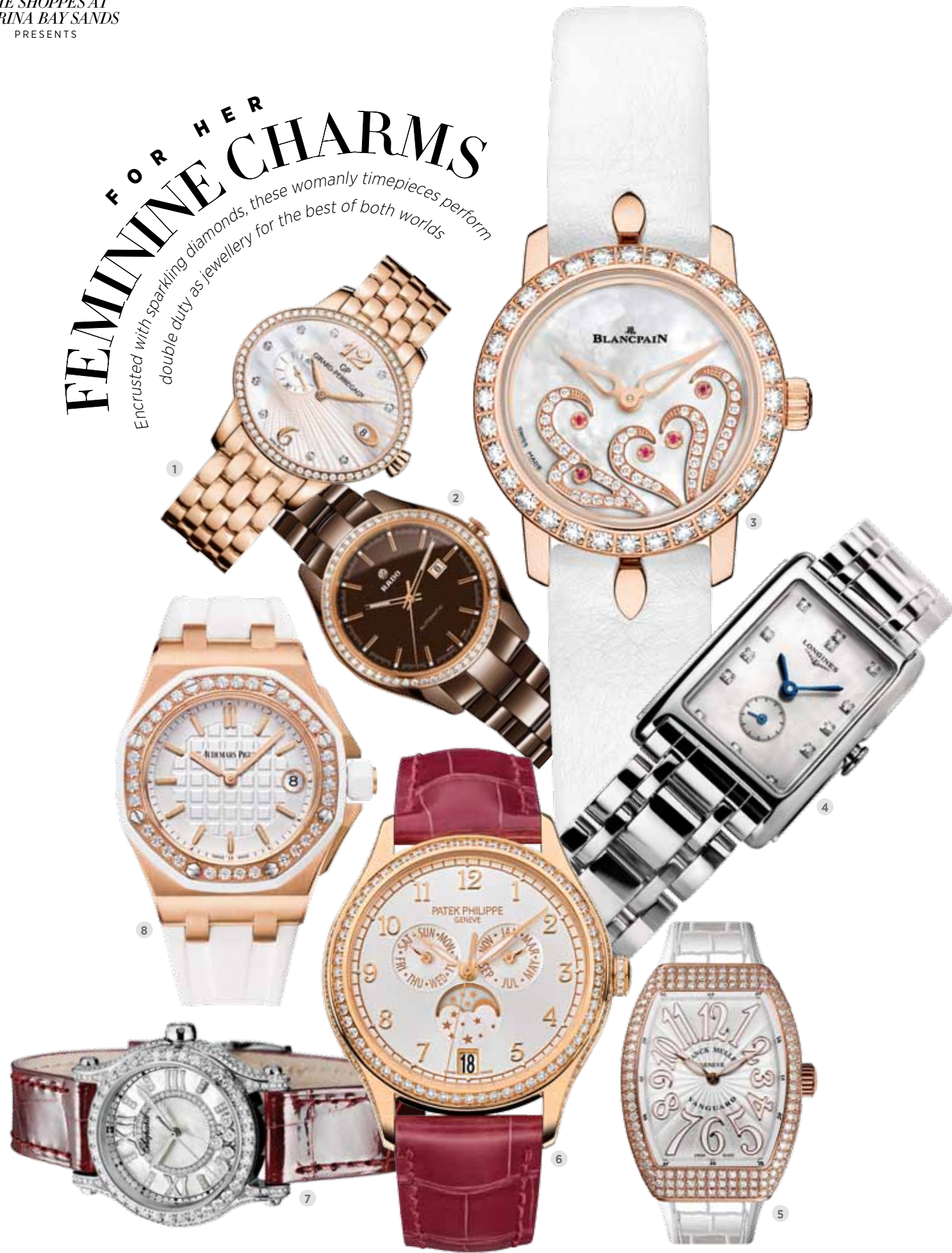
1. Pink gold and diamond Cat's Eye Small Second, Girard-Perregaux 2. High tech ceramic HyperChrome Diamonds, Rado 3. Red gold, ruby and diamond Women Ladybird Ultraplante, Blancpain 4. Stainless steel and diamond Longines DolceVita, Longines 5. Rose gold and diamond Vanguard Lady, Franck Muller 6. Rose gold and diamond Ladies Annual Calendar Ref 4947, Patek Philippe 7. White gold and diamond Happy Sport Mini Automatic, Chopard 8. DLC titanium Excalibur Skeleton Double Flying Tourbillon, Audemars Piguet

Encrusted with sparkling diamonds, these womanly timepieces perform double duty as jewellery for the best of both worlds