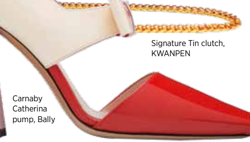
Carnaby Catherina pump, Bally