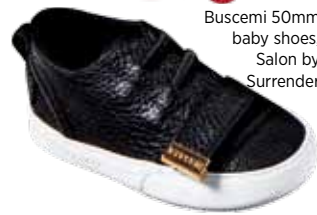
Buscemi 50mm baby shoes, Salon by Surrender