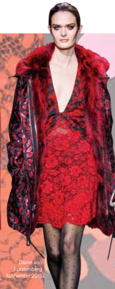
Diane von Furstenberg fall/winter 2015