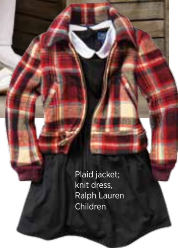
Plaid jacket; knit dress, Ralph Lauren Children

Take inspiration from the English countryside. Whether it's a touch of plaid or prairie-perfect ruffles, your mini trendsetter will be the star of any holiday soir e.