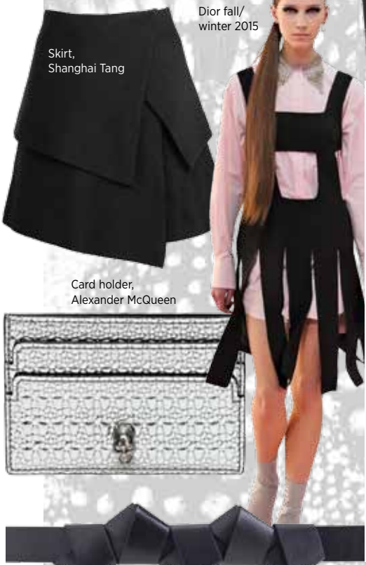
Dior fall/ winter 2015