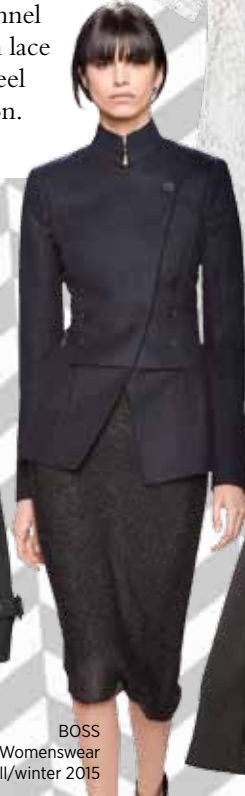
BOSS Womenswear fall/winter 2015