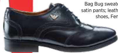
Leather brogue, Armani Junior

Looking dapper is as effortless as A-B-C when you have these on-trend pieces that are made especially for princes-in-the-making.