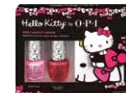
Coin in my Purse Duo Pack, Hello Kitty by OPI